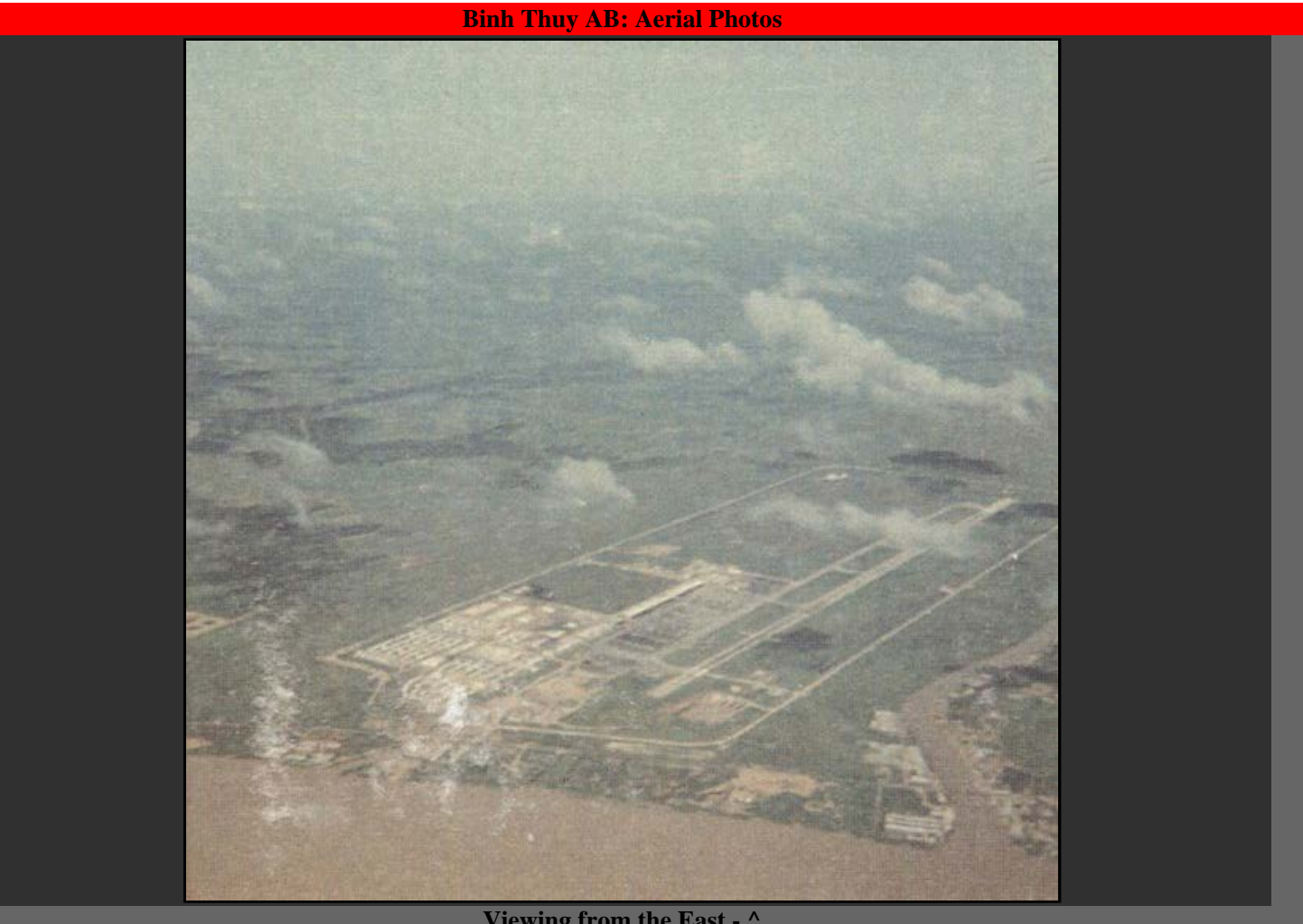
Viewing from the East - ^ Viewing from the South - v