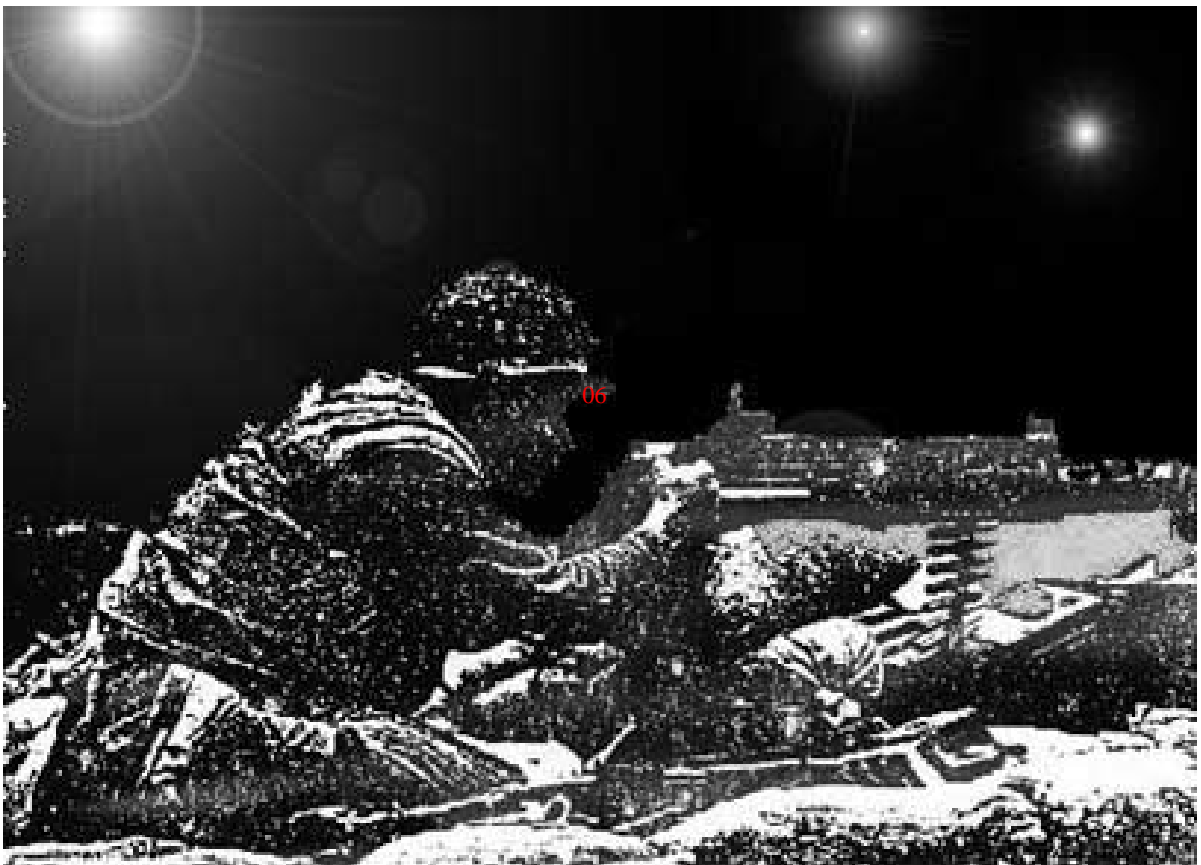
377th SPS fought through the night of Tet '68, blunting the strong enemy attack of over 1,400 VC & NVA soldiers.