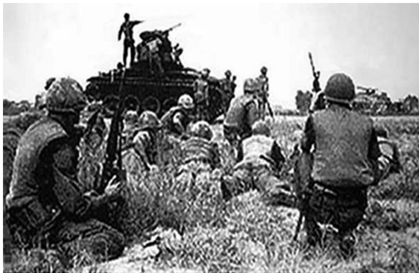
Members of the 377th SPS, supported by armor, move to resecure Tan Son Nhut AB after penetration by Communist forces on January 31st, 1968.