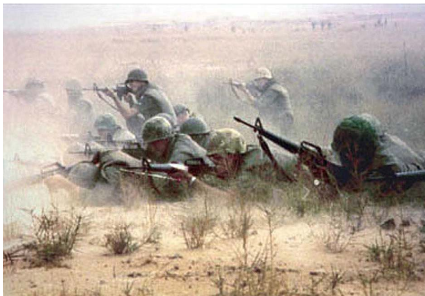
Members of the 377th SPS open up on Communist forces who infiltrated Tan Son Nhut AB during the Tet 1968 Offensive.

Tan Son Nhut Air Base: The NVA/VC attacked with four infantry battalions and a sapper battalion, their losses being 962 killed and 9 prisoners taken . The US losses were 19 US Army killed, 75 wounded, USAF losses 4 killed, 11 wounded, ARVN losses were 32 killed and 79 wounded. damage inflicted was 13 aircraft damaged.