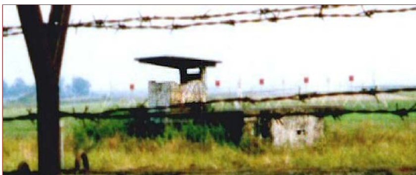
O51 Bunker, above, viewed from almost the same angle as the day the bunker was recaptured, but 30 years later.