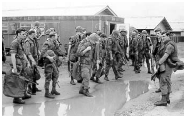
013. Early guard mount for devil Flt during Tet.