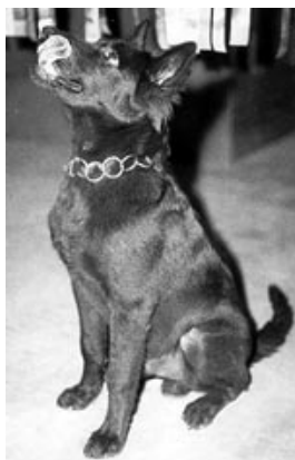
012. Looking for a treat... "Sweet Pea" Devil Flt mascot, probably went by a few other names too.