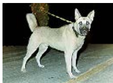
021 Sentry dog Luke on the job