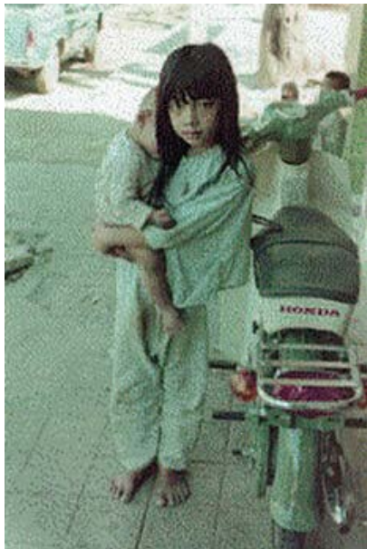
016. Little girl with baby in Can Tho.