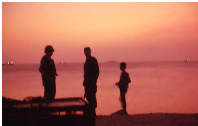
Binh Thuy, sunset at South China Sea. Freighter ships on horizon. MSgt Summerfield: 20