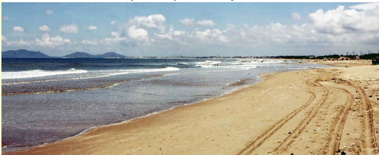
Binh Thuy, beautiful day at the beach. MSgt Summerfield 1969: 12