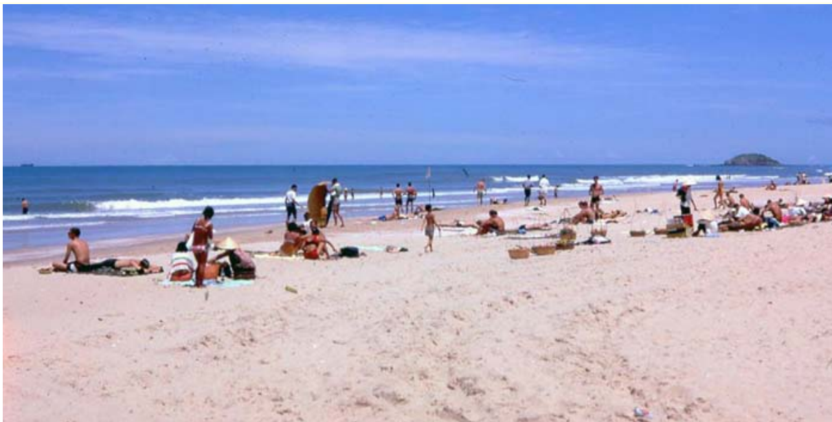
VT R&R B. MSgt Summerfield: 17