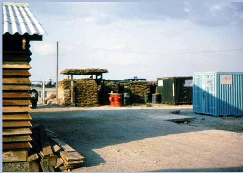
9. Bien Hoa AB, Armory Bunker.