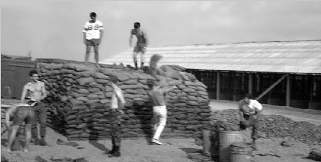
11. Bien Hoa AB, Perimeter Tower.