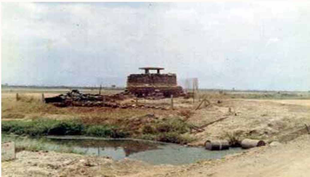
4. Bien Hoa AB, Bunker Hill-10.