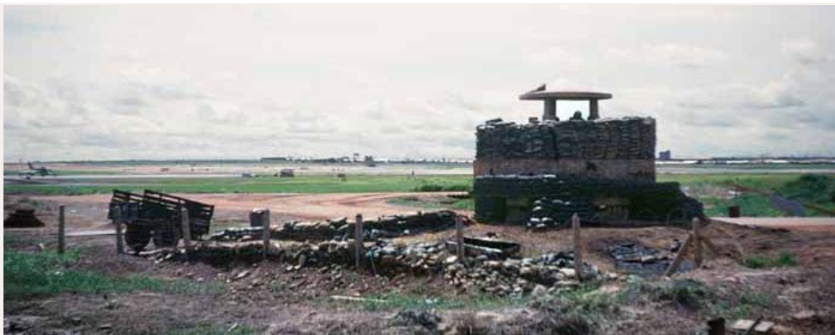
13. Bien Hoa AB, West Tower. Note the F-100 (extreme left-center), apparently being worked on. Bunker is on the West end of the runway and manned by USAF personnel. I think one of the armored cars hung out in this vicinity during alerts.