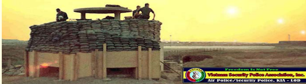
2. Bien Hoa AB, Bunker Hill-10. 1968. I took the photo just after Tet 1968.