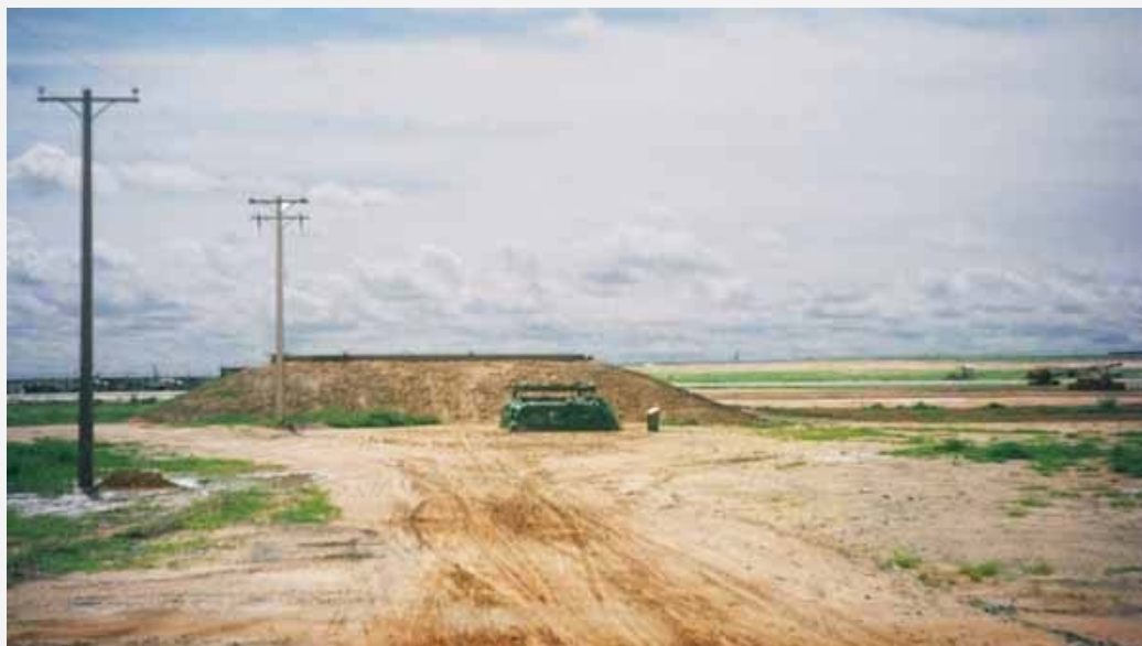
15. Bien Hoa AB, Bunker. The roofed sandbag bunker next to a large sandpile is also an American emplacement.