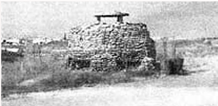
3. Bien Hoa AB, Bunker Hill 10. 1969-1970.