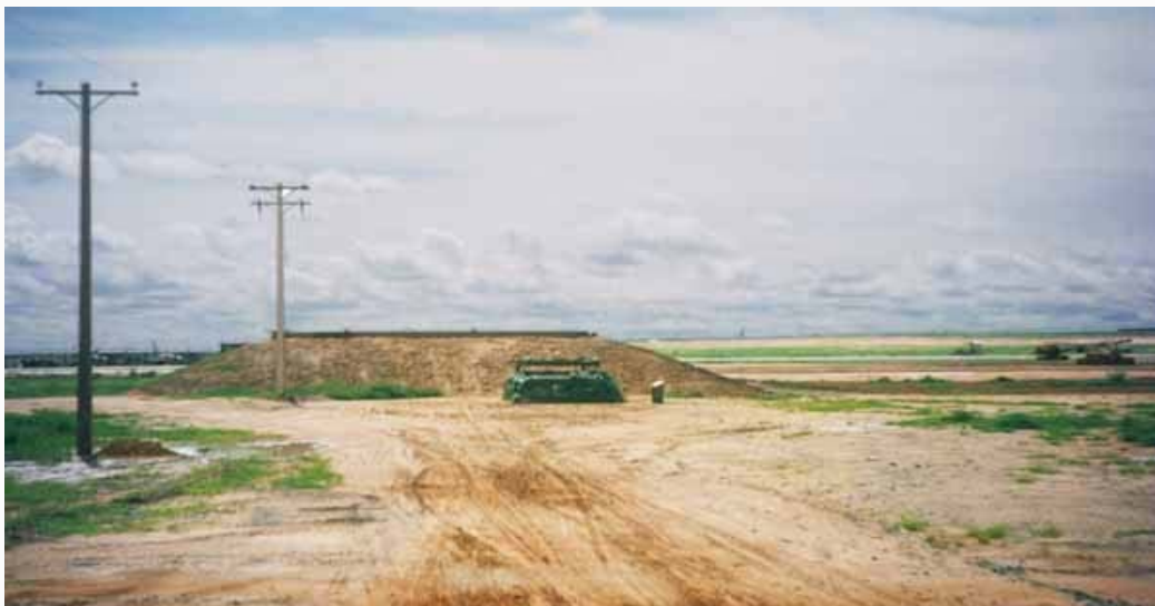
12. Bien Hoa AB, Bunker-1, with a shack next to it, looks like it may be ARVN or VNAF security.