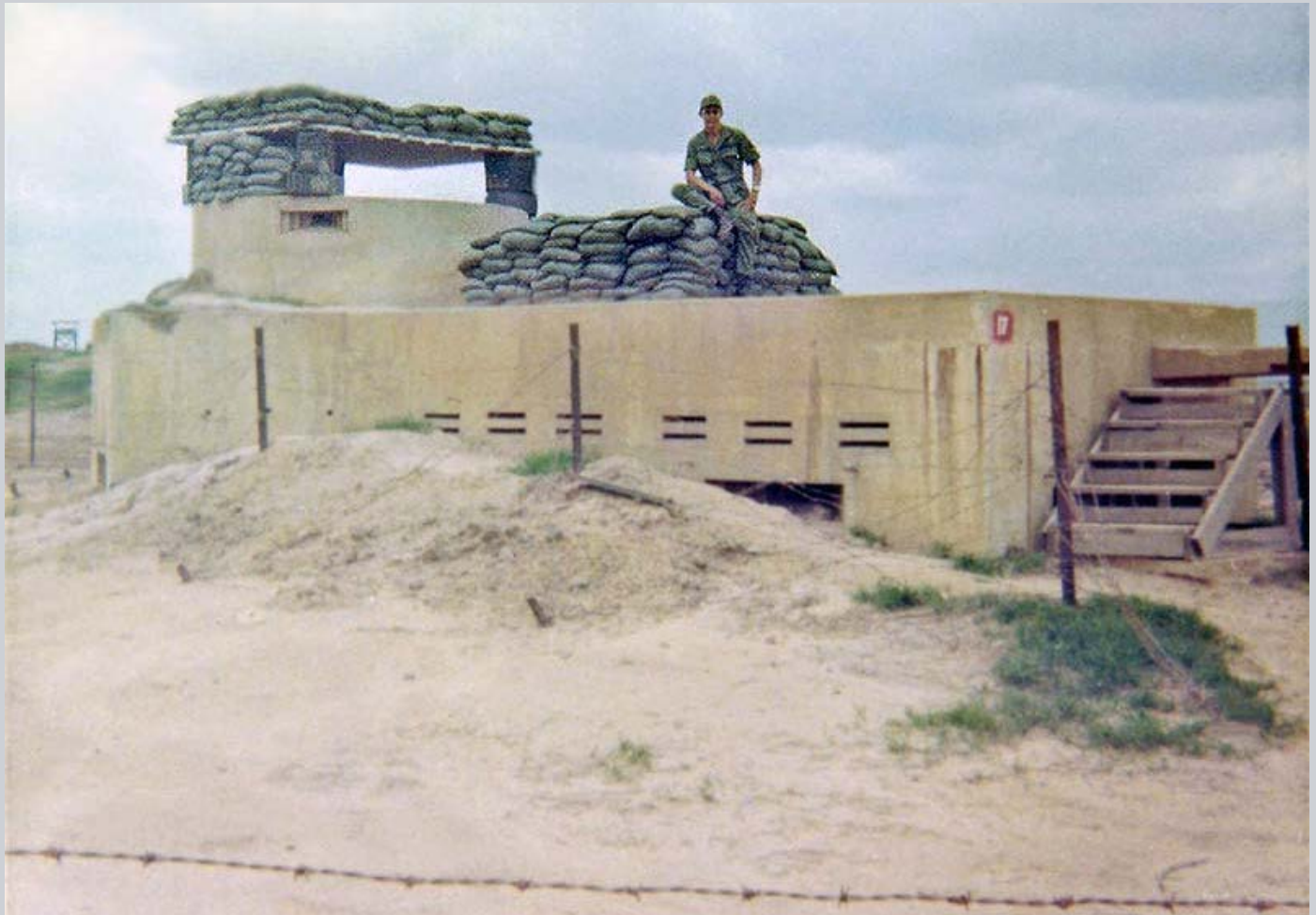
8. Bien Hoa AB, Bunker-17. Tower (center-left) 1966-1967.