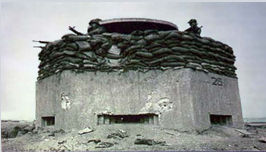
5. Bien Hoa AB, Bunker Hill-10 Perimeter Tower. 1968.