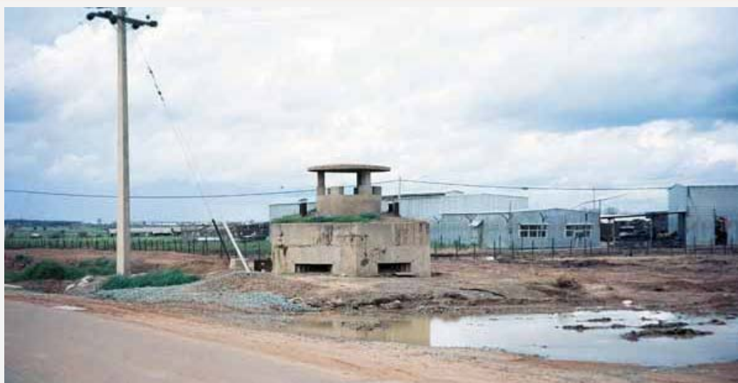
14. Bien Hoa AB, French Bunker-1 is a shot of the bunker across from the Red Horse cantonement area on the Southeast side of the base. We used it for late night hootenannies of beer, cigarettes and guitars. It was located between our barracks and the III corps Special Forces HQ.