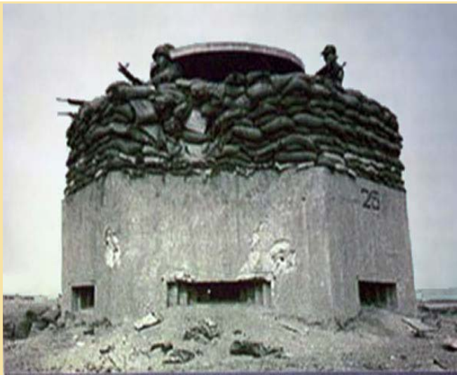
6. Bien Hoa AB, Bunker Hill-10. French Bunker.