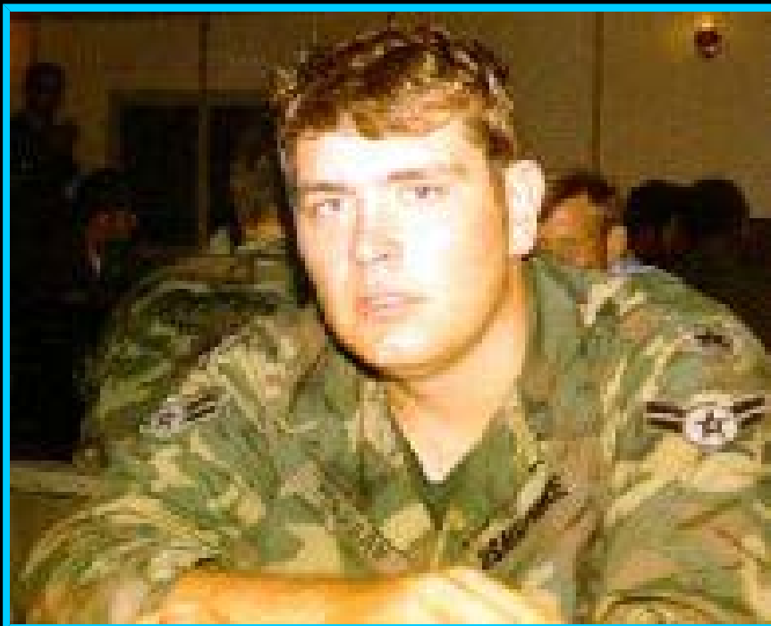
(And No... I wasn't in the jeep!)