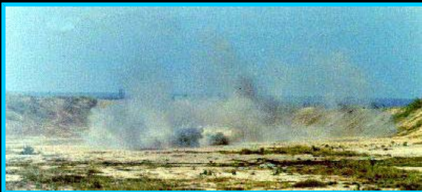
(8) Biên Hòa Range, 40mm: Rounds exploding down range.