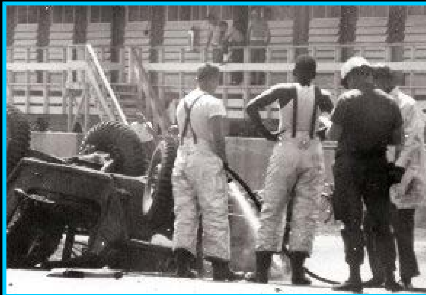
(3) SP jeep wreck. It was full of SPs returning from a party the South Vietnam Air Force SPs were giving for the 3rd SPS at the Officer's Culb. No one was killed, but several SP's were hurt.