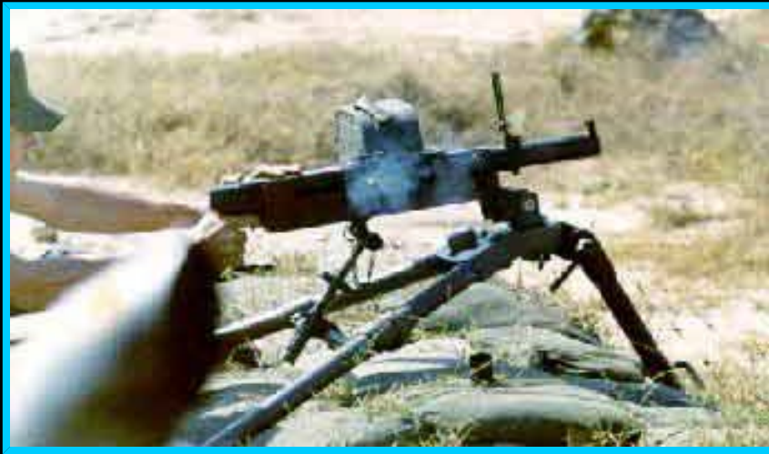
(7) Biên Hòa Range, 40mm: We had just gotten them checked out on them. I think they were called xm174's? They were mounted on the A.P.C.'s just in time for the TET season.