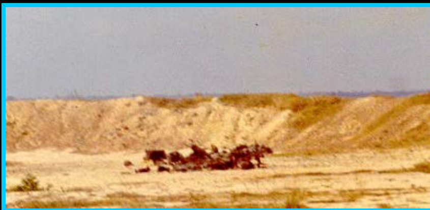
(9) Biên Hòa Range, 40mm: This is what is left of a jeep. I don't know if this jeep was the jeep the SP's wrecked. Maybe they wanted us to get rid of the evidence!! HA. By today's standard's, the 40mm (XM174) is an antique, but in 1970 they were AWESOME!