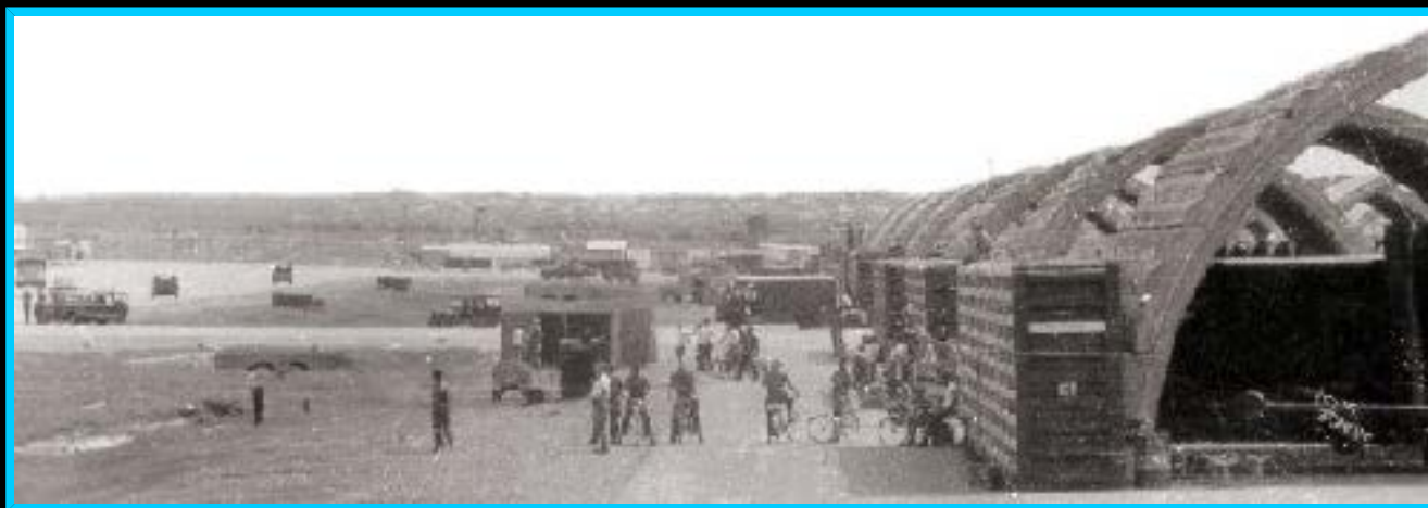
(1) BienHoa flight line: In flight emergency coming in!