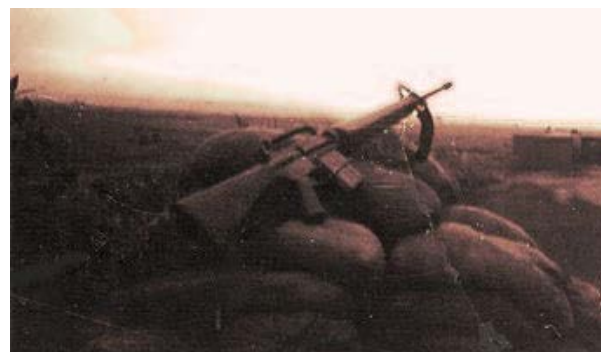
Photo by Paul Huff., Oct 22, 1972 (sunrise): Sandbag post position, between flight line and Baker-2, in the Bomb Dump area. We were hit by Rockets and Sappers. These posts were new dye ti ab ubcrease ub ebent activity and after the attack. My M16 was #057.

Biên Hòa AB Attacks! Biên Hòa 1972-73 by: Paul Huff Copyright © 2000