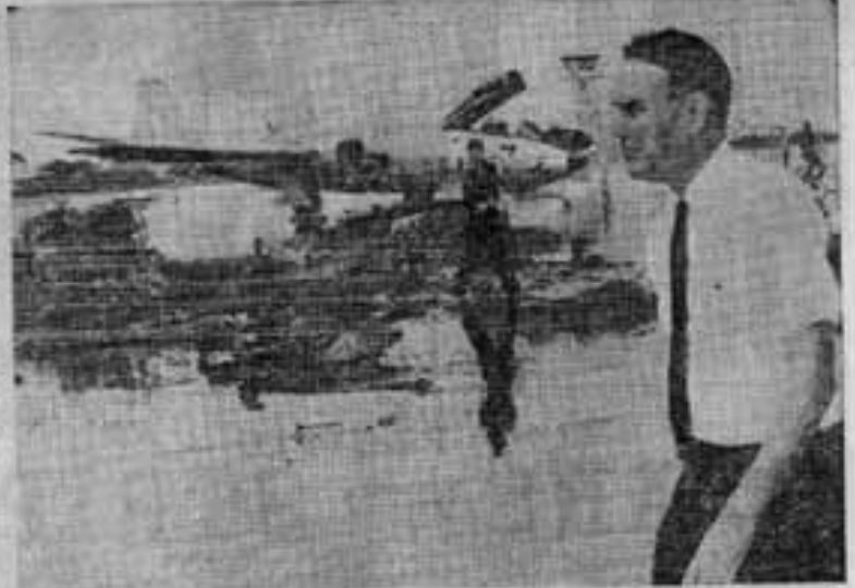
Barracks at Bien Hoa AB near Saigon suffered direct hits by communist Viet Cong mortar fire. Ambassador