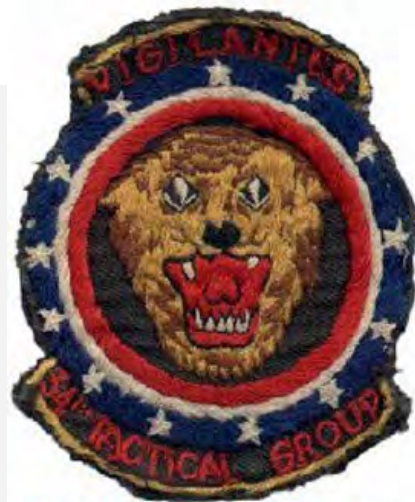
34th Air Base Group, Air Police Squadron, Bien Hoa AB/ Qui Nhon AB (1964-1965), 6220th Air Base Group/33rd Tactical Group APS Tan Son Nhut Air Base (1962-1963)