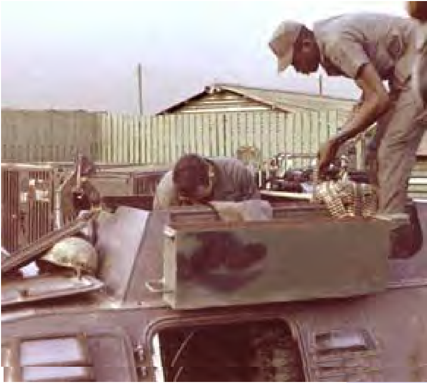
2 - Not a great shot, but close examination shows these SPs preparing a minigun for night duty. Woe to Charley if he encounters this team tonight.