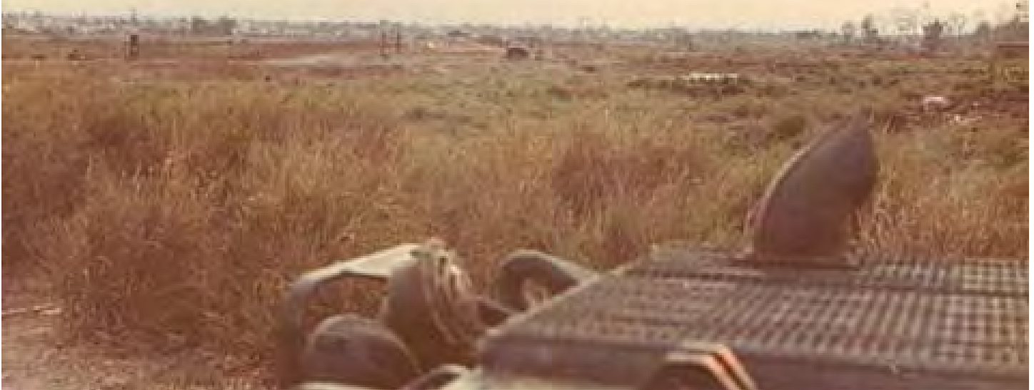
3 - I took this from the driver's seat of "Fluffy" our beloved Armored Personnel Carrier, M113. This is the North West perimeter area.