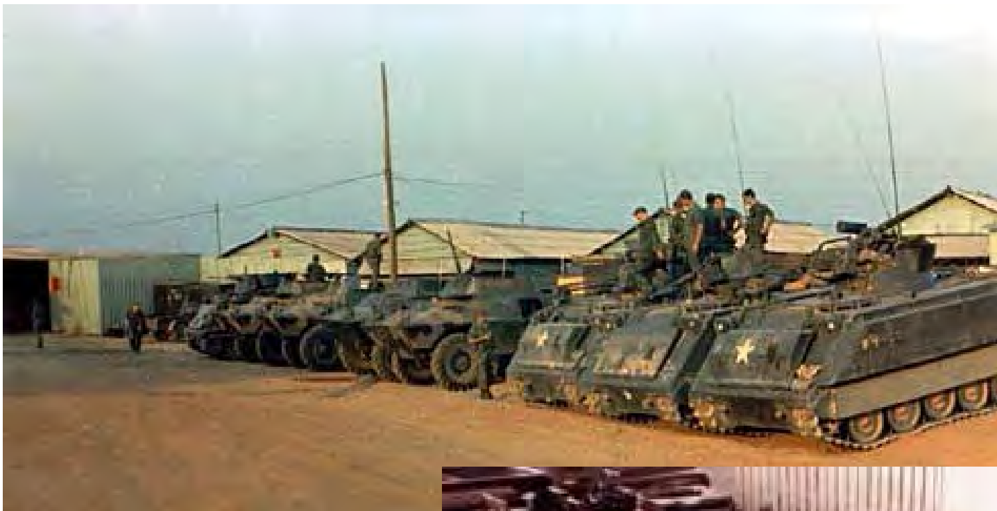
Photo-8 (above) – The three APCs on the right were among the elements of the 11th Armored Cav brought in to support the 3rd SPS in preparation for the Tet Offensive of 1969. There was also at least one tank, not shown here. During the lengthy rocket attack of the night of February 23rd, the tank crew members disobeyed orders from Lt. Col. Fowle, our squadron commander, and fired their big gun into the town of Bien Hoa.