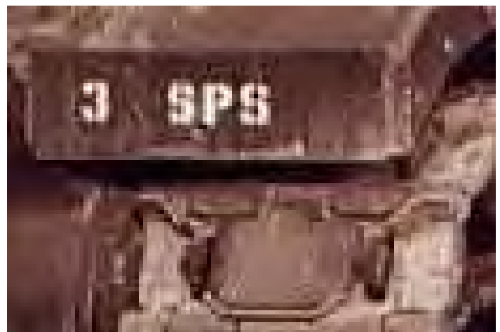
3rd ACAV of the 3rd SPS