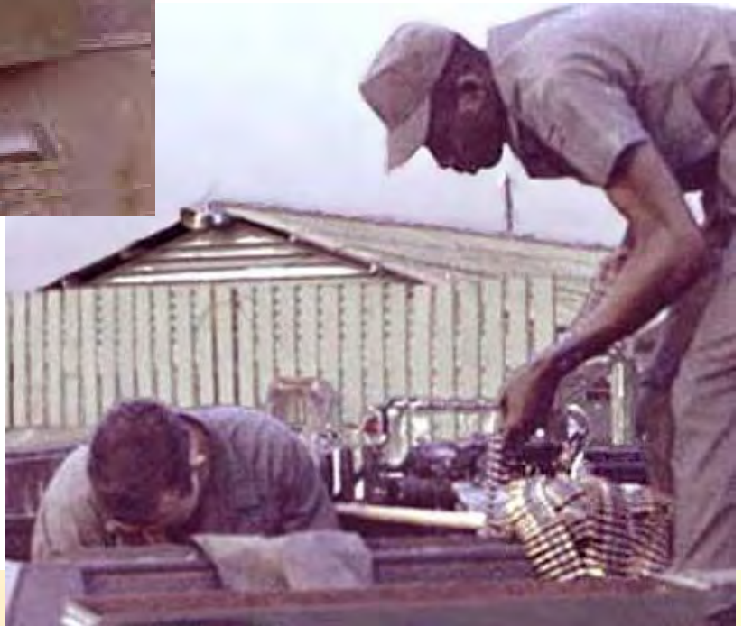
Our miniguns were slowed down to fire 3,200 full metal jacket rounds per minute.