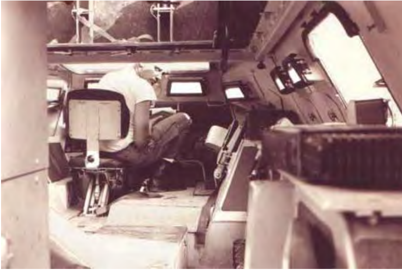
4 - Inside a "commando car." Note the knobs and ports through which SPs could fire their M16s. Anyone remember this man's name?