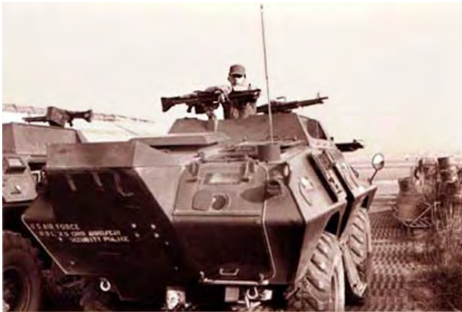
5 - G. Ernest Govea, behind an M60 machine gun on a commando car of the 3rd ACAV of the 3rd SPS.