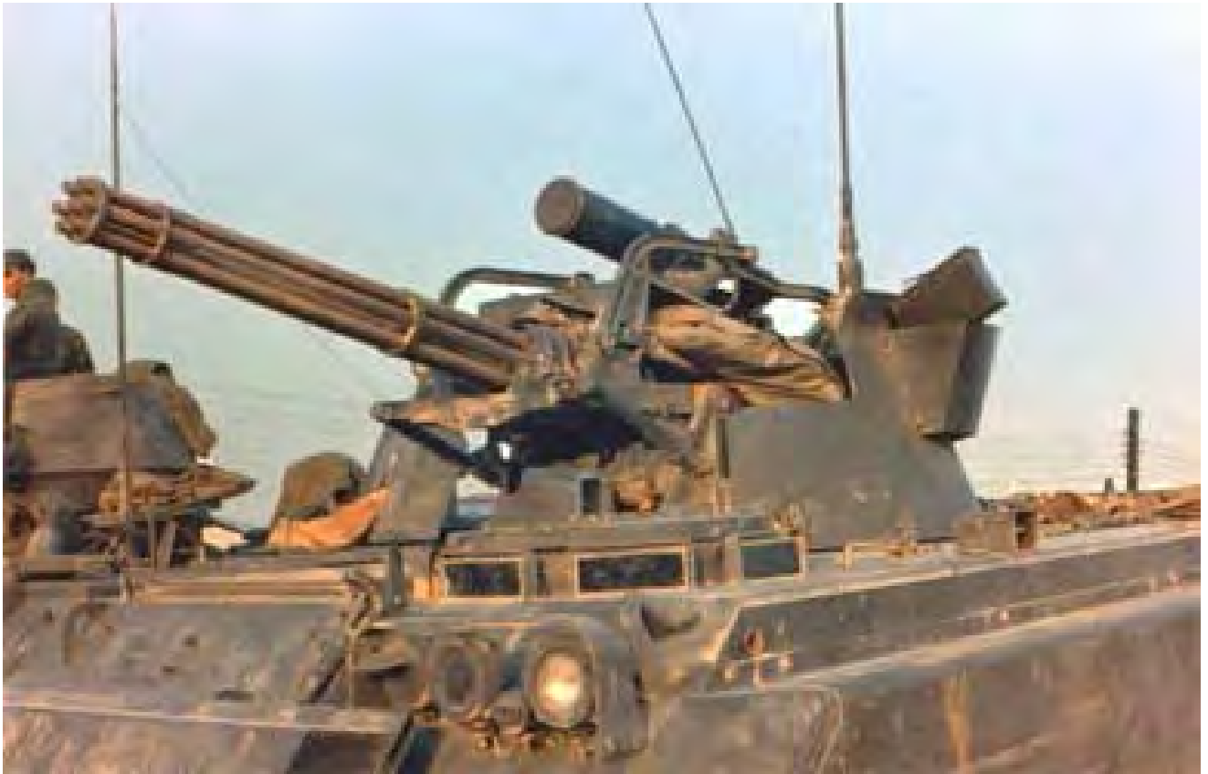
10- US Army firepower from these Vulcans was awesome.