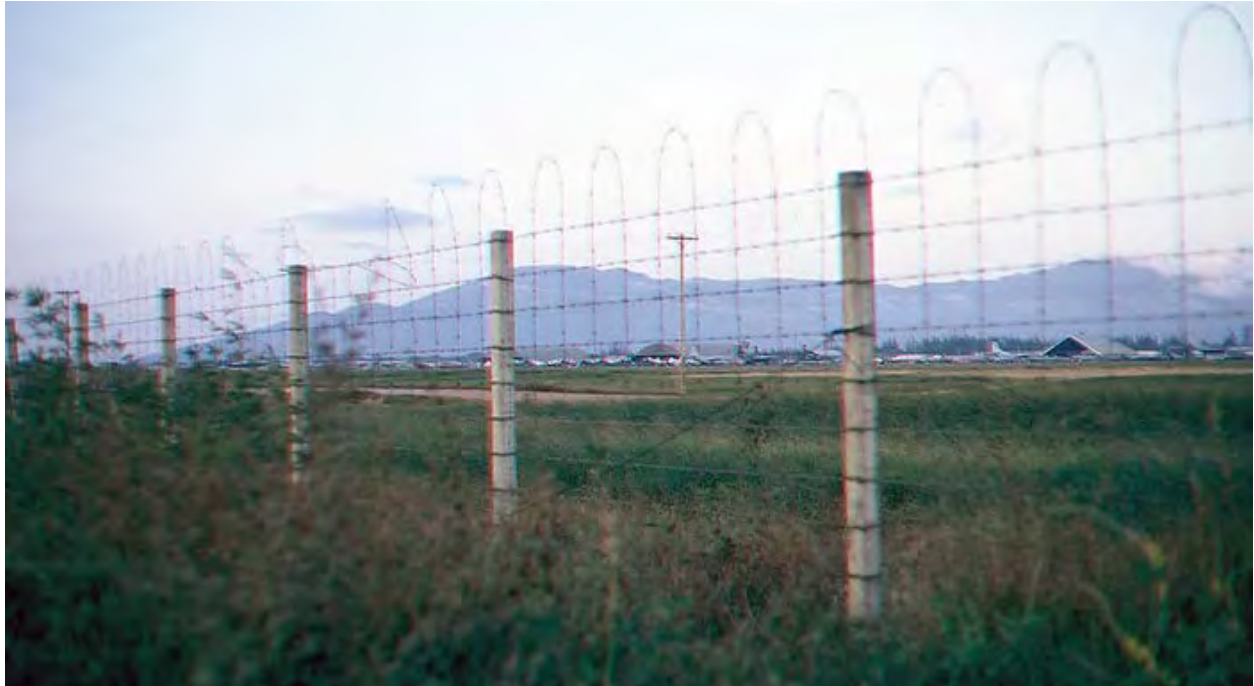
I found my old bomb dump photo taken in 1965 (see below). A slightly different camera angle, but the mountains, and Monkey Mountain are the same, the bent inward barbed fence hoops, the large tree, and a like a tree shaped like a round bush is the same (see prior photo with the three officers). That is exactly where I stood eons ago.