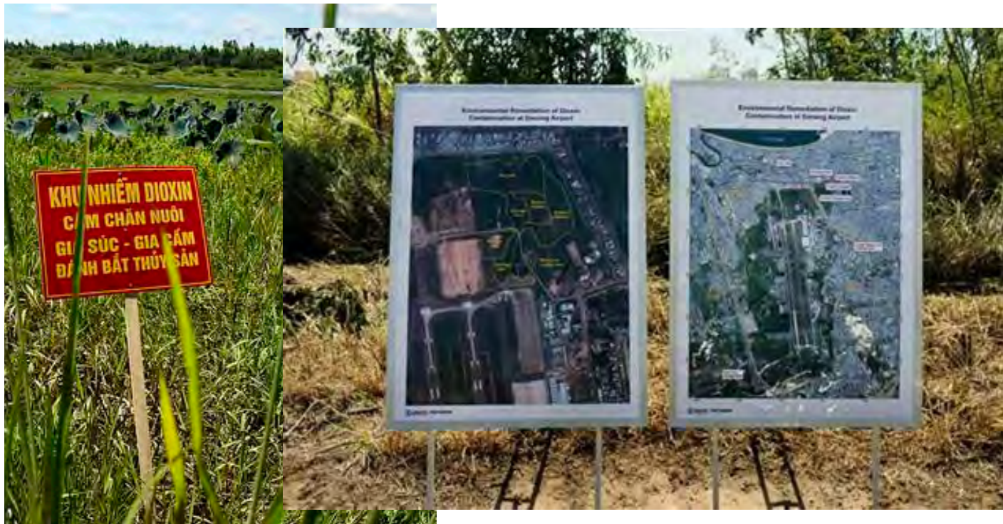
(Photos above left/right & below) Field sign warns of Environmental Remediation of Dioxin Contamination at Đà Nẵng Airport. Satellite map enlargements portray contamination area locations; VN Officer points to and discusses what was the old marshland, off the north end of the runway.