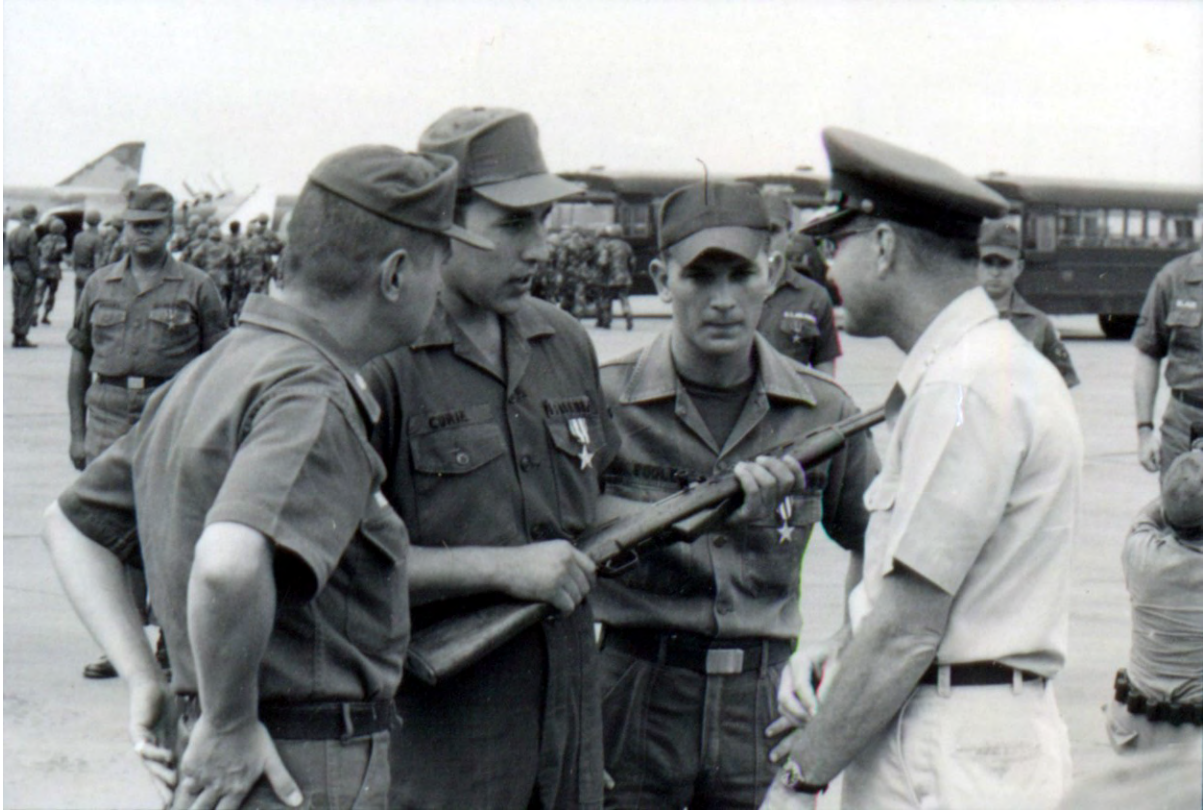
Photograph courtesy of Lt Grove C. Johnson Commander, 377 th Air Police Squadron, 1966 – 1967