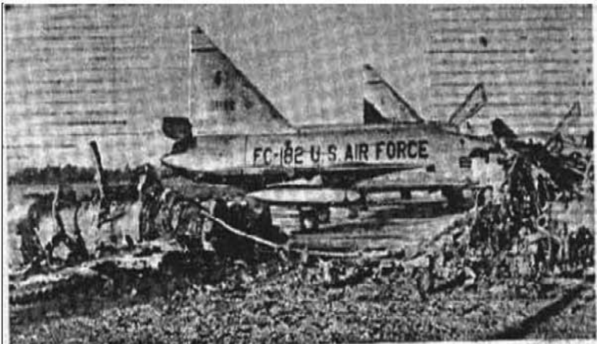
VIET CONG SURPRISE ATTACK ON DA NANG AB DESTROYED F-102 DELTA DAGGER (FOREGROUND).