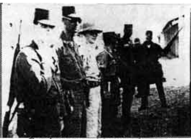
Guardmount, participants unknown, maybe you recognize someone