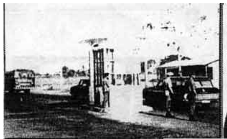
Tan Son Nhut main gate in 1963