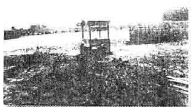
the Amno Dump