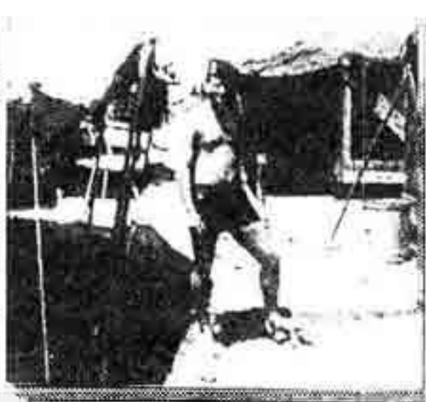
Mole Aniske of the Back Cancil