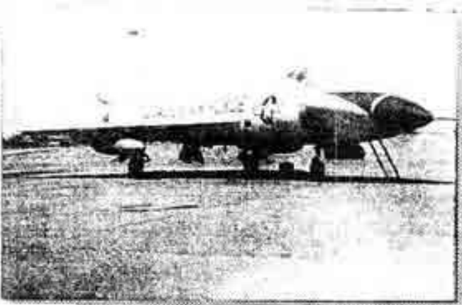
F-102 Aircraft on the flightime