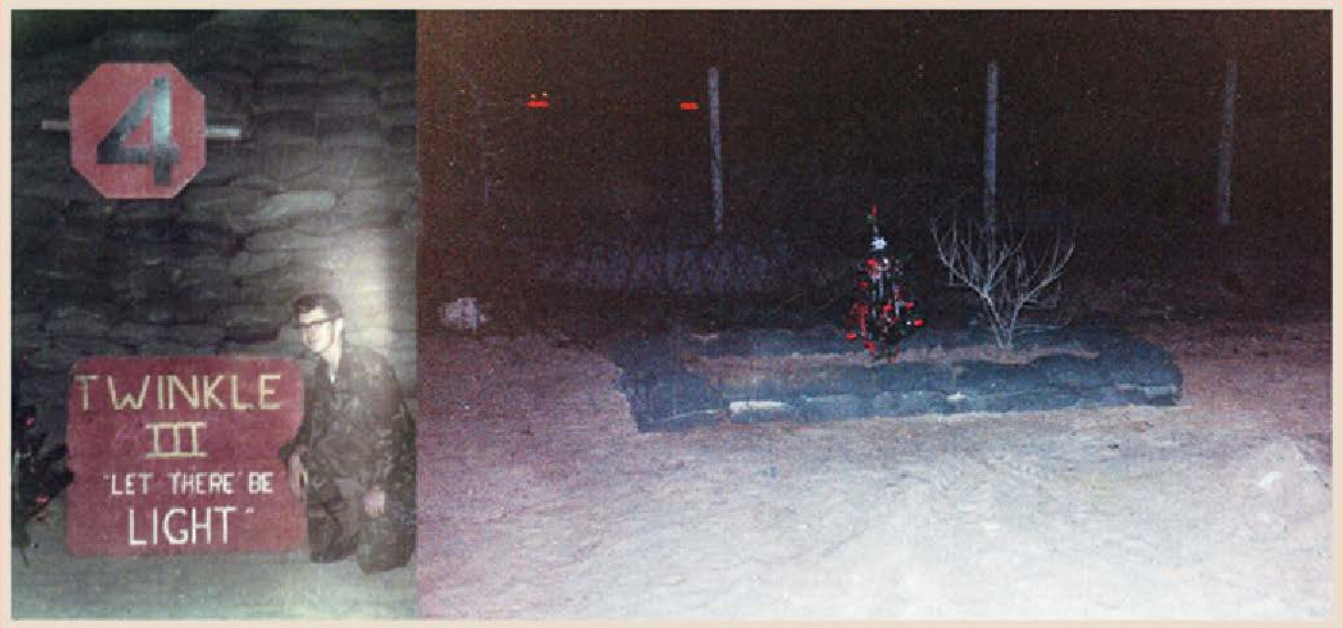
1969 - Bien Hoa - 3rd SPS Sgt Robert "Gary" Whisnant - Charlie Area Twinkle III Mortar Site Christmas Tree