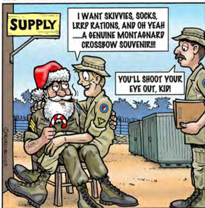
A VIETNAMESE CHRISTMAS STORY!