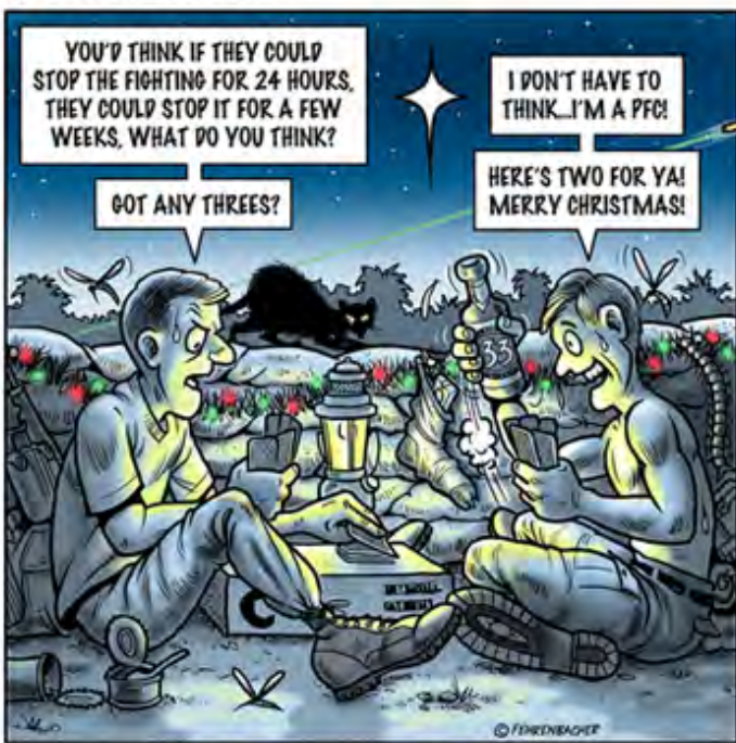
THE 24-HOUR CHRISTMAS CEASE-FIRE.