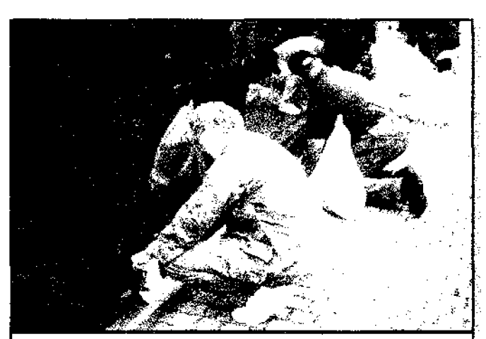
Members of VSPA place objects that they brought at the walf as they pay their respects to the Security Police whose names appear on the wall