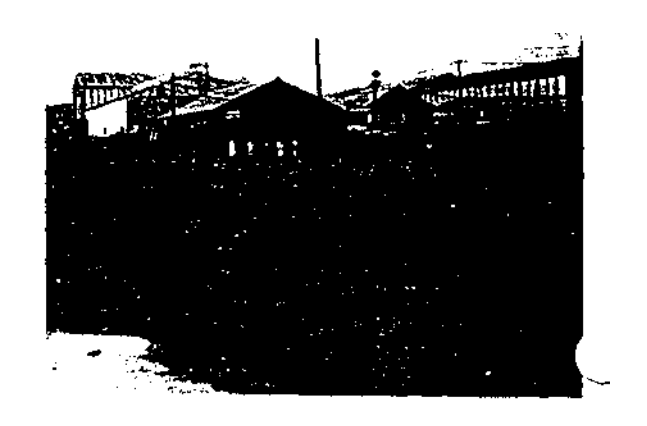
PHAN RANG AB