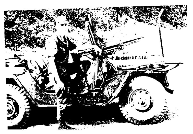
IS THIS ENOUGH TO KICK SOME SERIOUS BUTT OR WHAT?