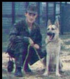
[7] Hey... wanna pet'em? I wan'ta feed'em early tonight.