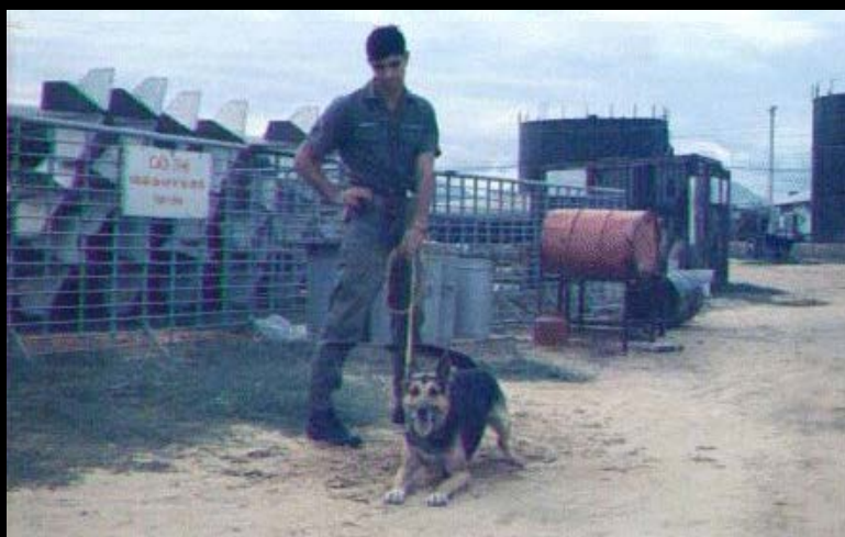
[6] Down Boy... wait 'till he's not lookin' then scare the...