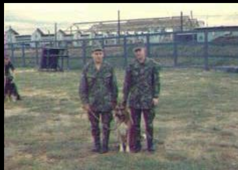
[8] Hey, You---with the camera... ya got'a one-second head-start!