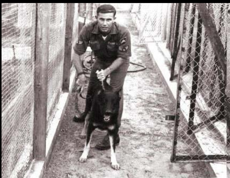
[10] The way outta here? Why... right through that chain-linked gate to your right--my left--partner. (Now, who said those K-9 pukes weren't friendly?)