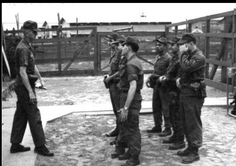
[4] Guardmount prior to post assignment with vicious K-9 Sentry Dogs. Airman, I know I said there's no such thing as a STUPID Question ... on the other hand....