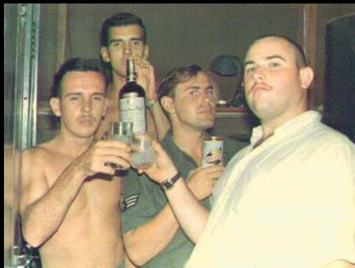
[11] Off Duty! Pain-ing No Feel... Felling No Pin ... Feeling No Pain!