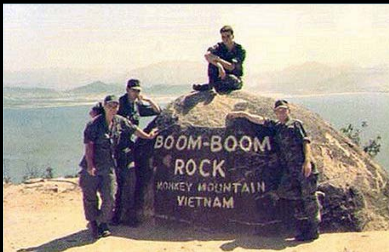
[1] Monkey Mountain, overlooking Đà Nẵng AB, RVN, 1969.