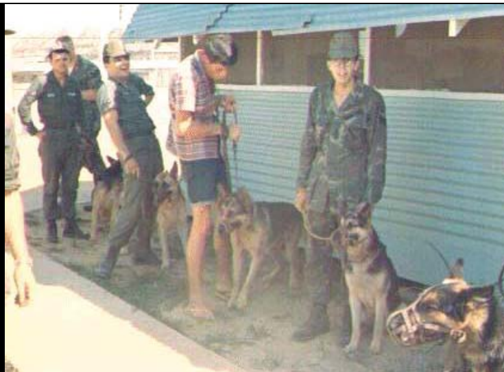
[5] Hurry up and wait.