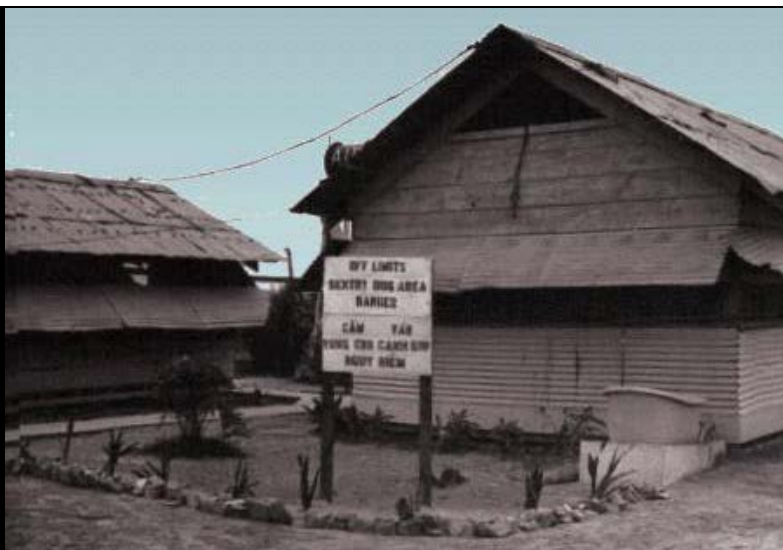
[3] Headquarters for the 366th SPS K-9, Đà Nẵng Air Base, 1969. 'Vietnam Beautiful' Project pays off for K-9 landscaping! (Note the bathtub to the right in the garden)