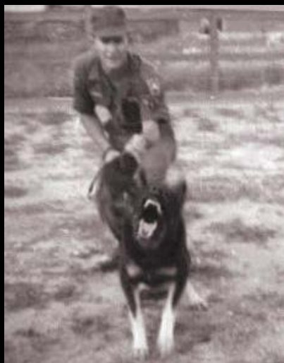
[9] Time's UP!