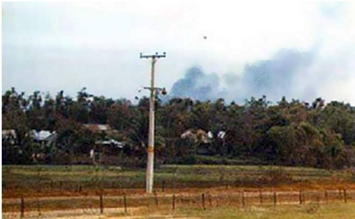
7. Đà Nẵng AB: Airstrike as viewed from East perimeter. Dog Patch village in fore ground of trees and jungle. No Man's land between village and wire. Farmers and kids occasionally wandered in the area alone or with water buffalo grazing. Trees were cut back and defoliated for a clear fire zone. Photo by Alan Ellison, 1968.