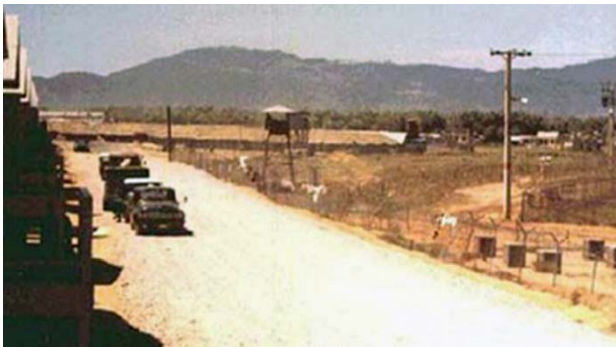
5. Đà Nẵng AB: Đà Nẵng's east perimeter: Towers, Bunkers, minefields, SP K-9, and Marines. Photo by Alan Ellison, 1968.