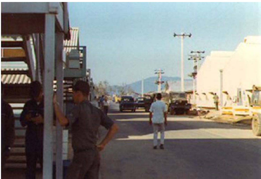
3. Đà Nẵng AB: Gunfighter Village, Camp Road (East). Photo by Alan Ellison, 1968.