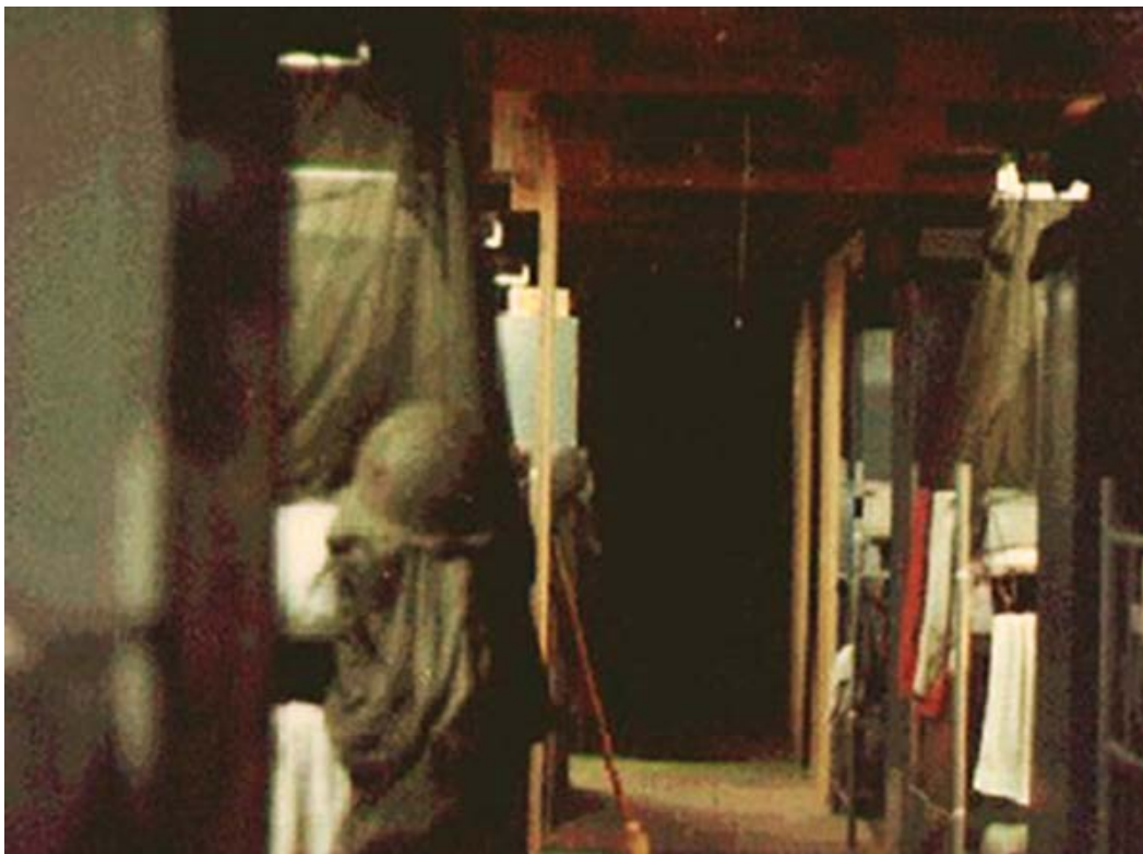
2. Đà Nẵng AB: Inside of SPS Airmen's barracks. Photo by Alan Ellison, 1968.