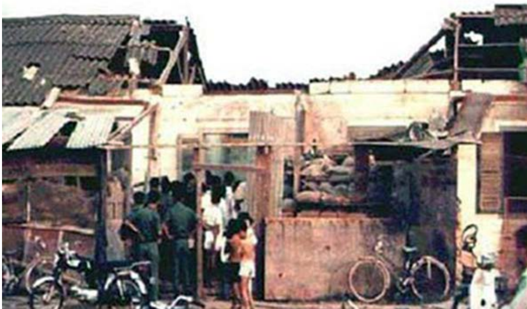
10. Đà Nẵng AB: ARVN Housing rocket damage. Photo by Alan Ellison, 1968.