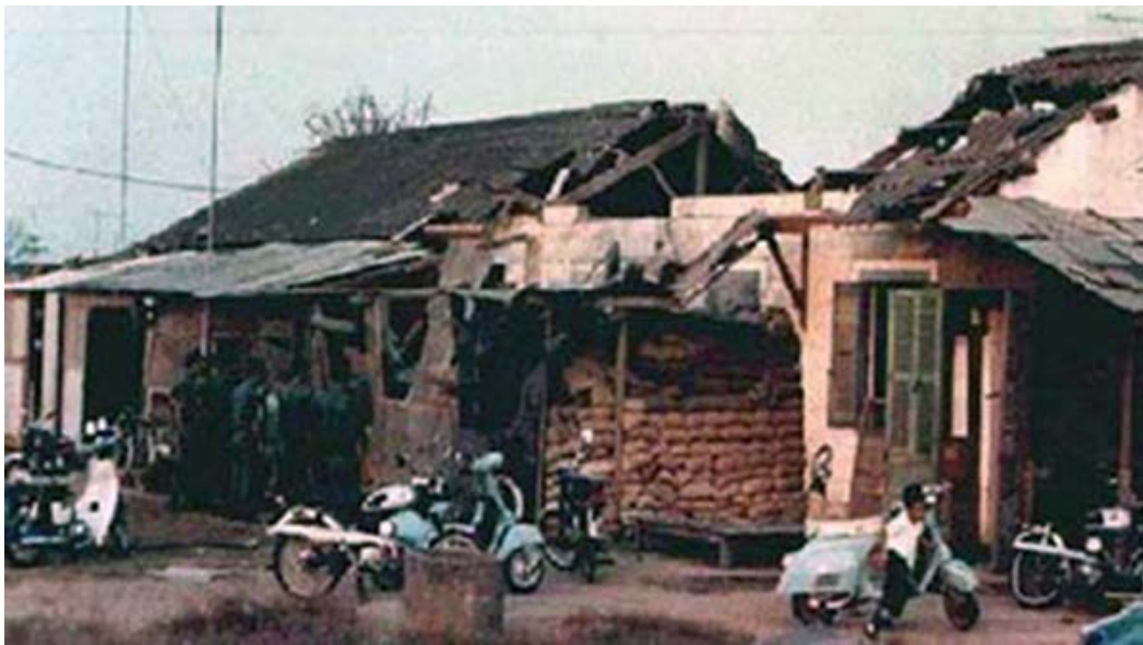
9. Đà Nẵng AB: ARVN Housing rocket damage. Photo by Alan Ellison, 1968.