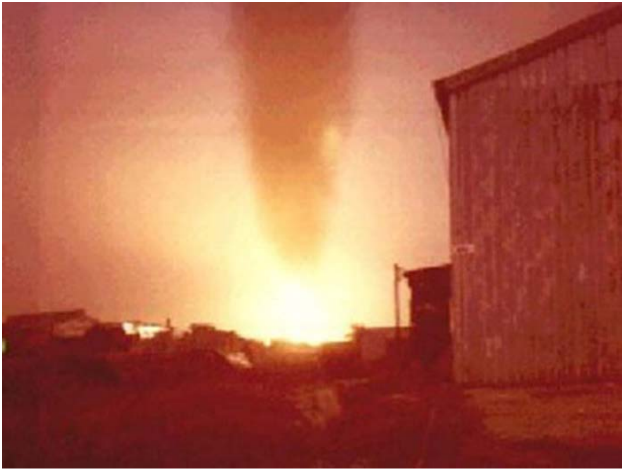
8. Đà Nẵng AB: Oil Dump ablaze with a geyser column of fire and smoke blasting upwards. Photo by Alan Ellison, 1968.