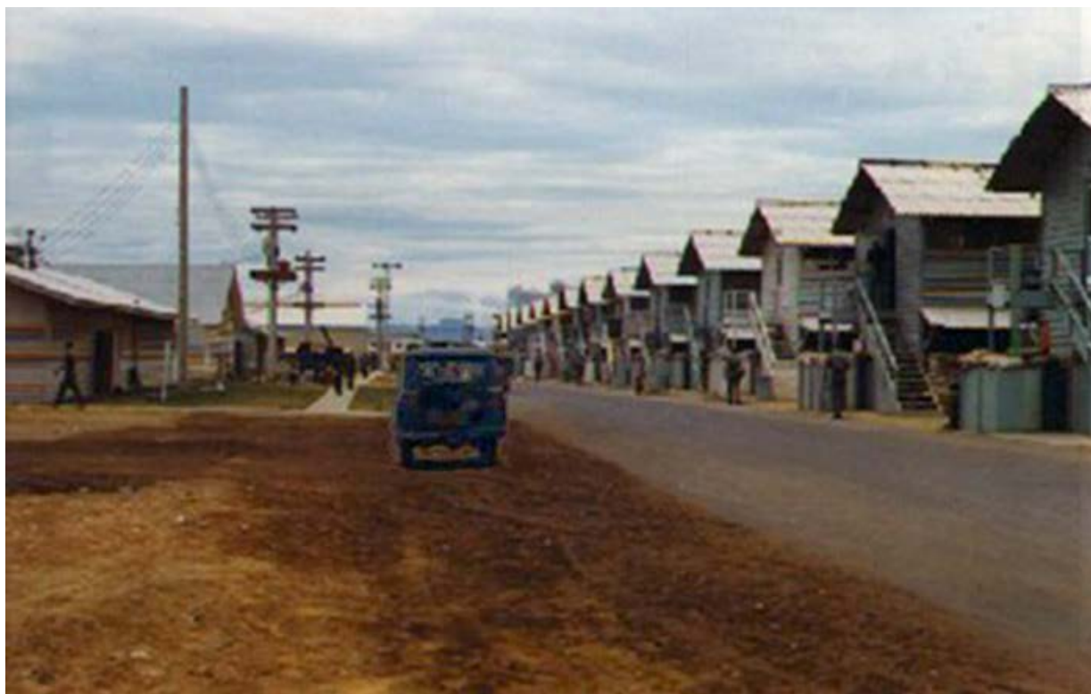
1. Đà Nẵng AB: Gunfighter Village.