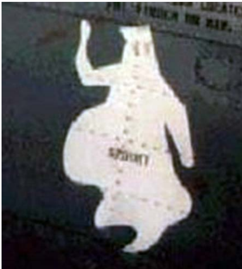
6. Đà Nẵng AB: Spooky Nose Art, C-47. Photo by Alan Ellison, 1968.