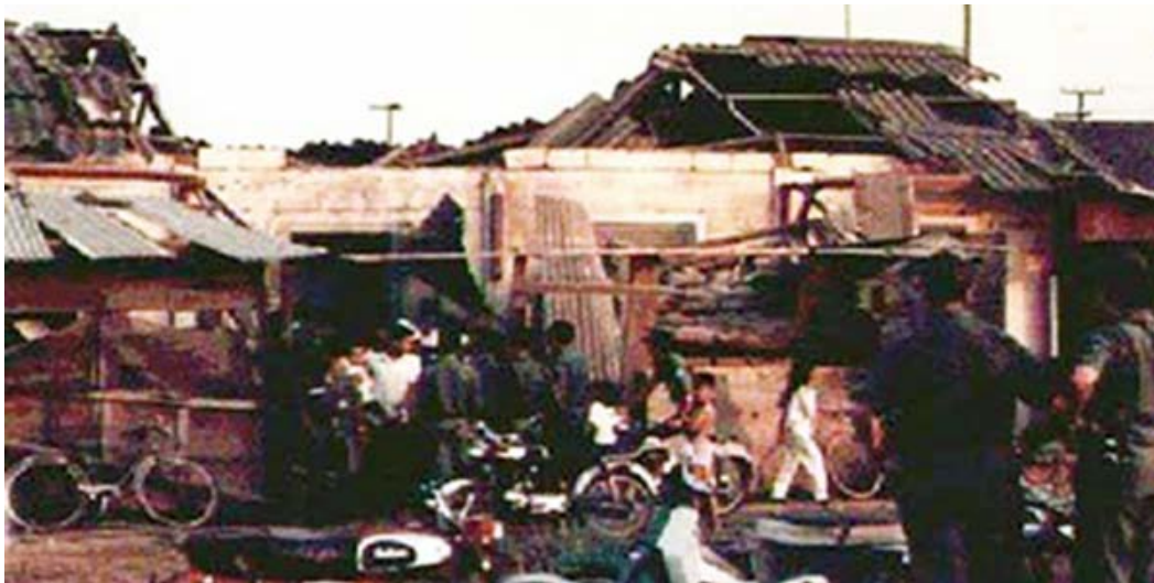
11. Đà Nẵng AB: ARVN Housing rocket damage. Photo by Alan Ellison, 1968.