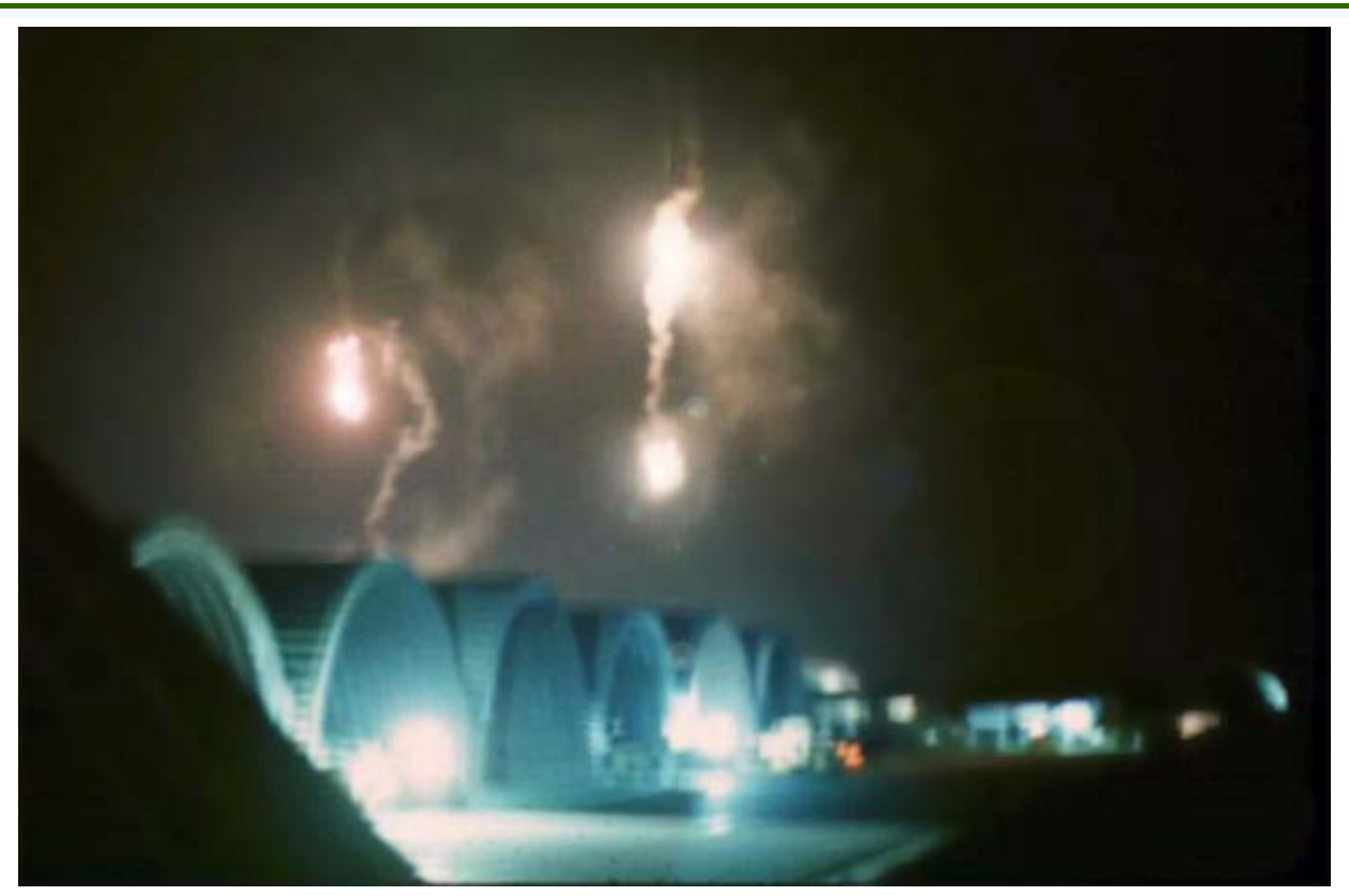
1. Đà Nàng AB: Flares drift over flight line ramp hangars. Photo by Chris Butler, 1971.