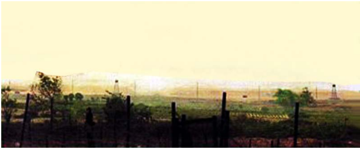
Photo-2: Notice the Guard Towers at the bottom of the mushroom cloud! Photo was taken about a mile from the bomb dump.