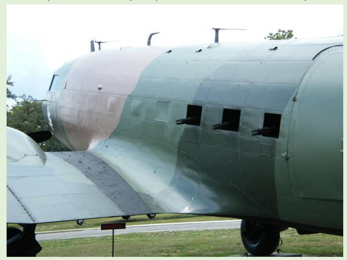
"Spooky" #43-49010, on display at the Air Force Armament Museum in Florida.

The area was hit with well over 100 rockets that night. After the rockets stopped I started sweeping my part of the perimeter. We could here gunfire in all directions. The VC attempted to overrun a Vietnamese military camp located off base. The Spooky flying overhead dropped a few flares, and circled the camp firing it's minguns. It was a very impressive light show, with what appeared to be a laser beam emitting from the aircraft and the sound of a million bees roaring. Then appearance of a solid beam of light was caused by tracer rounds (every 6th round in the ammo belt).