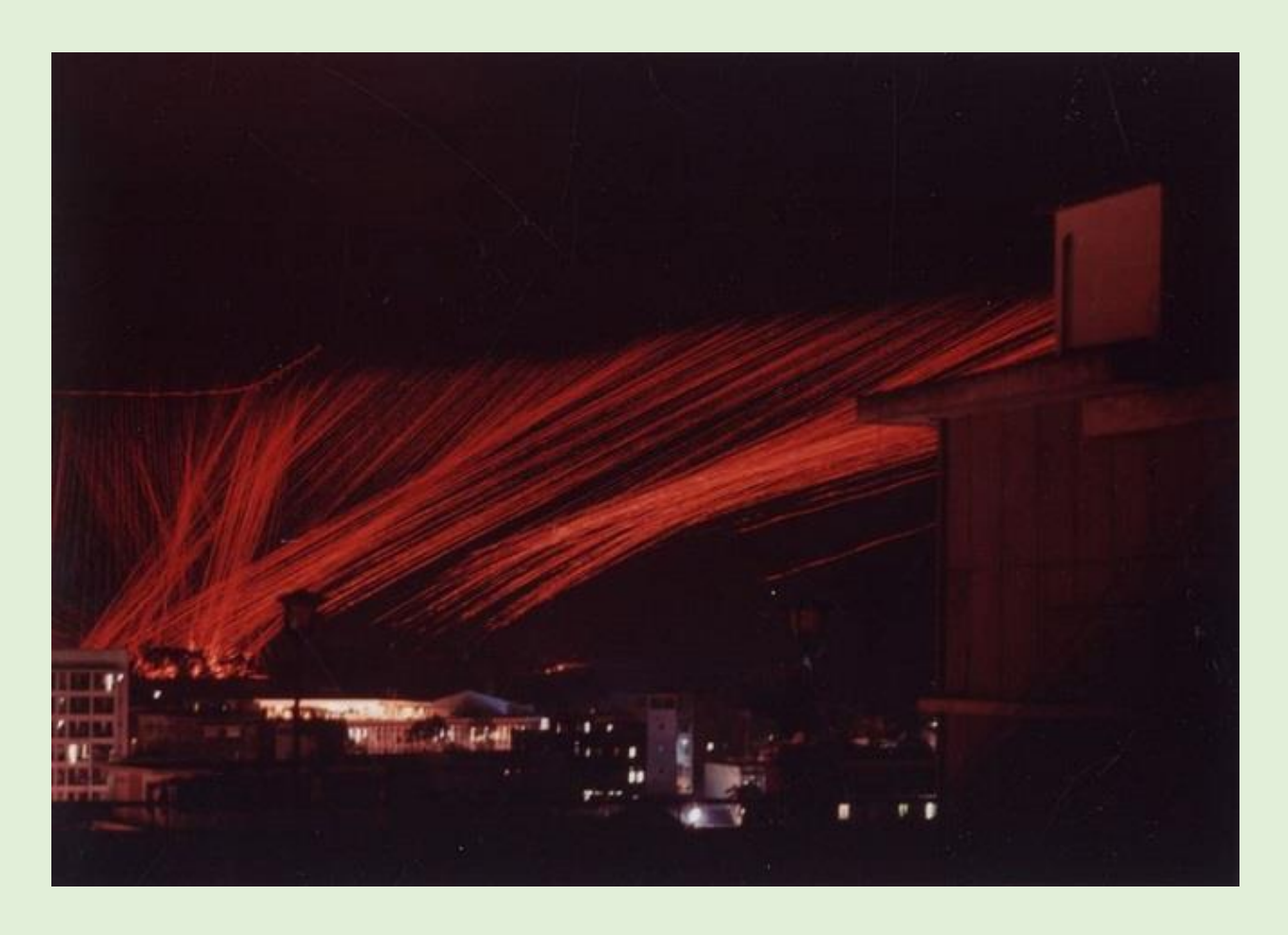
Time lapse photograph of an AC-47 helping defend Tan Son Nhut Air Base during the enemy Tet Offensive in 1968.

The Freedom Bird due to land that morning, circled the air base for several hours before landing. When it finally did land, fires were still burning from the attack. That flight also brought in about seven new handlers from a pipeline USAF sentry dog class. That evening as we started to get ready for work the new handlers were moving into the hut. Three of those handlers were Bill Grife, Gill Perry and Pete Koenig. They later described how it felt circling the base, looking down at the smoky fires. Talk about a welcome wagon!