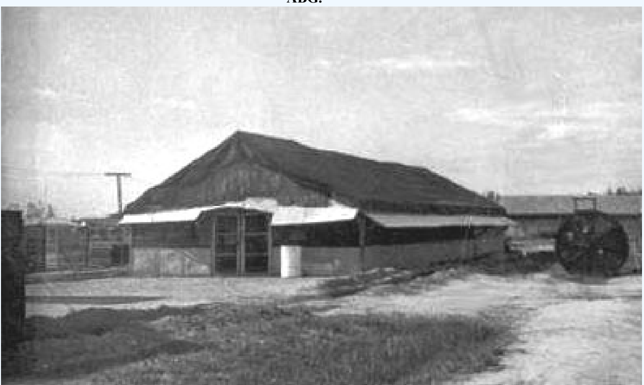
2. Đà Nàng Air Base, 6222nd ABG/AP, Mess Hall 1963.