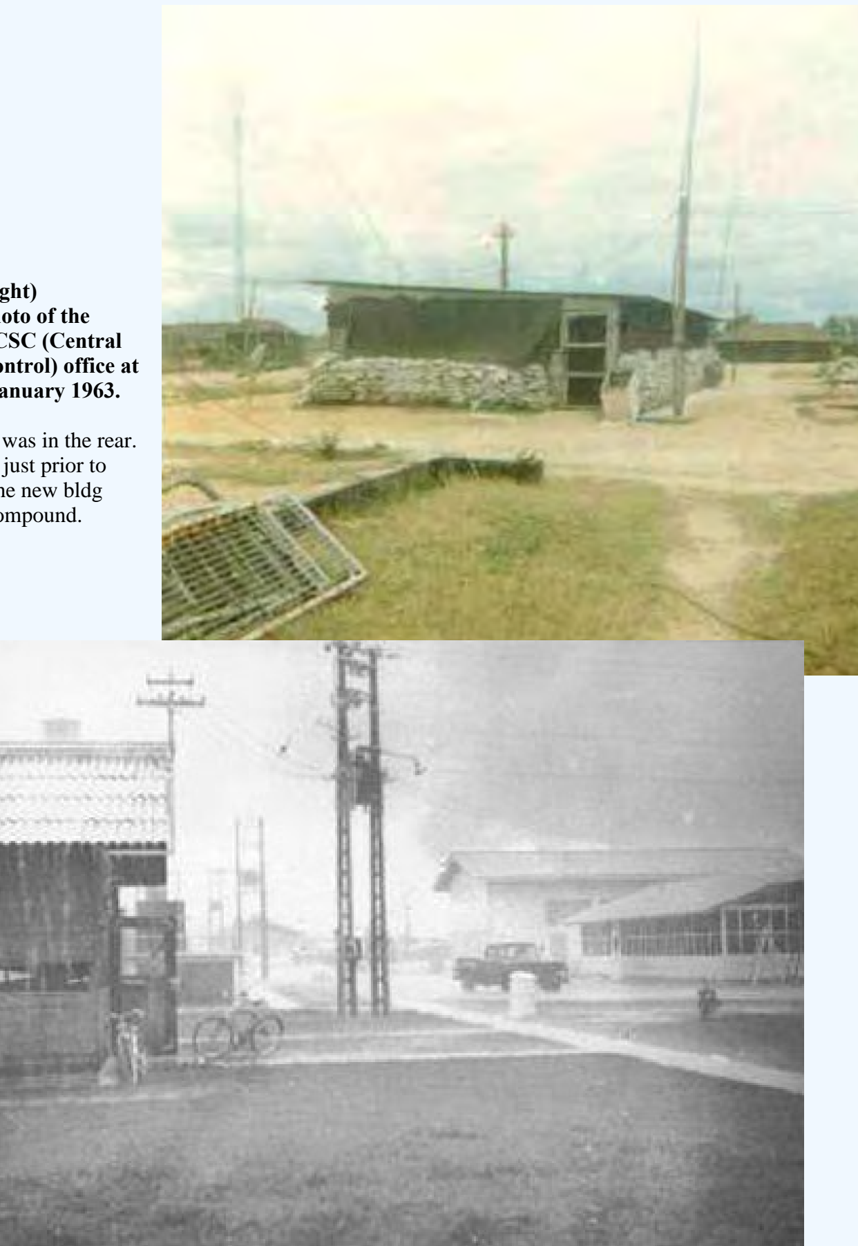
4. Remember the monsoons? These two were taken just after we moved into the new compound. Đà Nàng Air Base, 6222nd ABG/AP. 1963.

The armory was in the rear. Photo taken just prior to moving to the new bldg inside the compound.