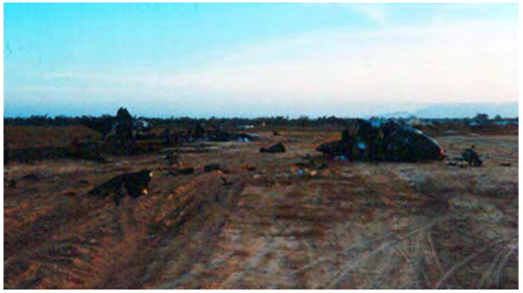
B-57 blown apart and scattered in a thirty-yards debris field.