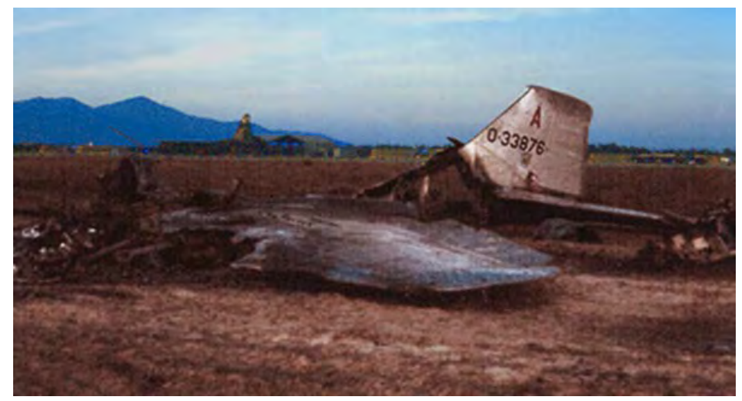
Da Nang AB flightline in background, across the runway.