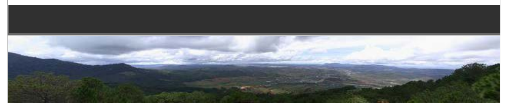
1) Đà Lạt, Lang Bian Mountain. The most beautiful and scenic in Vietnam.

Vietnam war undamaged and give the town a unique appearance. In the area around the town are several beautiful waterfalls.