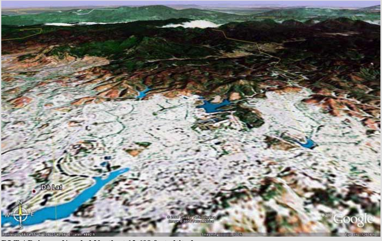
DLT AB, imaged/angled North at 12,609 feet altitude. • Satellite of

DLT AB, imaged/Fly Over at 5 Miles altitude. • Satellite of