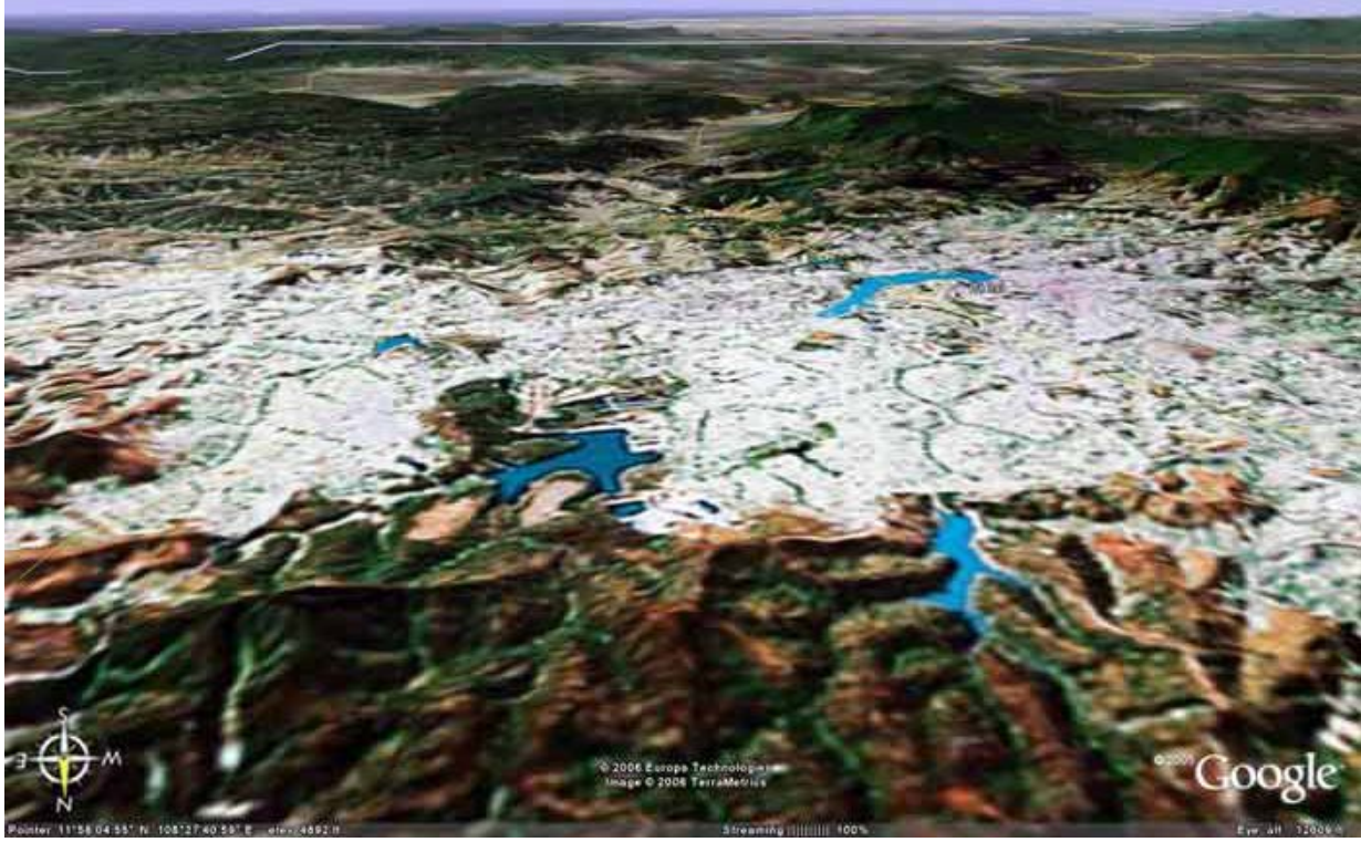
DLT AB, imaged/angled South at 12,609 feet altitude. • Satellite of