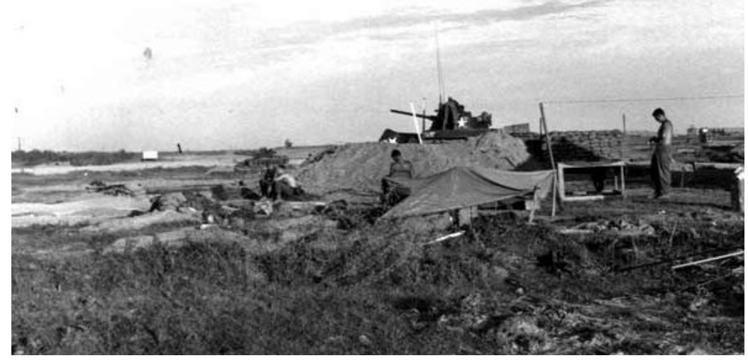
3) A US Army twin 40 MM gun located near the southeast end of the runway near the POL farm.

Đông Hà Air Field: USAF Security Police, by Photos by: Dennis Vaudell, MCB 5 (5th. Mobile Const. Btln. (SeaBees), Attached USMC. 1966.