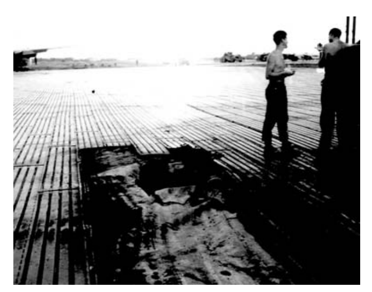
Late 1966, a mortar hit on the aircraft parking area on the north side of runway. The Seabees of my detachment performed the repairs to Dông Hà Air Field's aluminum / magnesium runway matting and the PSP parking area.

I Spent 65' and part of 66' at Đà Nàng Air Base. 66'-68' in around Đông Hà Air Field.