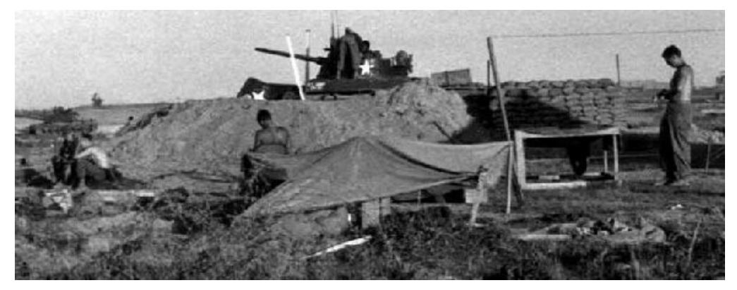
4) (Close up)