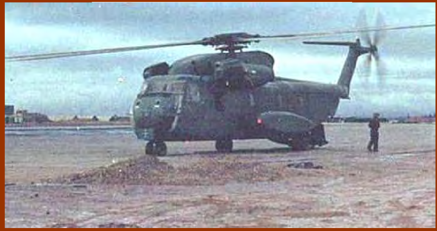
Đông Hà Air Field 1968, Steel runway, with trenches near where aircraft taxi to unload cargo due to being in range of NVA artillery.

We were the 366th SPS from Đà Nàng, it was strictly volunteer, a small force of no more then 20 men, to guard the radar site called waterboy at that time.