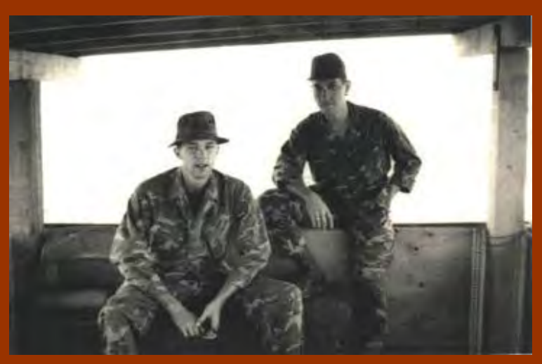
Đông Hà Air Field New bunker's build by a Redhorse unit, I think.