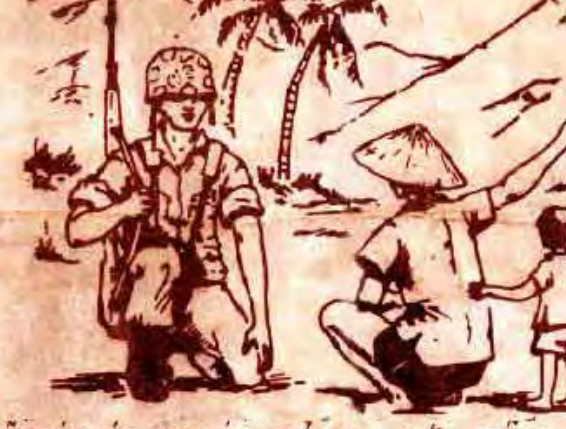
HÃY BÁO CÁO CHO CHÍNH-PHỦ VNCH HOẶC NHỮNG ĐỒNG-MINH NOI CÓ BỌN VIỆT-CÔNG VÀ QUÂN CHÍNH VIỆT ẤN TRÚ.