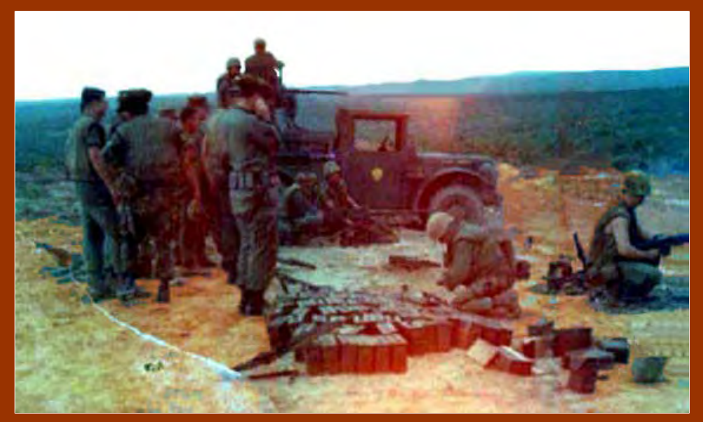
Đông Hà Air Field 1967 Firing Range.