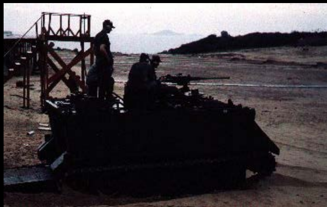
QW Firing. Cam Ranh Bay AB in the background.