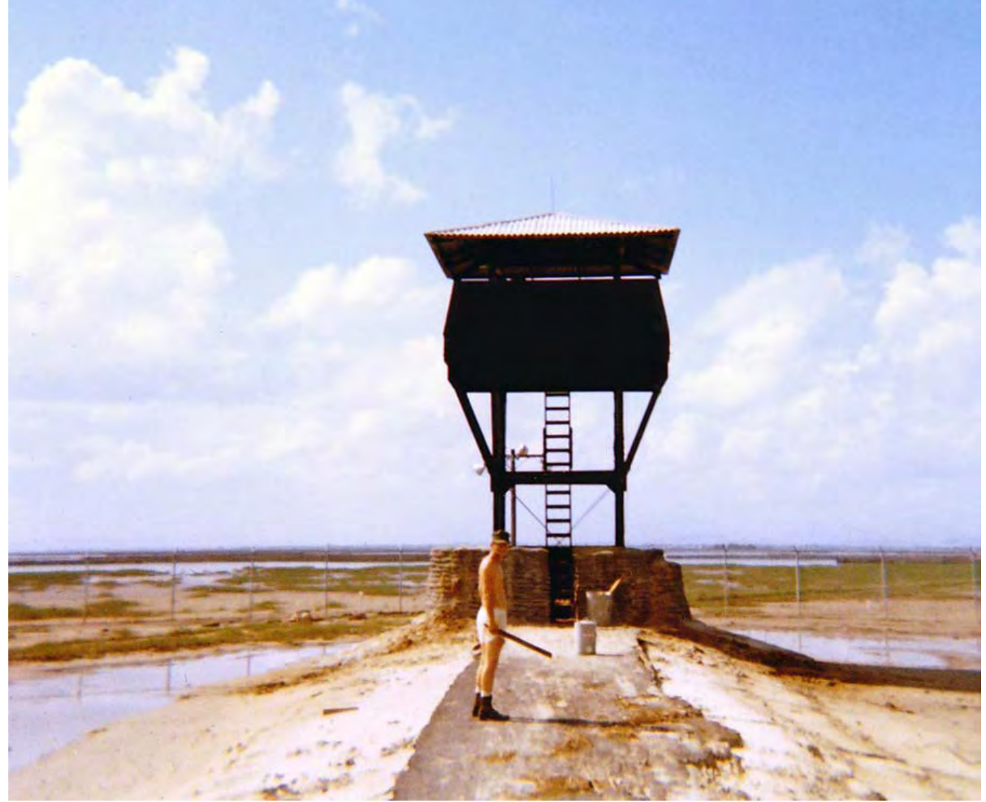
Camp Carroll: Nice Sentry Tower, huh. I'll give him a few more minutes to finish up those sandbags and goofying off, and then go back over. Heh-heh .