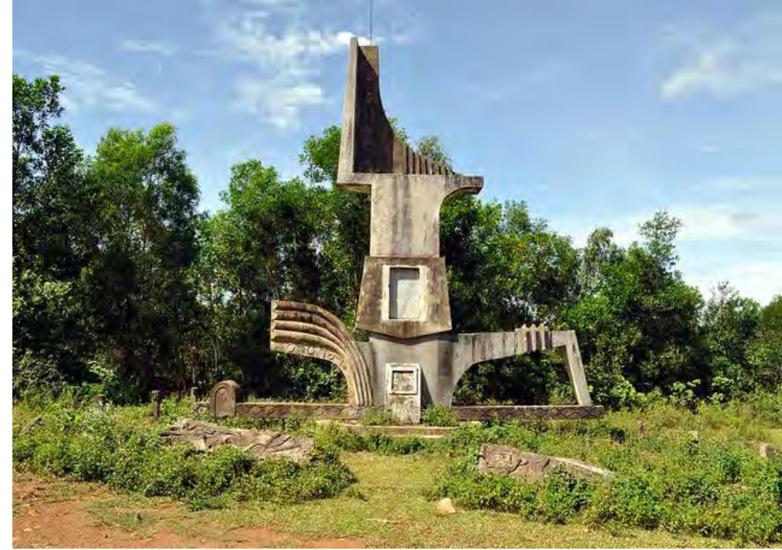
Vietnam Monument at previous Camp Carroll location.