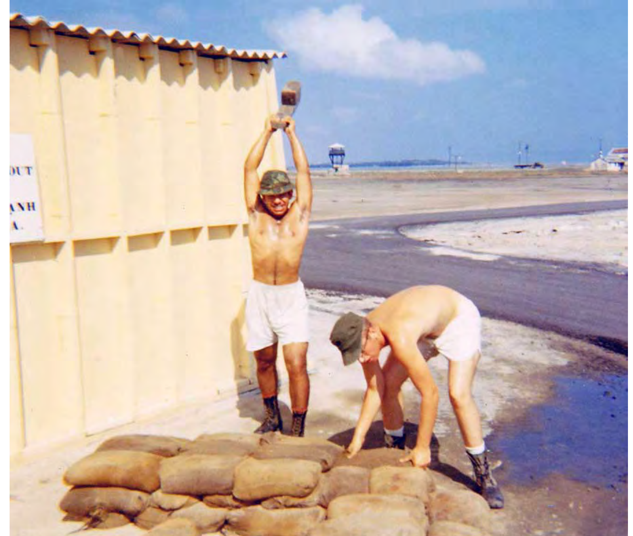
Sandbags: Make'em look real purtty.... Hey... I know... we'll walk over to that Sentry Tower (background) and take a picture of you filling sandbags! Yeah... right... I'll hold this pose lifting a sandbag, like I'm working -- and you're not.