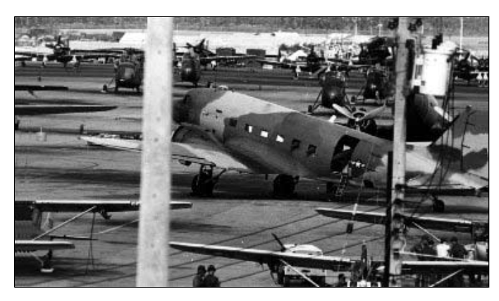
3) Binh Thuy AB flight line taken from the tower behind CSC. Not a single jet on the base.