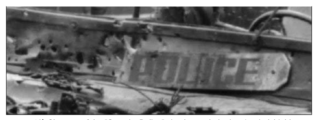
13) Close up of the "Security Police" sign beneath the jeep's windshield.