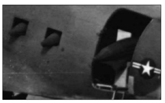
5) C-47's Gattling Guns.