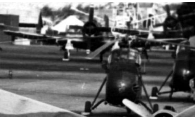
7) Chopper waiting for troop