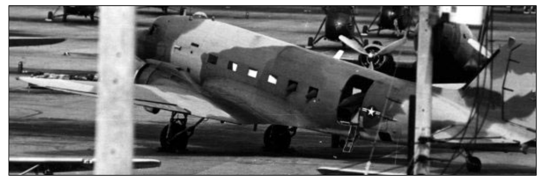
4) C-47, parked waiting for a mission.