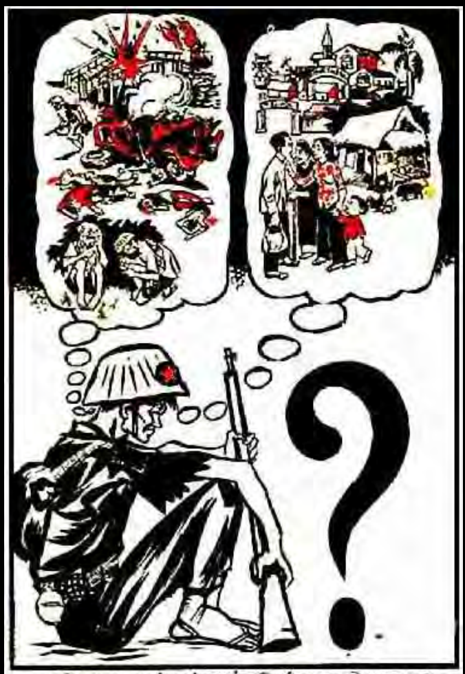
GIỮ CHƯA PHẢI LUC TRỞ VỀ YỚI GIA ĐÌNH SAO ? ANH CHON CẢNH NAO TRÊN NÀY ?

1) A pamphlet that we kicked out of the door of a C47. Then it was pointed out that the Geneva Convention did not want us to do that so we stopped. This was in 1967.