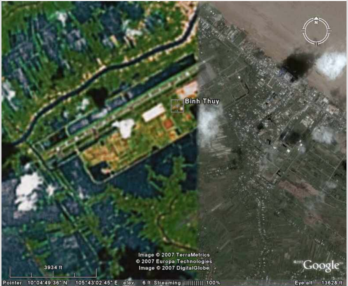
BT AB, imaged Fly Over, North at 13,628 feet altitude.