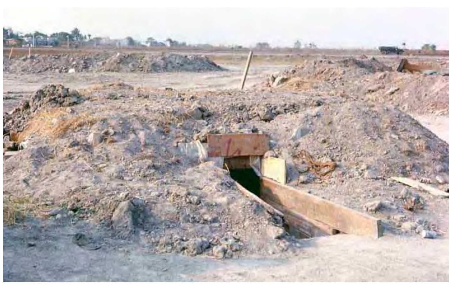
Tân Sơn Nhứt AB, 377th SPS, Bunker outside. MSgt Summerfield: 03