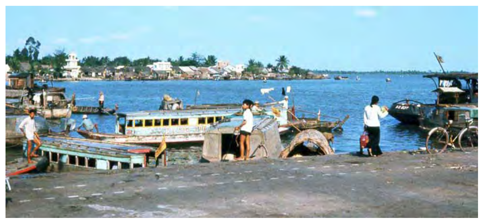
Can Tho waterfront. MSgt Summerfield: 12

© Vietnam Security Police Association, Inc. (USAF) 1995-2018. All Rights Reserved.