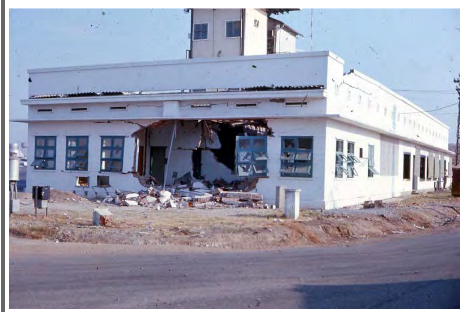
Tân Son Nhứt AB, 377th SPS, Control Tower takes direct-hit from 122mm rocket. MSgt Summerfield: 05