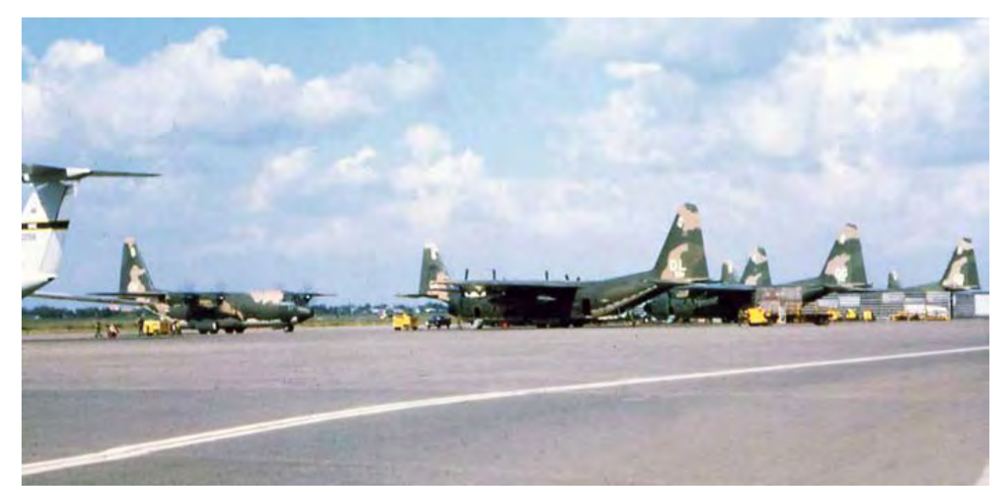
Tân Sơn Nhứt AB, 377th SPS, flight line C130s parking area. MSgt Summerfield: 06