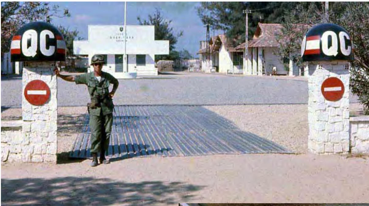
ARVN QC Camp Gordon: 01