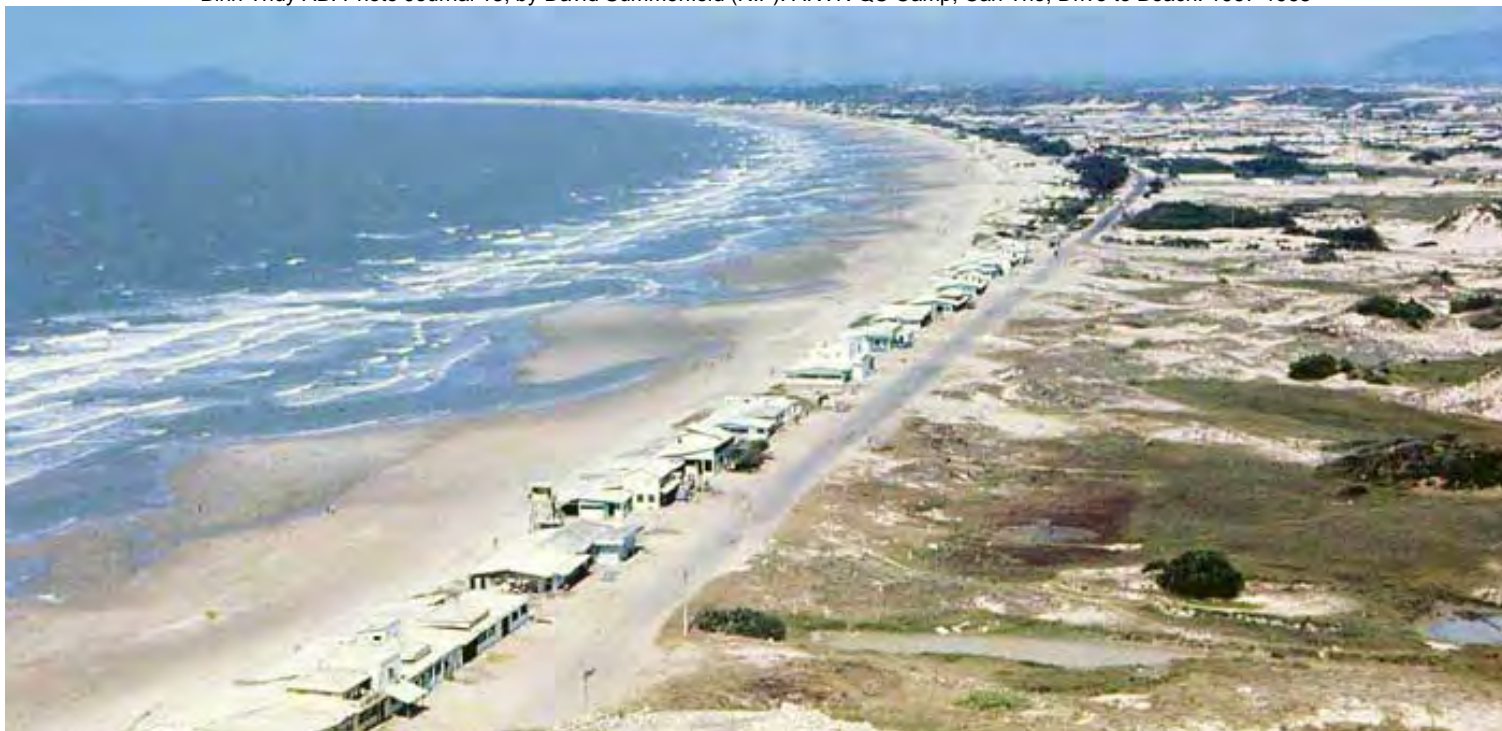
Binh Thuy, beautiful day at the beach. MSgt Summerfield 1969: 13 and 14