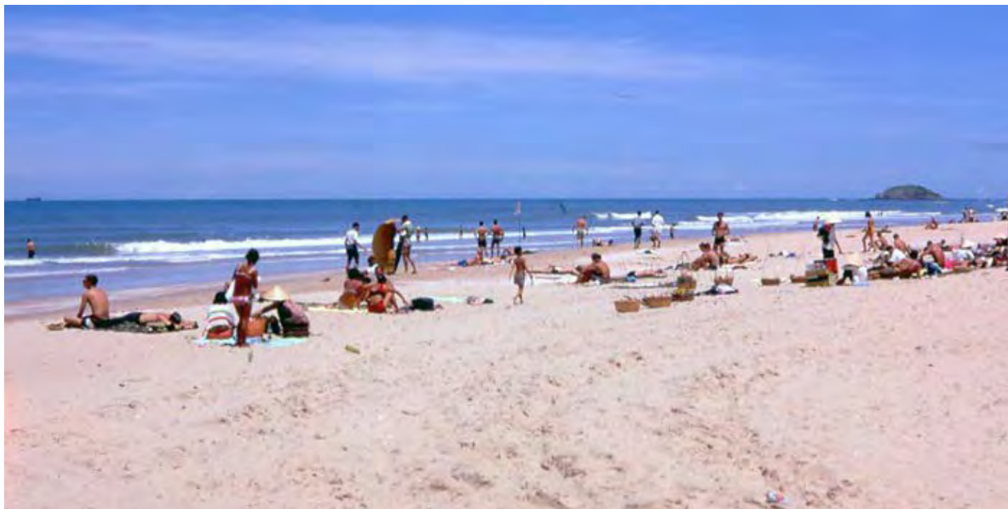
Vung Tau VT , R&R at the Beach. MSgt Summerfield: 17 and 18.