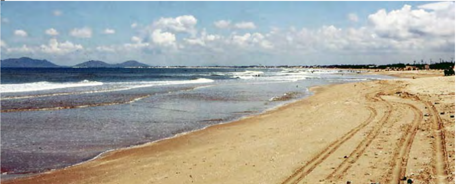
Binh Thuy, beautiful day at the beach. MSgt Summerfield 1969: 12