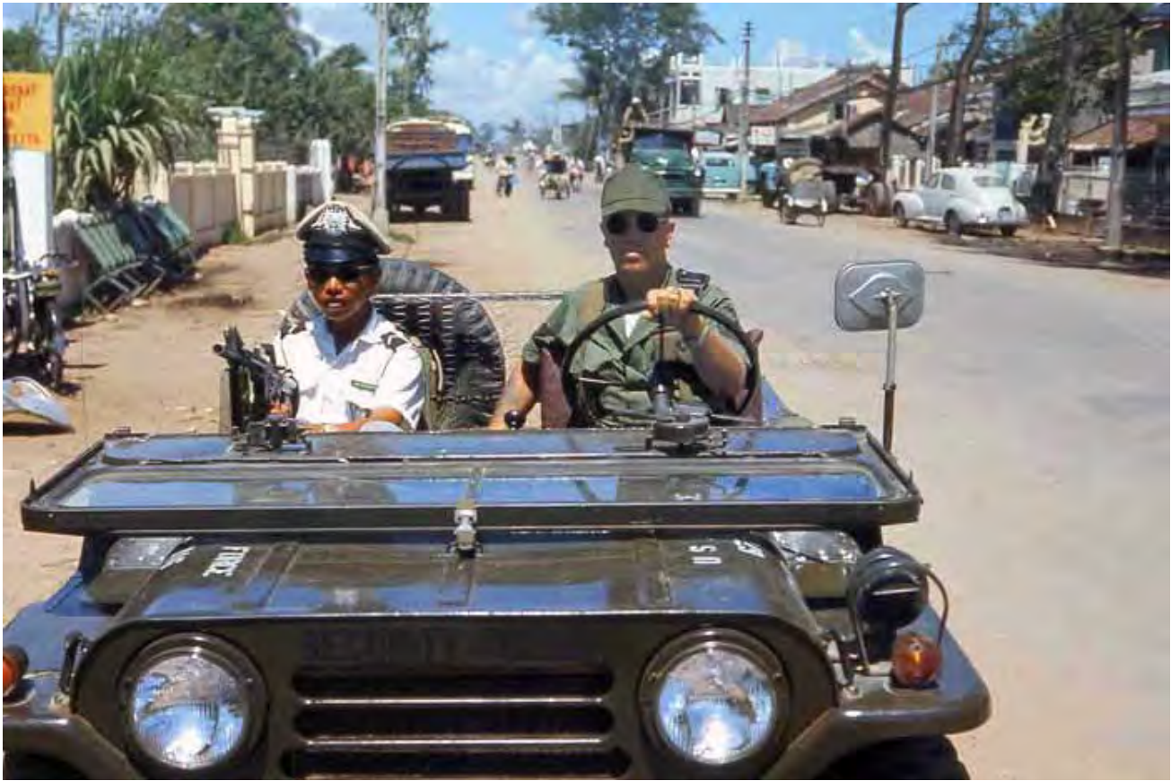
A drive to the beach with friends