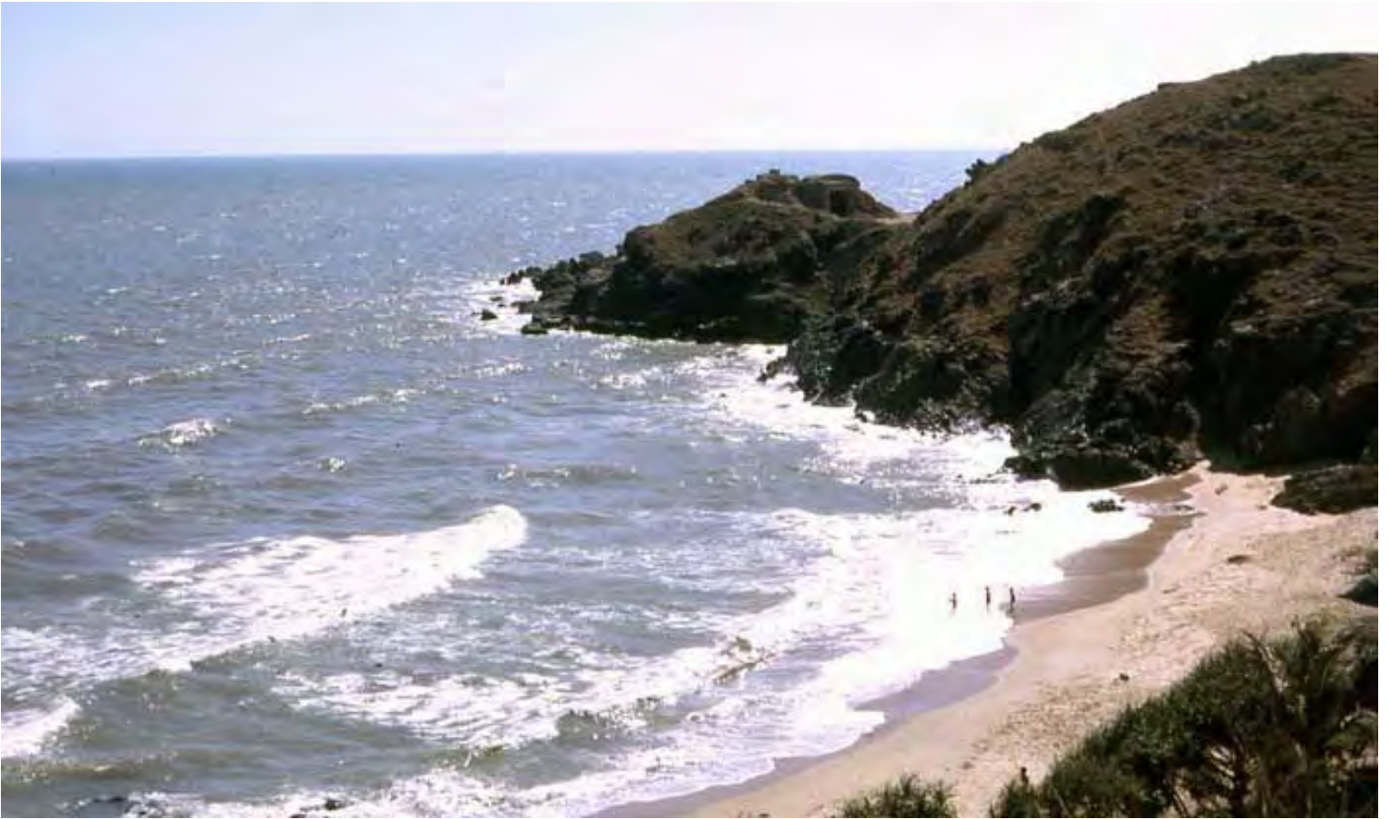
South of Binh Thuy, beautiful day at the beach. MSgt Summerfield 1969: 11