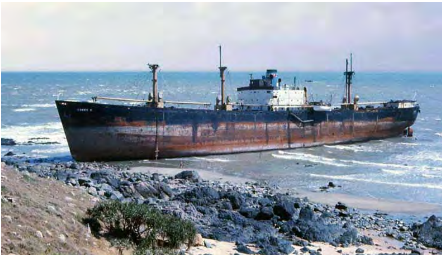
Binh Thuy, beautiful day at the beach. Grounded Freighter. MSgt Summerfield 1969: 15 and 16