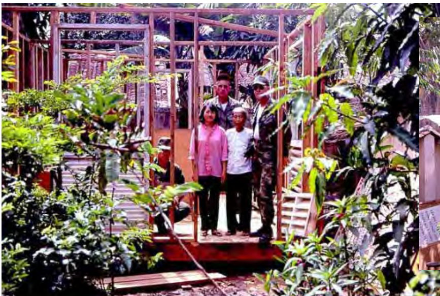
6. Binh Thuy, Orphanage Home.