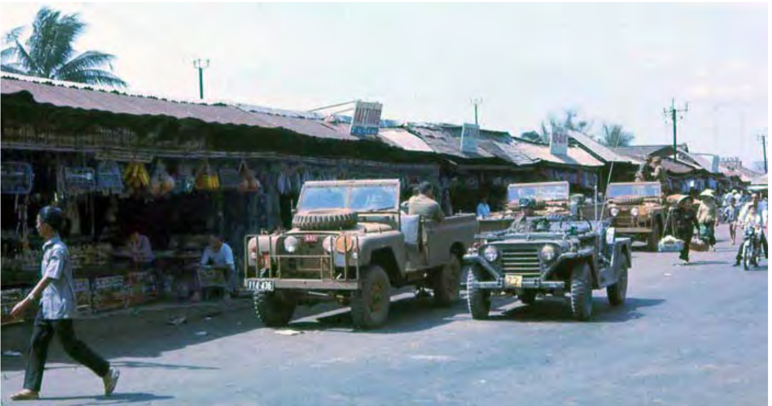
Phuoc Le market. USAF jeep with MSgt Summerfield, 1969: 05