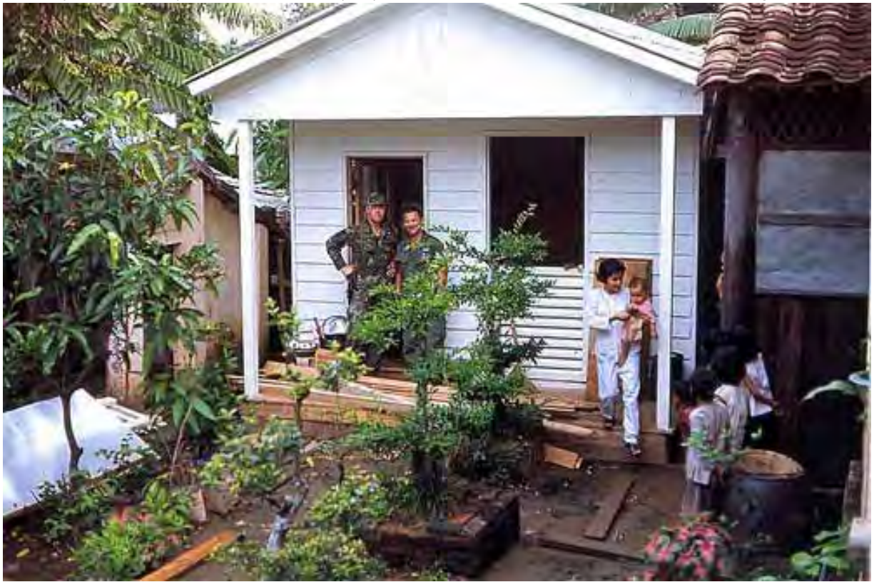
Binh Thuy, Orphanage Home.: 12