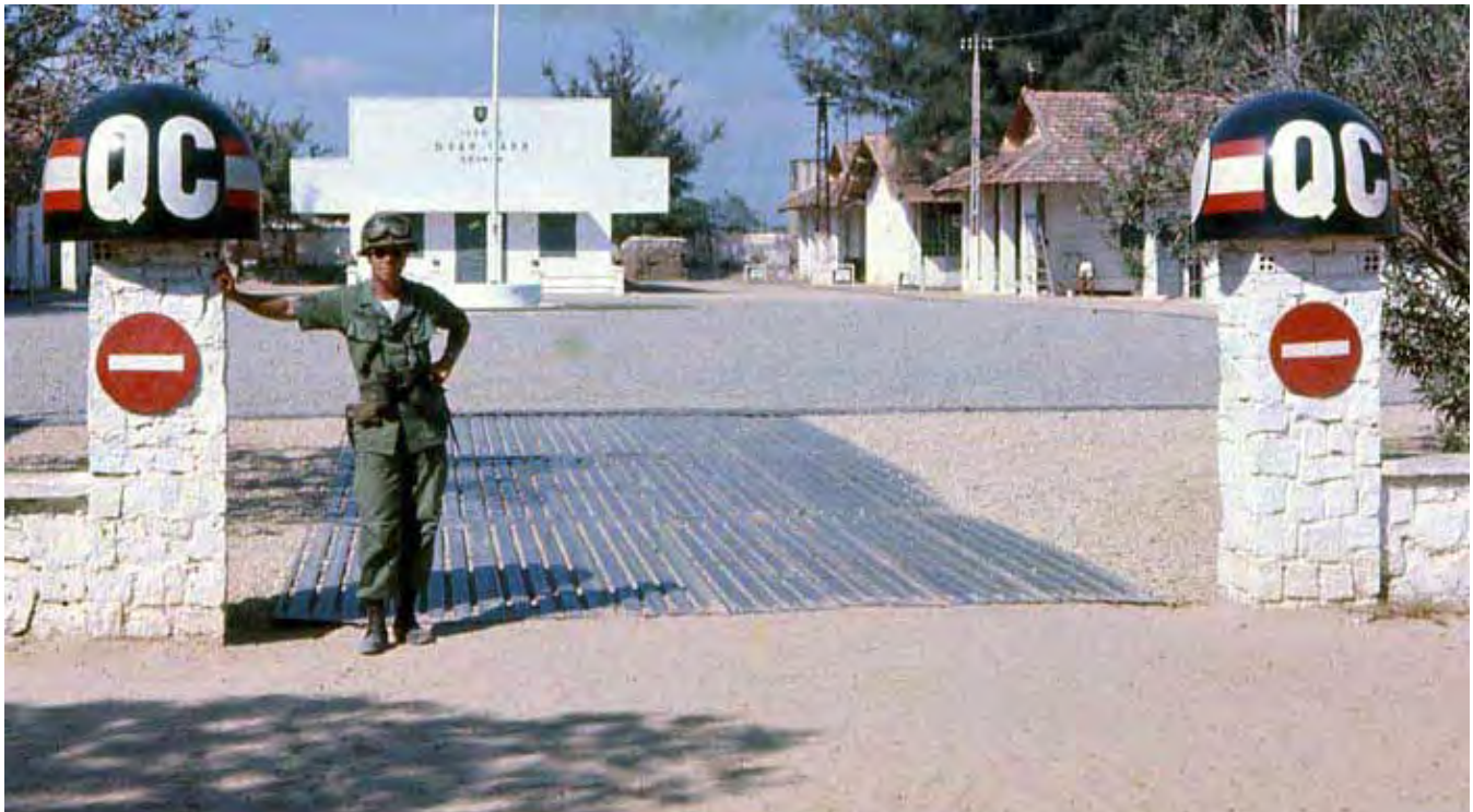
ARVN QC Camp Gordon: 01

III - Bình Thủy AB: Phuoc Le Village and Market. 1967-1968.