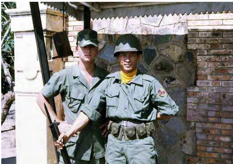
Above: Vũng Tàu, ARVN BOQ: 02