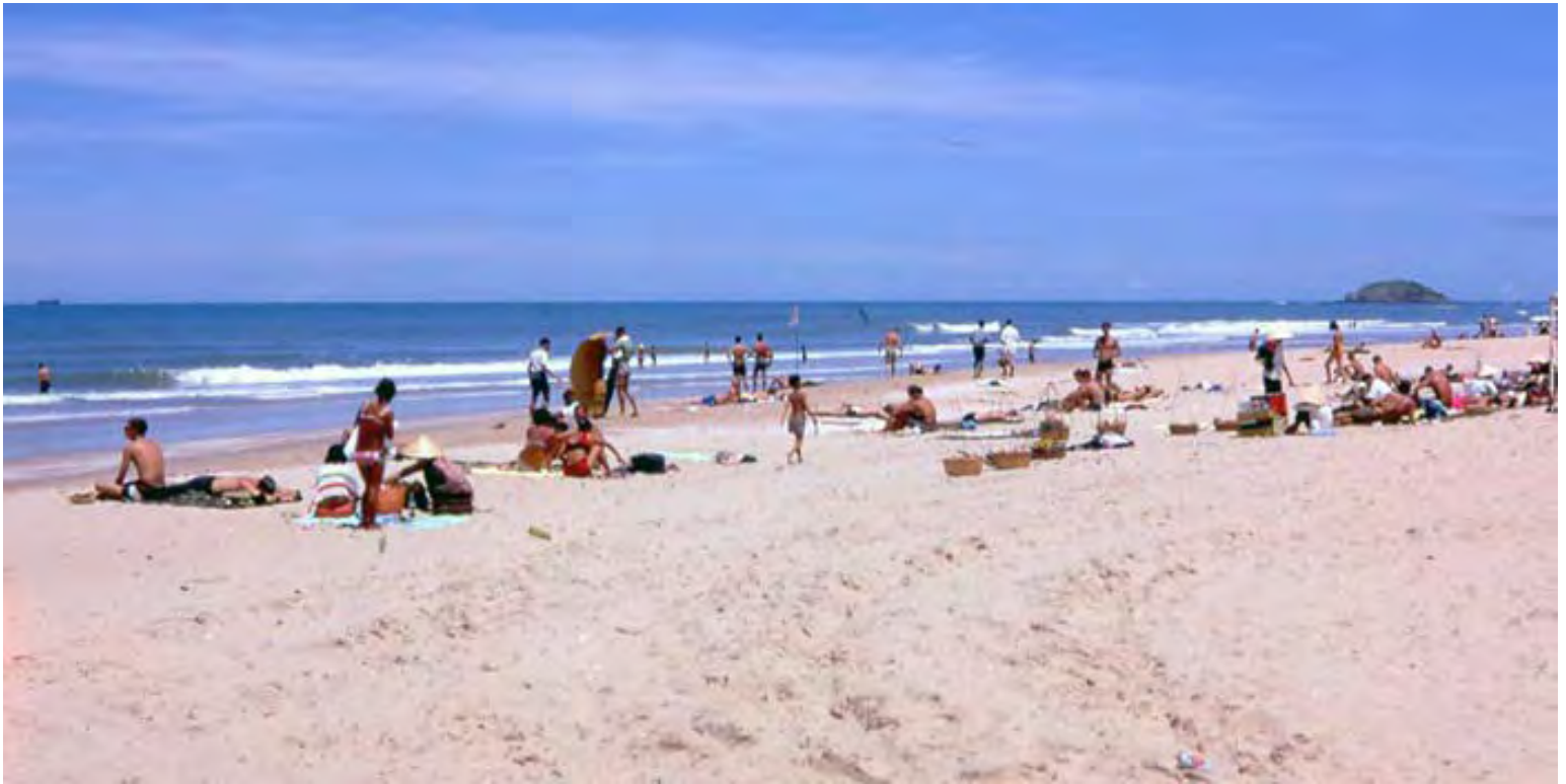
00. VT R&R Beach. MSgt Summerfield.