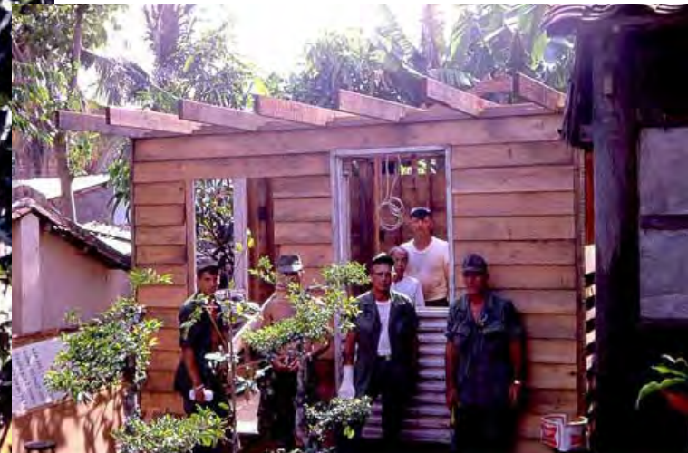
7. Binh Thuy. Orphanage Home.