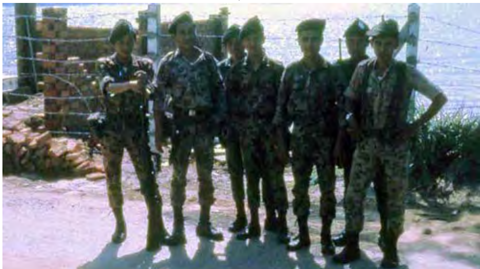
ARVN soldiers, Summerfield: 06