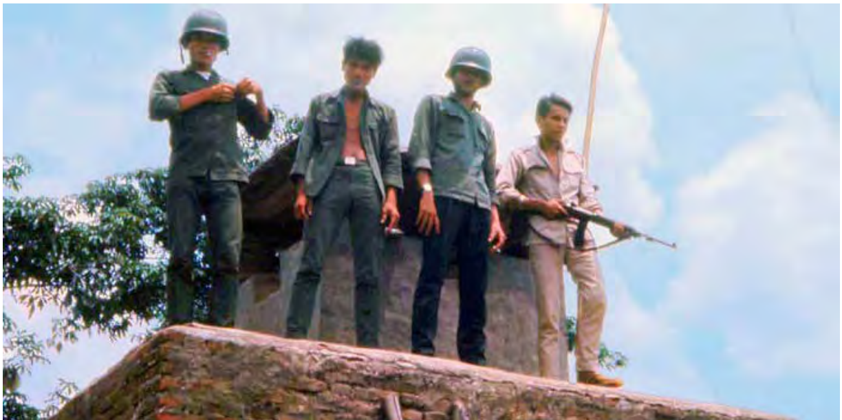
ARVN soldiers, Summerfield: 05