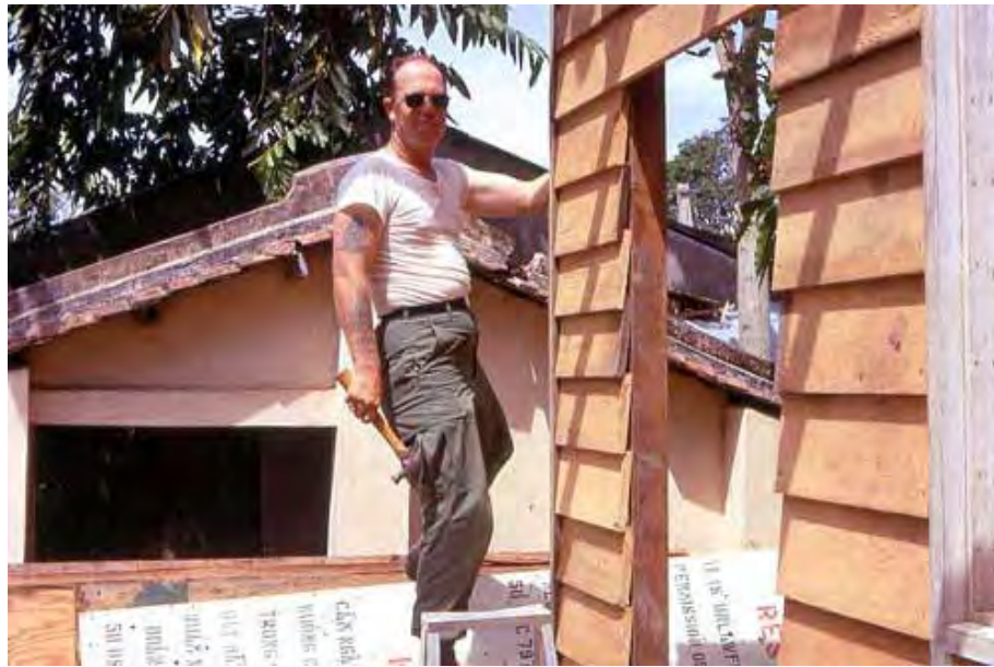
5. Binh Thuy, Orphanage Home.