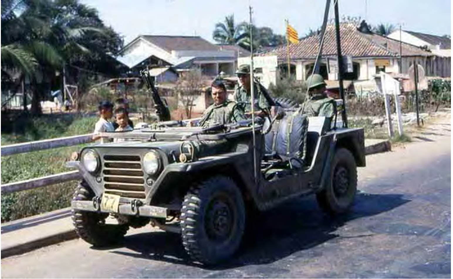
00. Phuoc Le bridge. Kids checking out USAF QRT with M60. MSgt Summerfield, 1969.