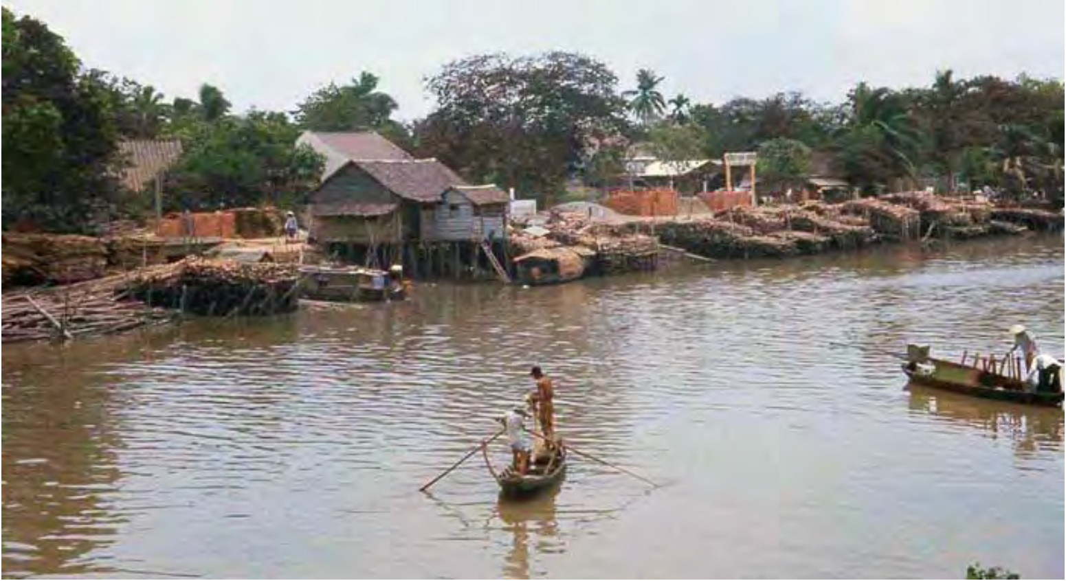
00. Phuoc Le fishermen casting et. MSgt Summerfield.