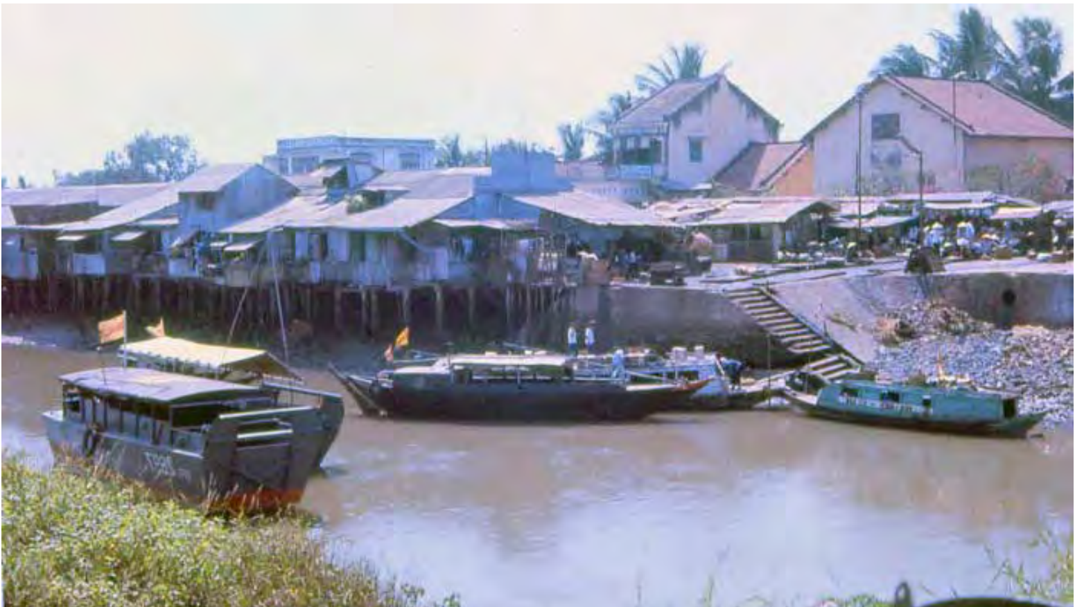
00. Phuoc Le river market. MSgt Summerfield, 1969.