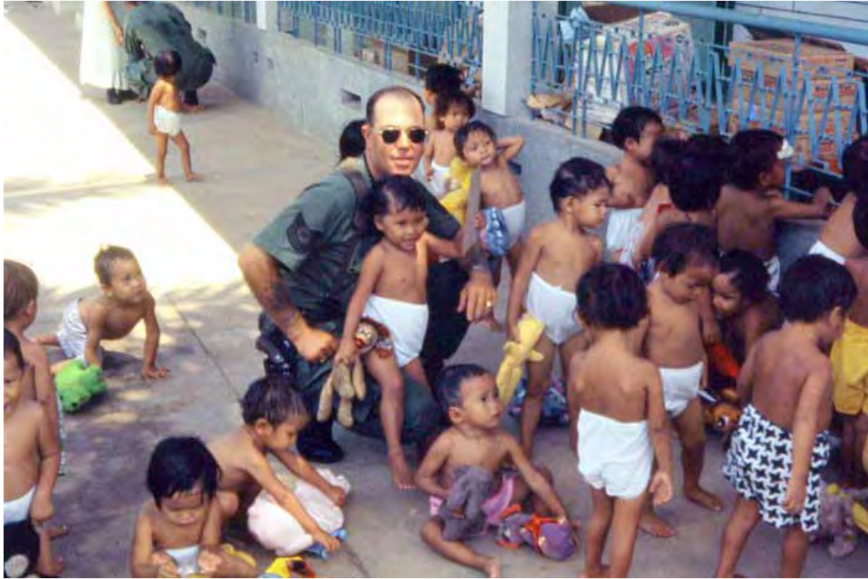
0. Can Tho Orphanage Home.: 15