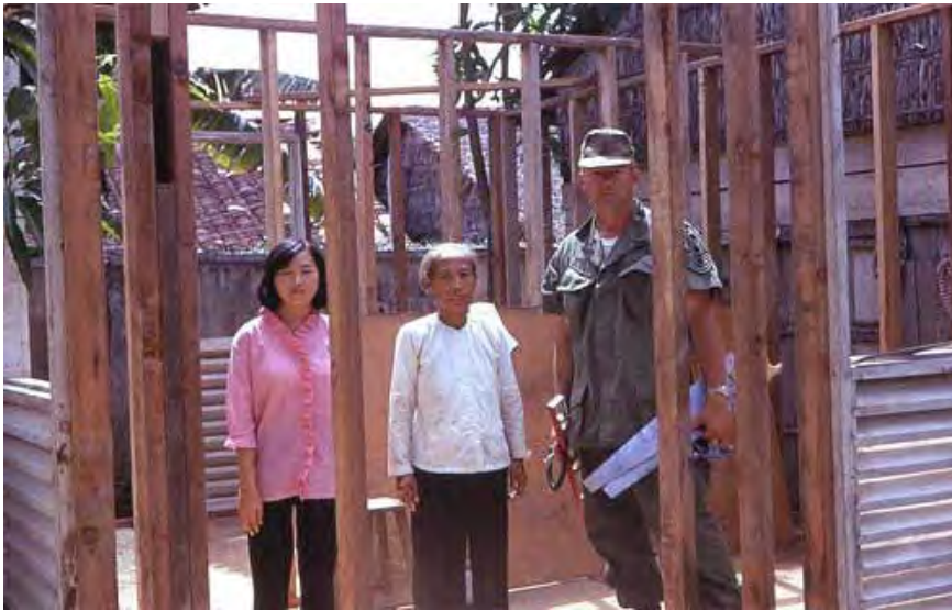
3. Binh Thuy, Orphanage Home.