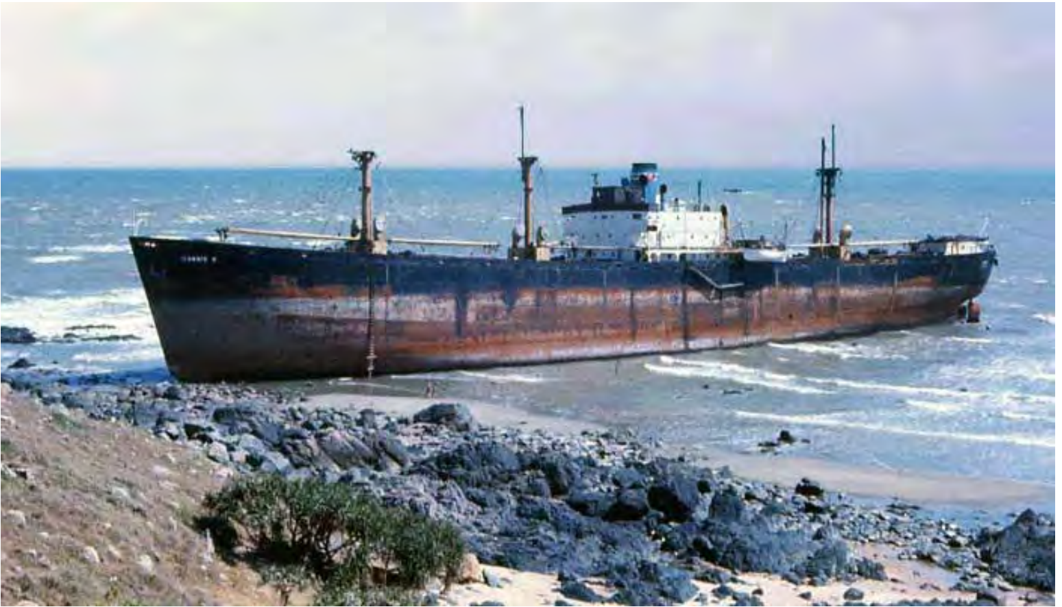
00. & 00. Binh Thuy, beautiful day at the beach. Grounded Freighter. MSgt Summerfield 1969.