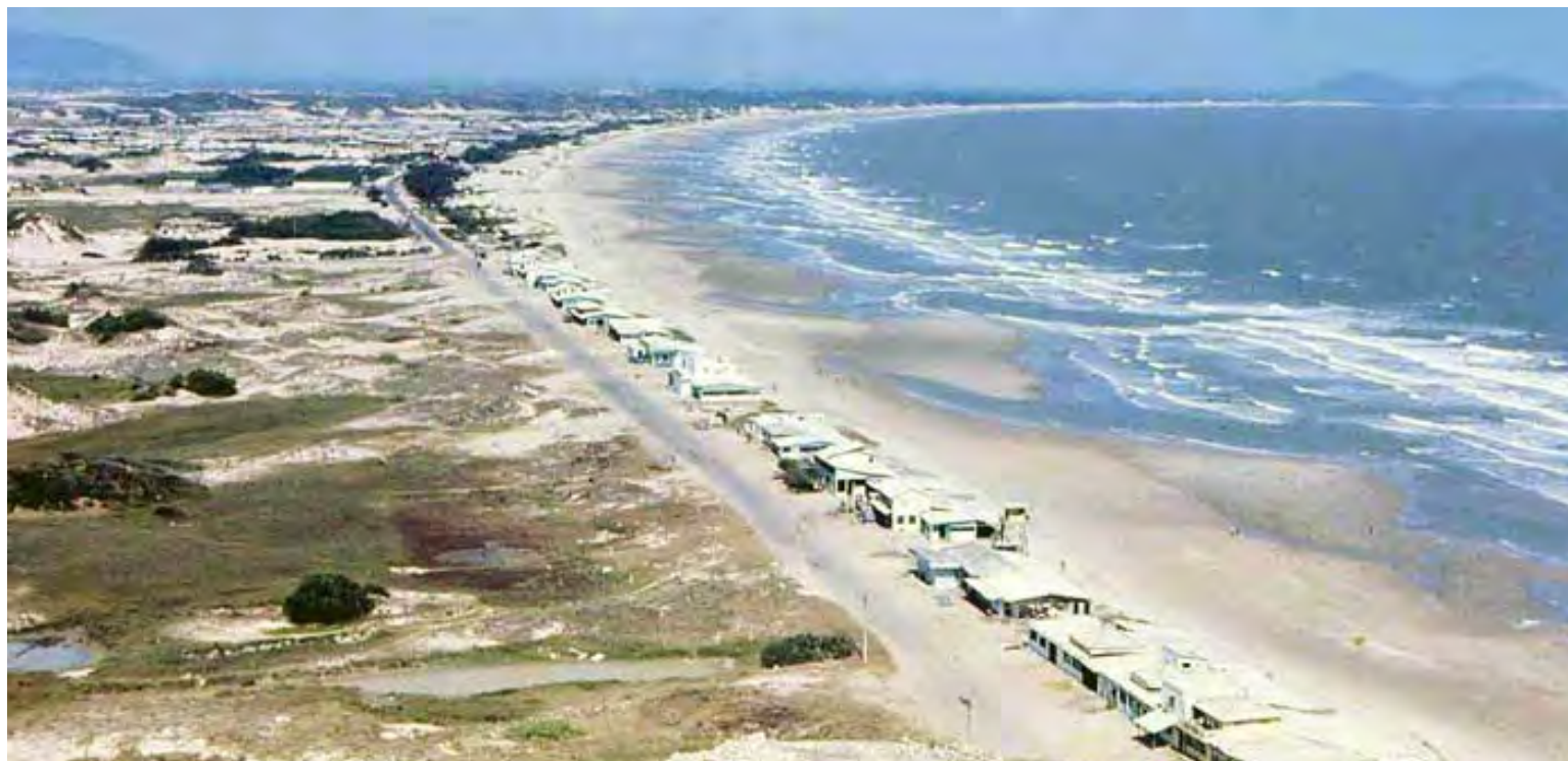
00. & 00. Binh Thuy, beautiful day at the beach. MSgtSummerfield 1969.