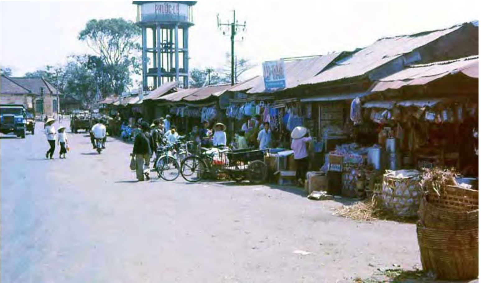
Phuoc Le market. MSgt Summerfield, 1969: 04