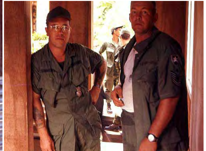
4. Binh Thuy, Orphanage Home.