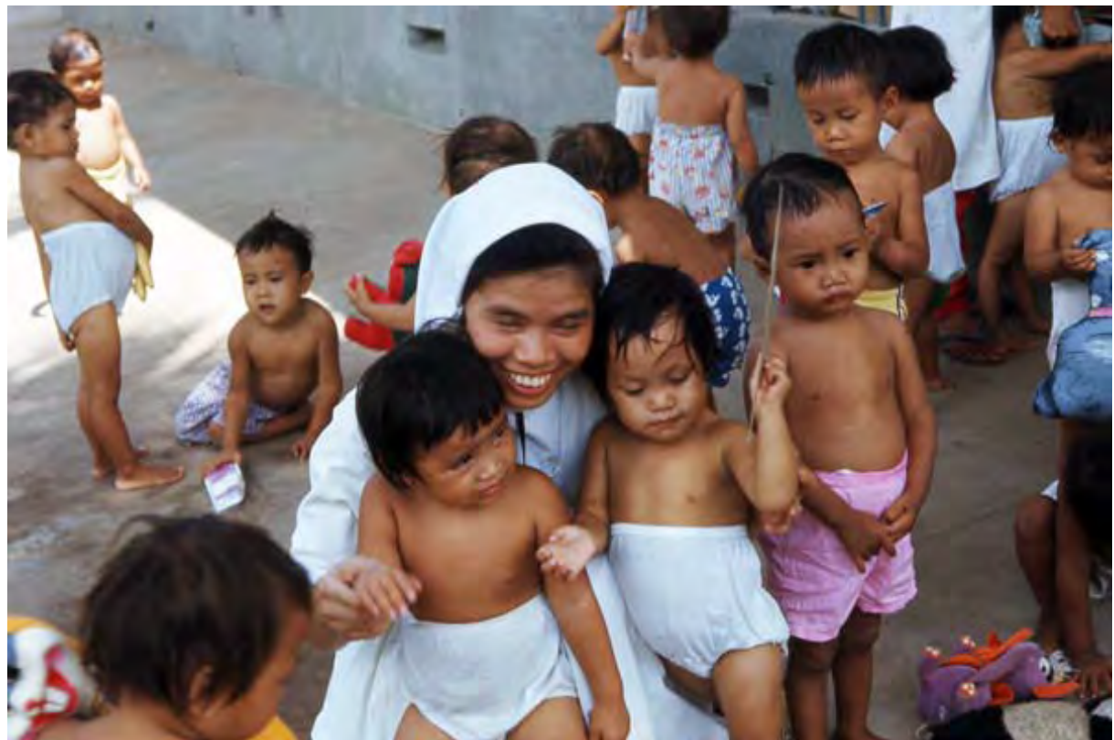
0. Can Tho Orphanage Home.: 15