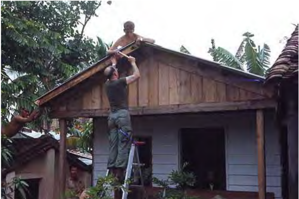
8. & 9. Binh Thuy, Orphanage Home.