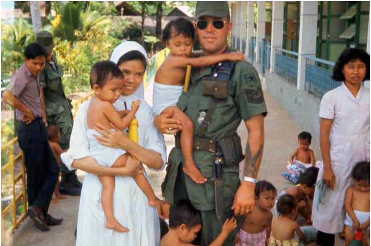
0. Can Tho Orphanage Home.: 14