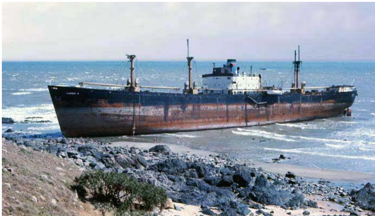
Binh Thuy, beautiful day at the beach. Grounded Freighter. MSgt Summerfield 1969: 15