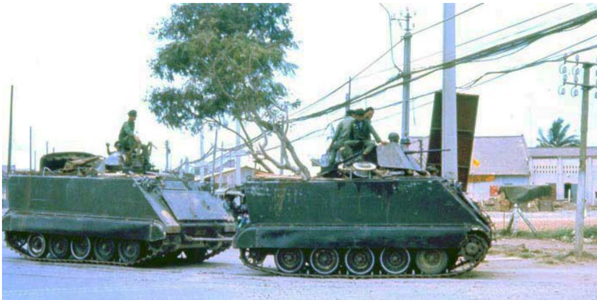
ARVN Can Tho, M113 APCs, Summerfield: 04