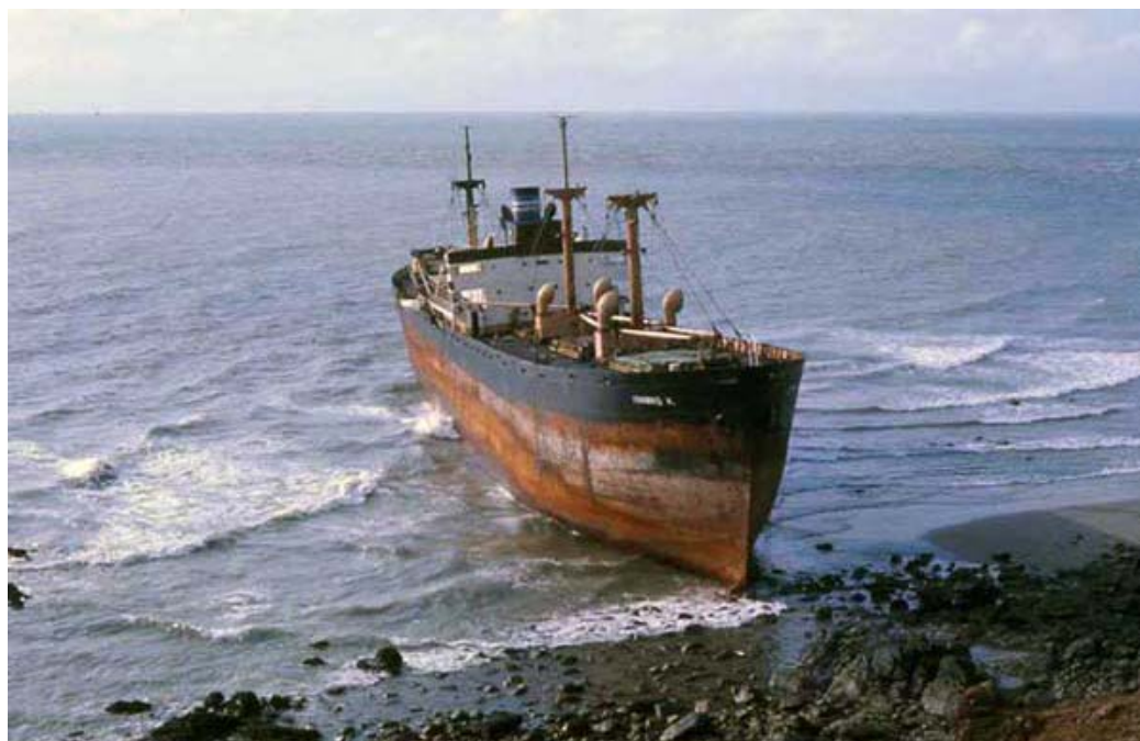
Binh Thuy, beautiful day at the beach. Grounded Freighter. MSgt Summerfield 1969: 16