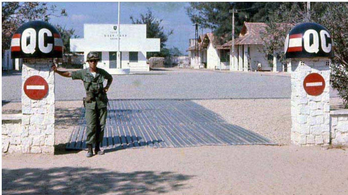
ARVN QC Camp Gordon: 01