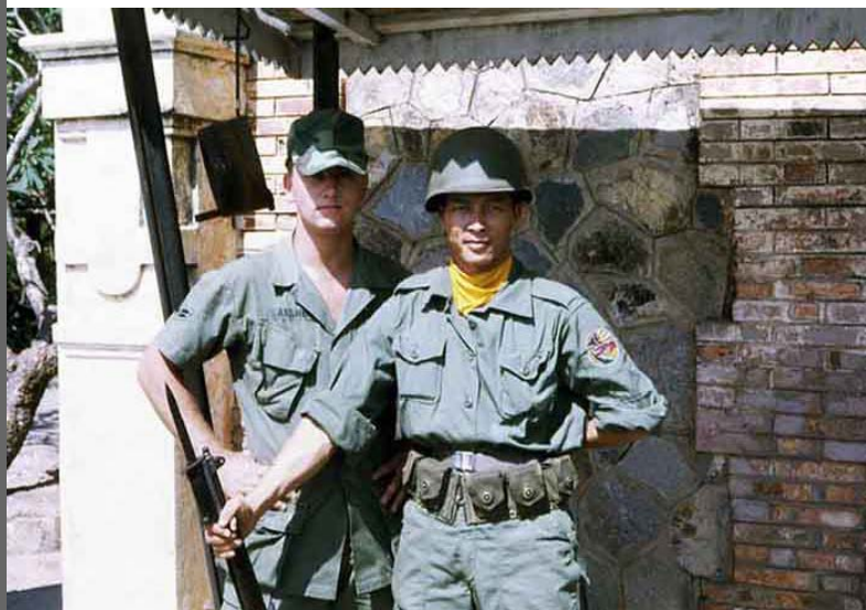
Above: Vũng Tàu, ARVN BOQ: 02