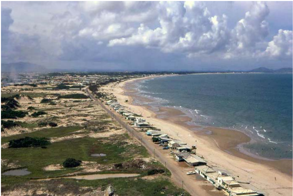
Binh Thuy, beautiful day at the beach. MSgt Summerfield 1969: 14