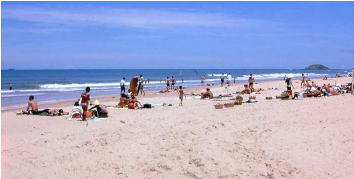
VT R&R B. MSgt Summerfield: 17