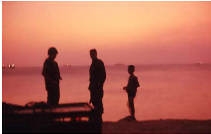
Binh Thuy, sunset at South China Sea. Freighter ships on horizon. MSgt Summerfield: 20