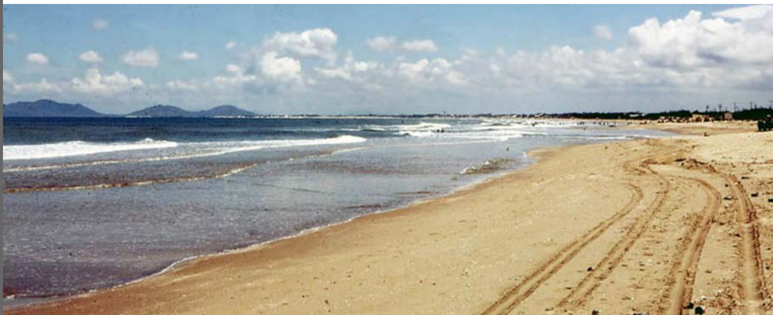
Binh Thuy, beautiful day at the beach. MSgt Summerfield 1969: 12