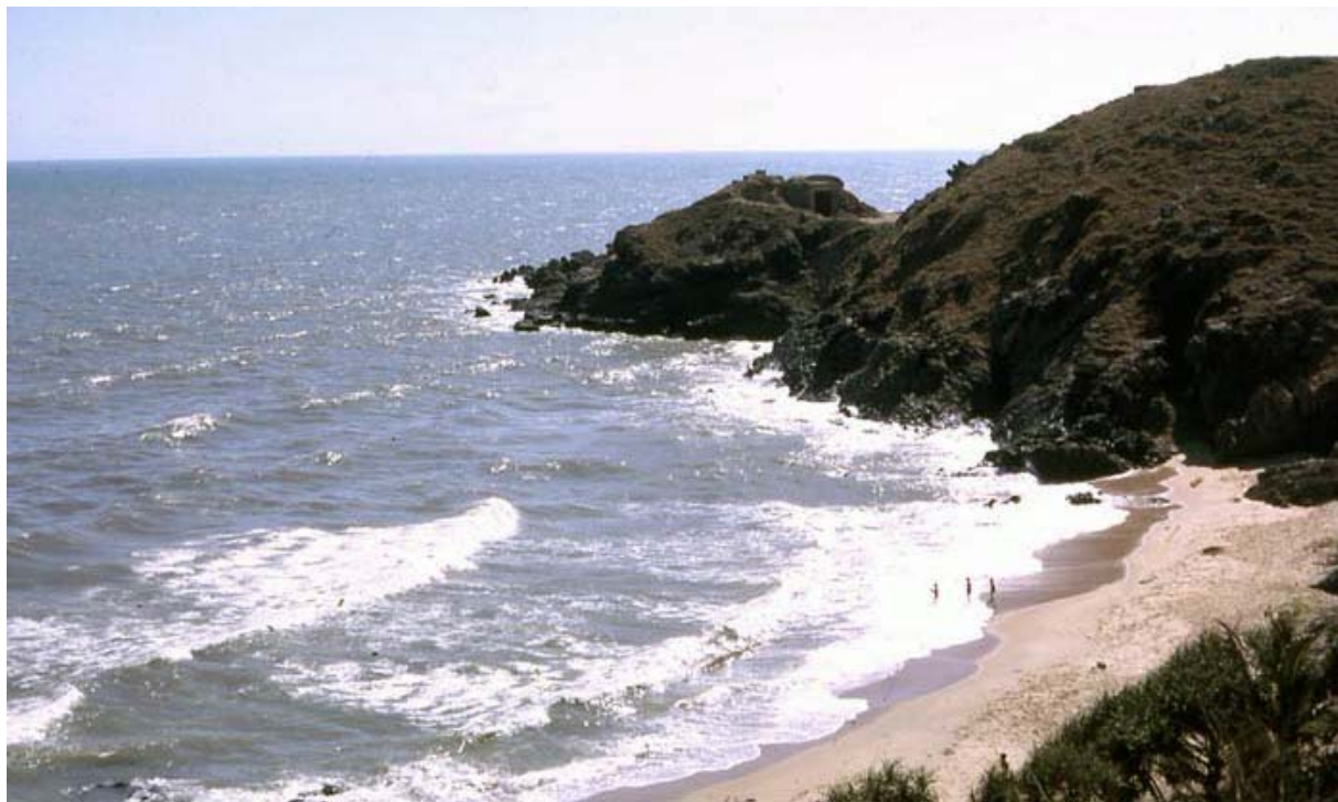
South of Binh Thuy, beautiful day at the beach. MSgt Summerfield 1969: 11