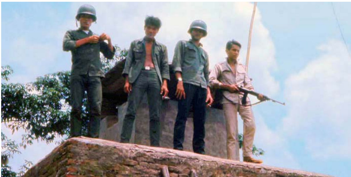
ARVN soldiers, Summerfield: 05