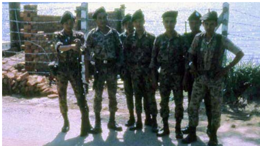
ARVN soldiers, Summerfield: 06