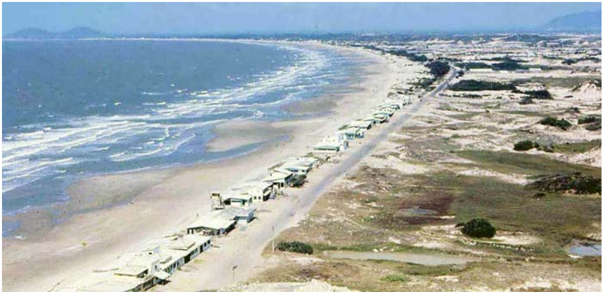
Binh Thuy, beautiful day at the beach. MSgt Summerfield 1969: 13