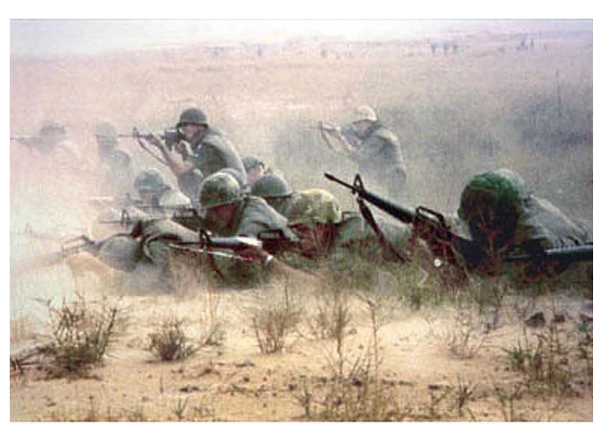
Members of the 377th SPS open up on Communist forces who infiltrated Tan Son Nhut AB during the Tet 1968 Offensive.

Tân Son Nhút Air Base: The NVA/VC attacked with four infantry battalions and a sapper battalion, their losses being <u>962 killed</u> and <u>9 prisoners taken</u>. The US losses were 19 US Army killed, 75 wounded, USAF losses 4 killed, 11 wounded, ARVN losses were 32 killed and 79 wounded. damage inflicted was 13 aircraft damaged.