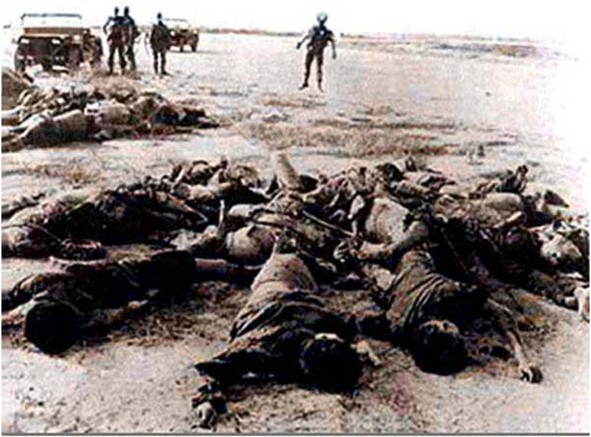
377th Security Police view the bodies of Communist forces killed in the attack on Tan Son Nhut Air Base during Tet Offensive.

VSPA member Frank Ybarbo returned to Saigon in December 1998 and photographed O51 Bunker: