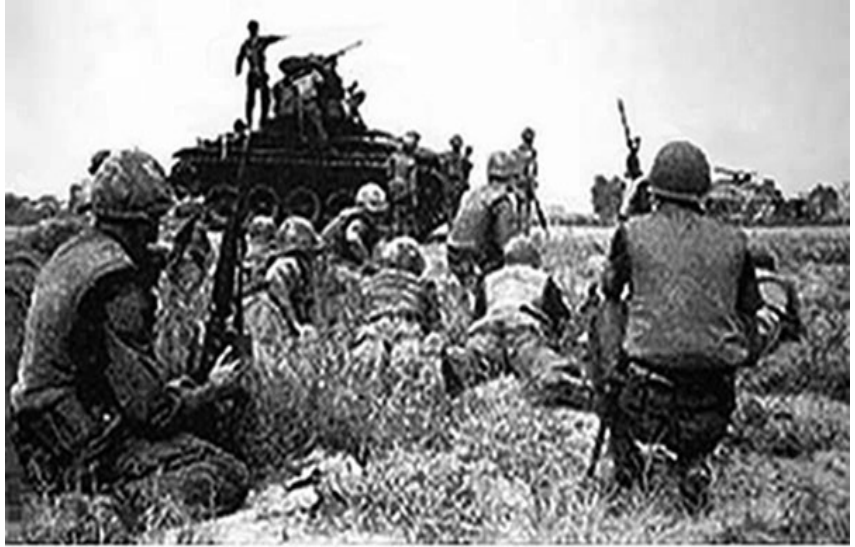
Members of the 377th SPS, supported by armor, move to resecure Tan Son Nhut AB after penetration by Communist forces on January 31st, 1968.