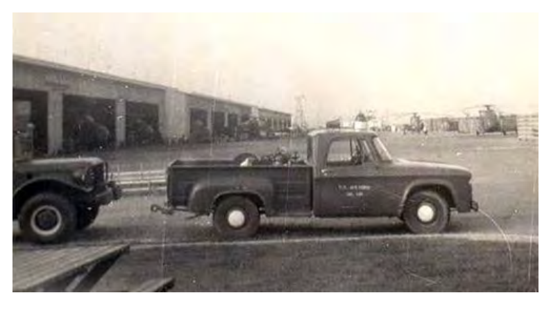
12. Fire chief's truck.