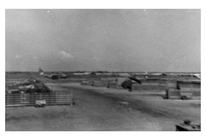
9. Helicopter reventments at Binh-Thuy AB 1968.