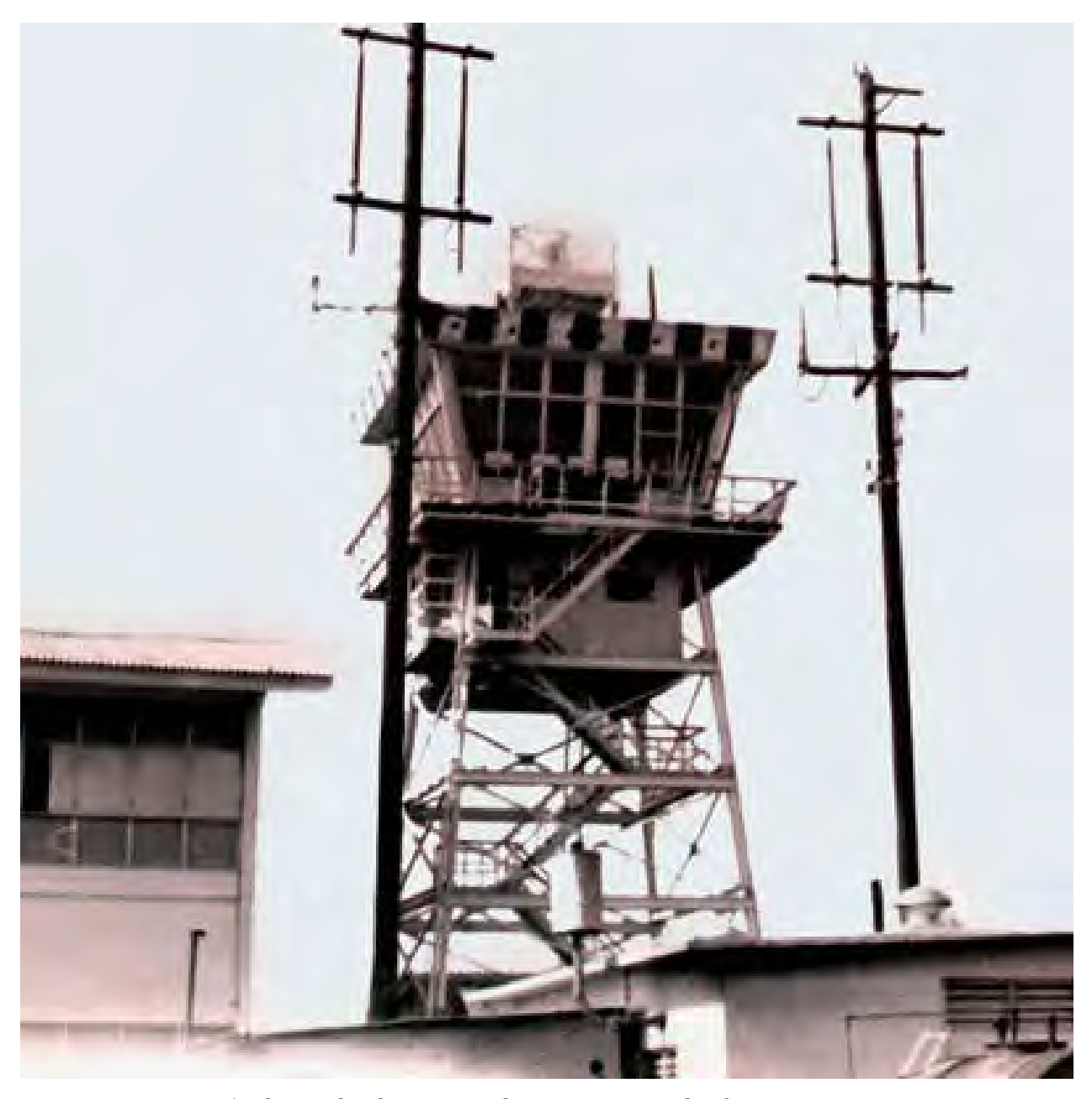
25. The Binh-Thuy control tower next to the fire station.