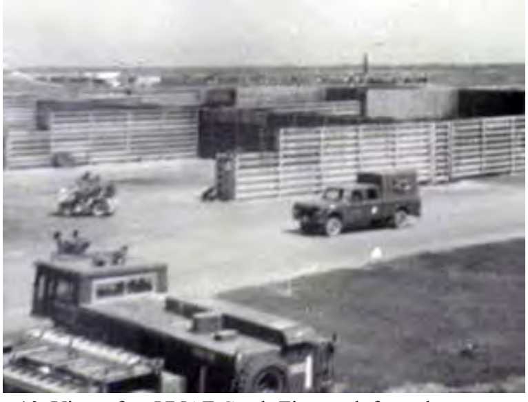
10. View of an VNAF Crash-Fire truck from the second floor of the fire station.