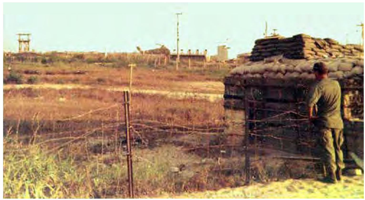
15. (above) Front gate bunker at Binh-Thuy 1968.

16. (right) Guard Tower-2 looking at Tower-3 at the Hilton compound 1968.