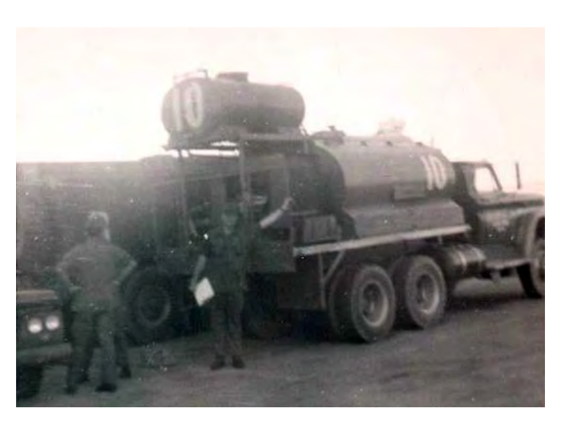
7. We modified a water tanker truck so it could foam the runway.