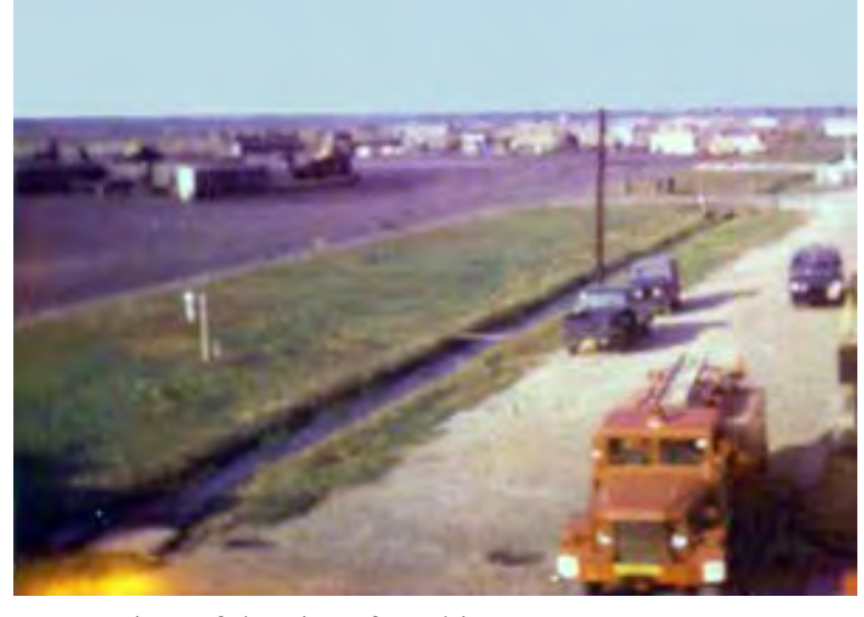
11. View of the aircraft parking ramp.