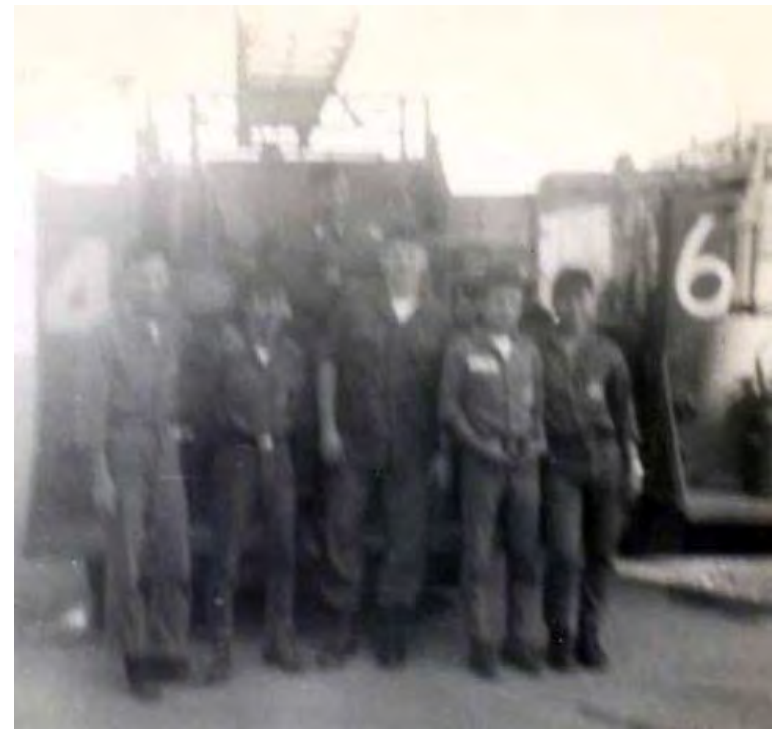
5. P-2 Crash-Fire truck going through check list at shift chang. Me with Vietnamese Firemen and their pumper fire truck.