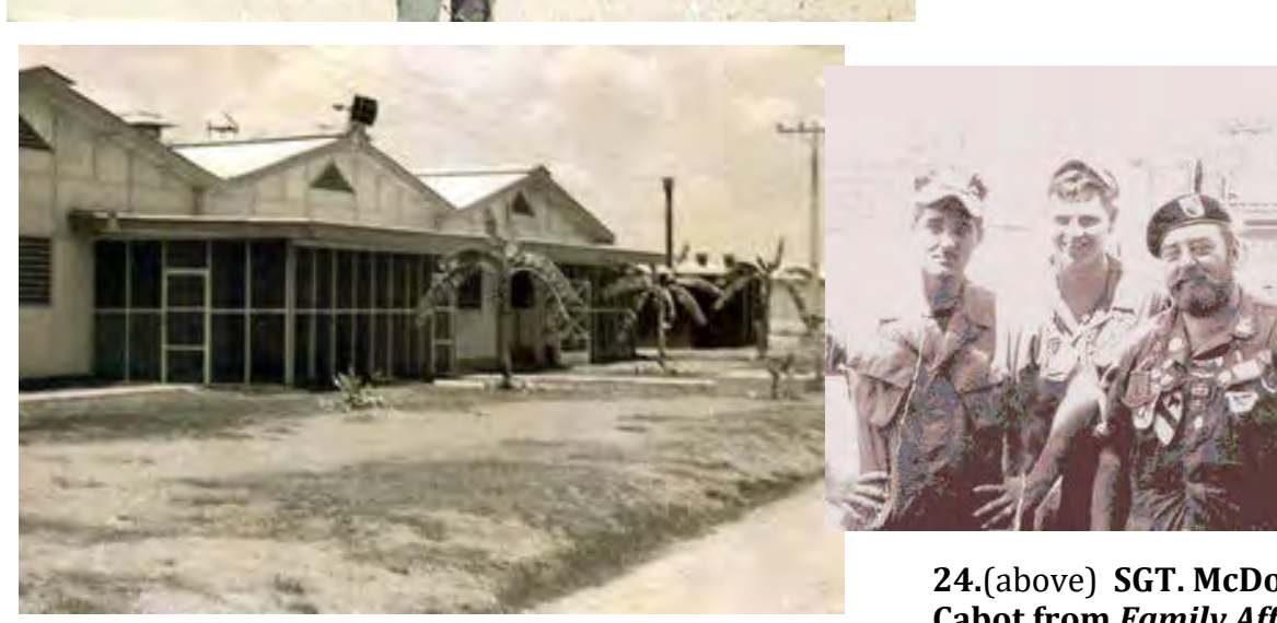
23. The new modern chow hall at Binh-Thuy.