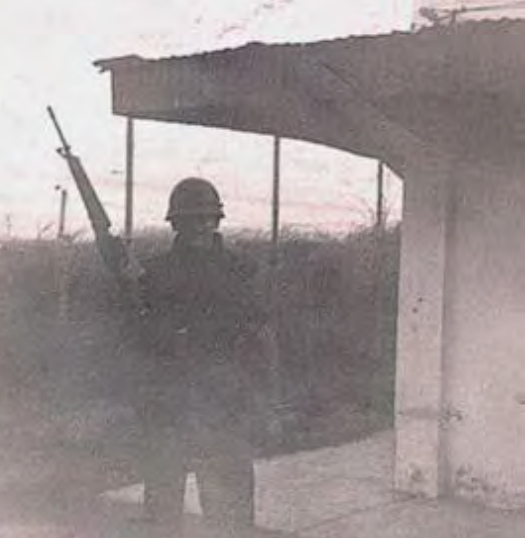
18. (above) Me at the Hilton Anex compound going onto tower guard duty 1968.