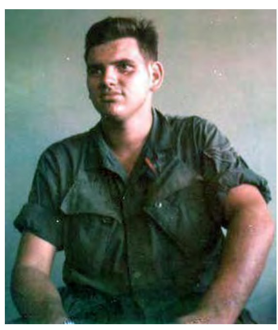
3. Fireman doing his check list on a P-2 Crash-Fire truck. 4. Me getting after the morning mortar attack on Jan.