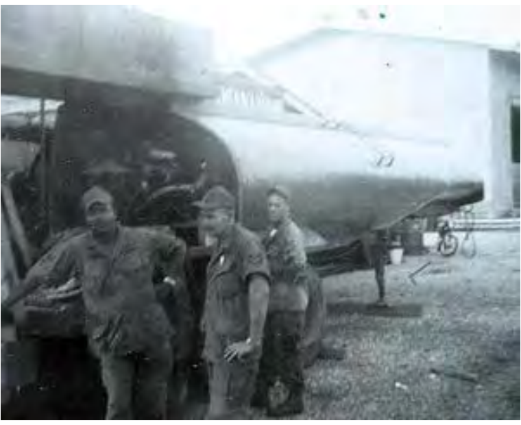
8. Firemen by a larger converted fuel tanker for foaming the runway faster.