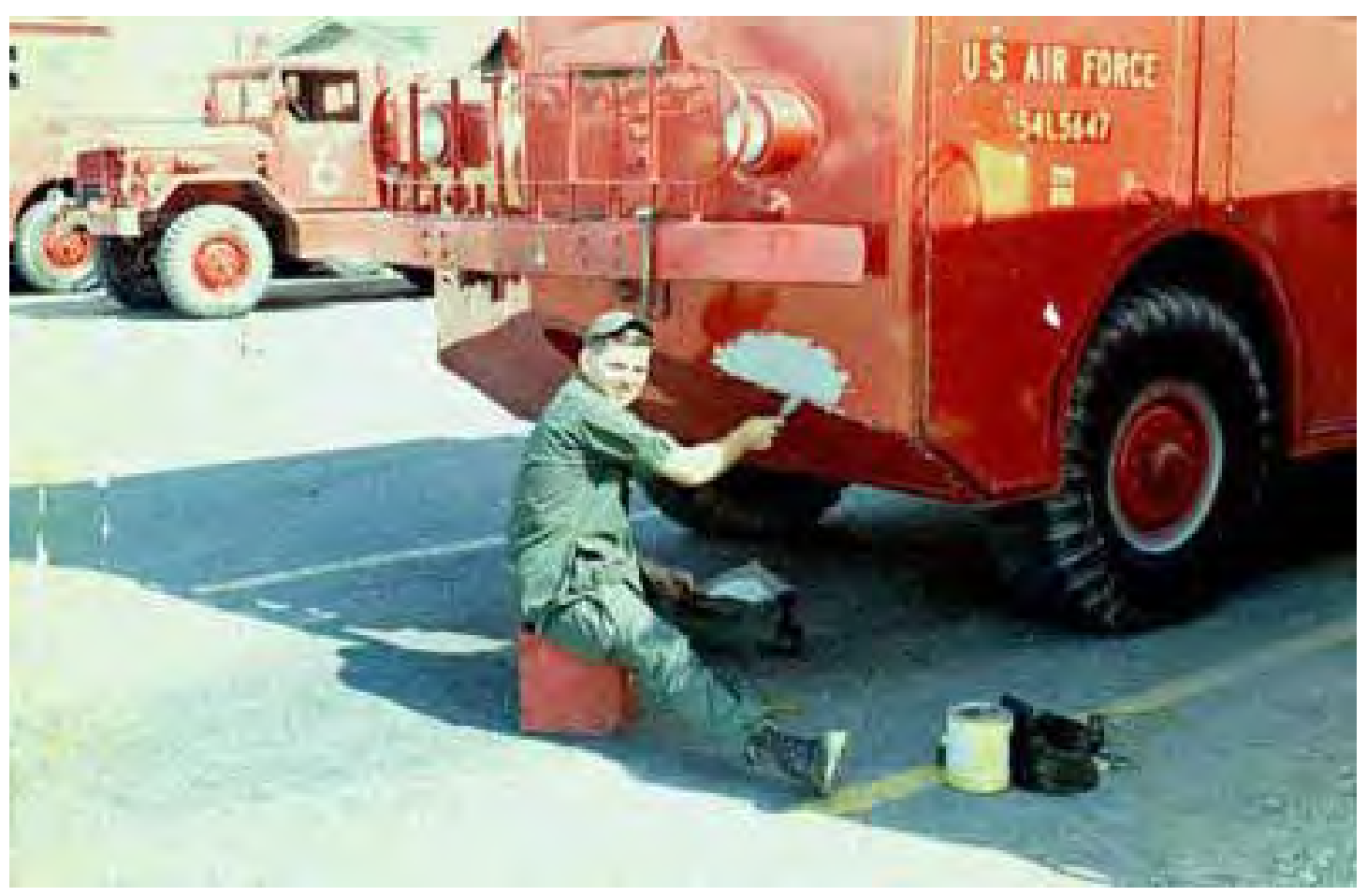
2. Me patching up shrapnel holes from a mortar attack 1969.