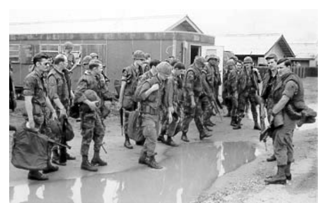
013. Early guard mount for devil Flt during Tet.

012. Looking for a treat... "Sweet Pea" Devil Flt mascot, probably went by a few other names too.