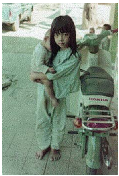
016. Little girl with baby in Can Tho.