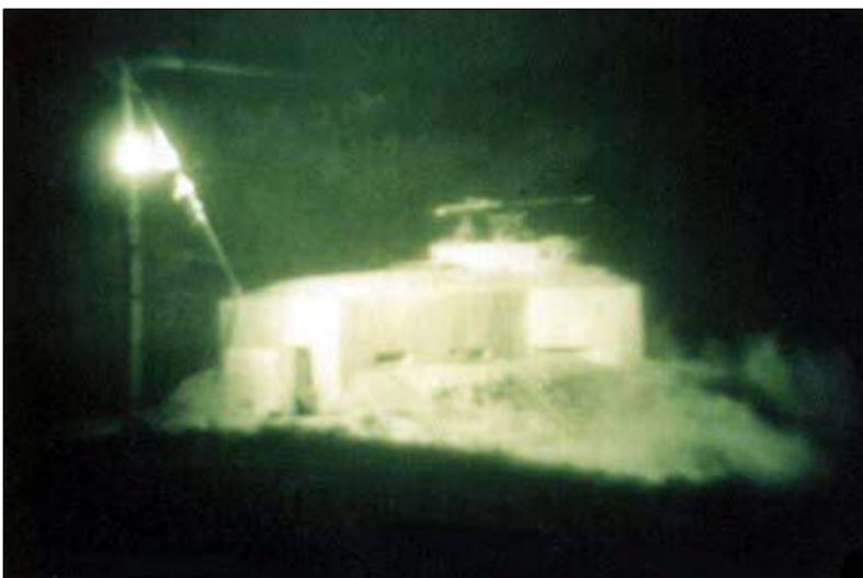
2) Night: Photo of 50 cal. Perimeter pill box, taken through Starlight Scope.