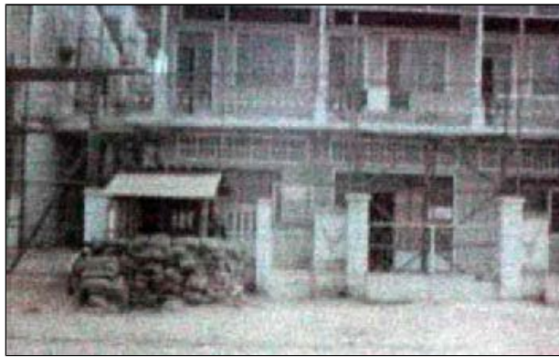
10) A picture of Hotel #2 that some of us were privileged to stay at before going to barracks. This is in City of Ben Xe Moi, 6 miles from Binh Thuy . Dec 13 1967- Jan 29 1968