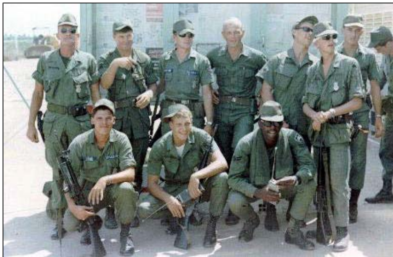
5) The 1967-1968 Gang, in front of Central Security Control.