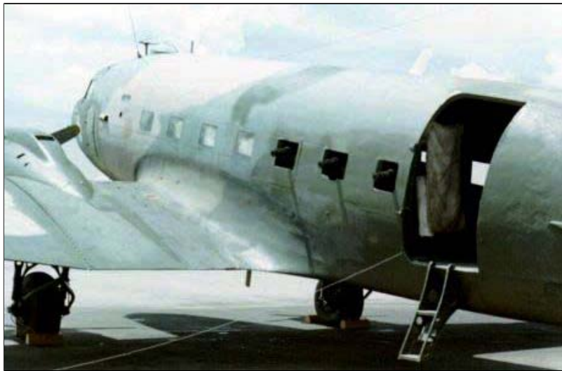
3) Side view C-47 SPOOKY gunship.