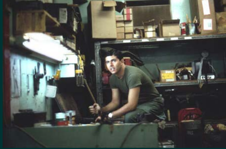
Photo 32) I don't recall his name, but he worked in the Armory, adjacent to CSC;