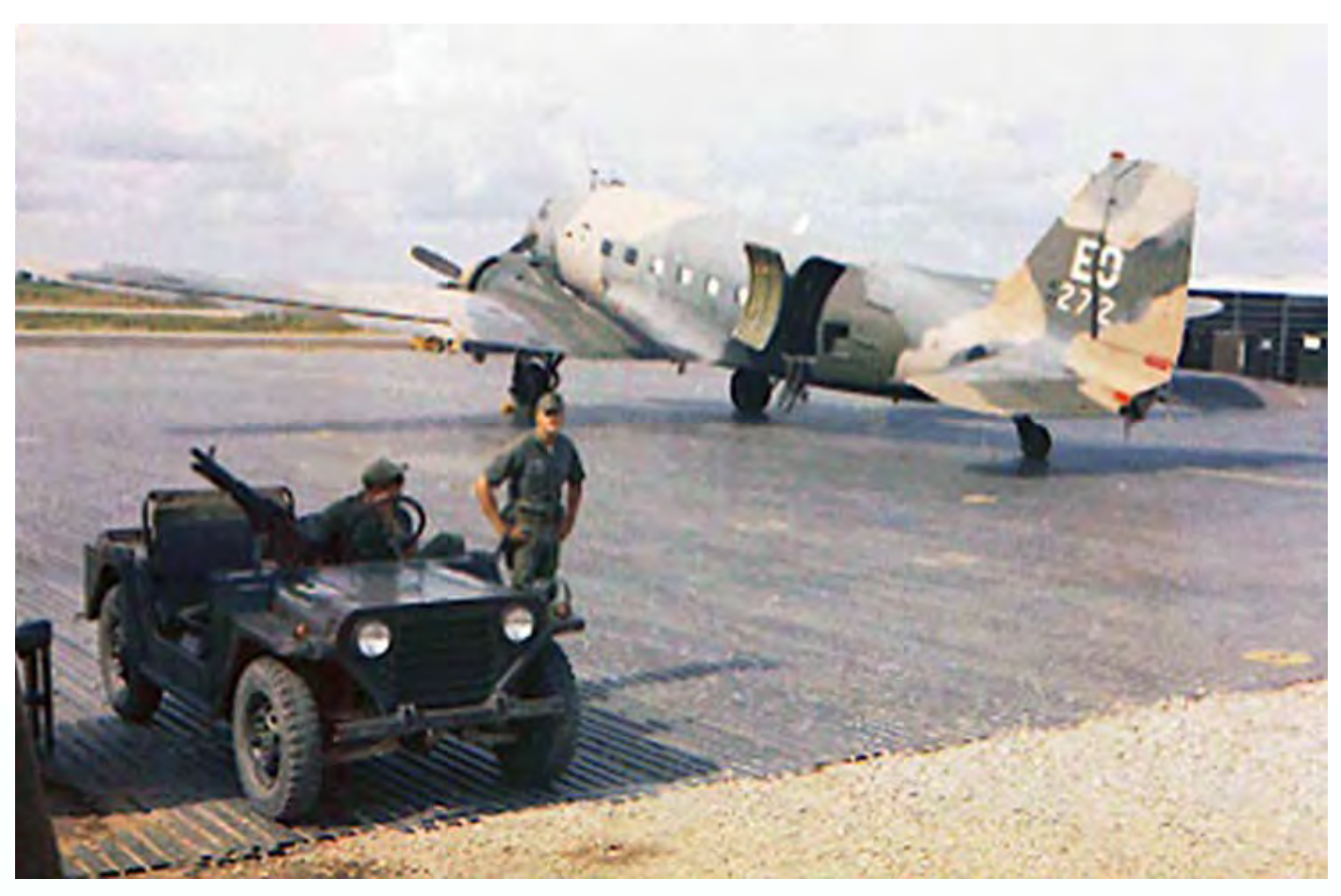
4) C-47 parked on flightline. QRT jeep with M60 trying not to look like he's BS'n with me.