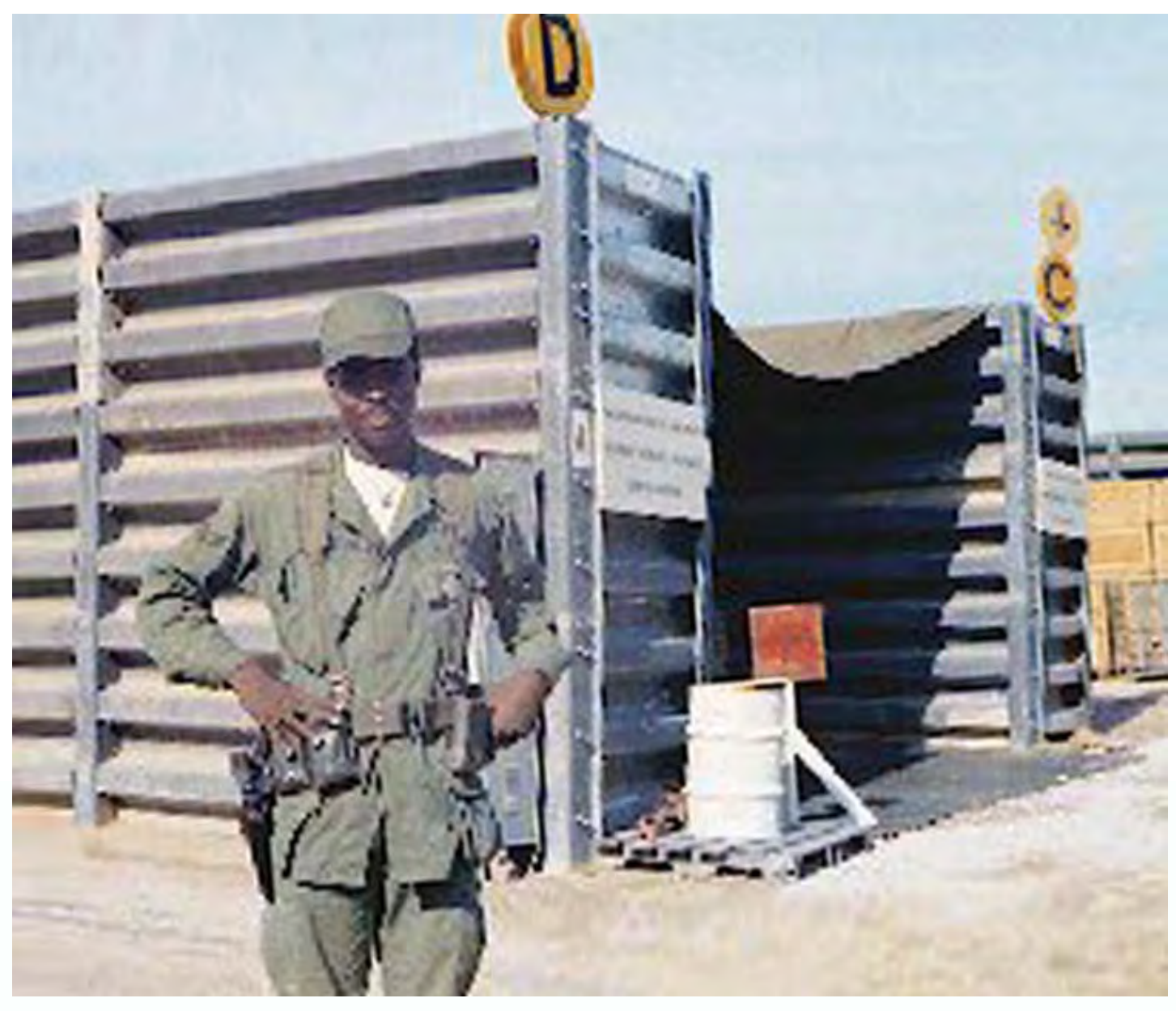
6) SP at Ammo Area.