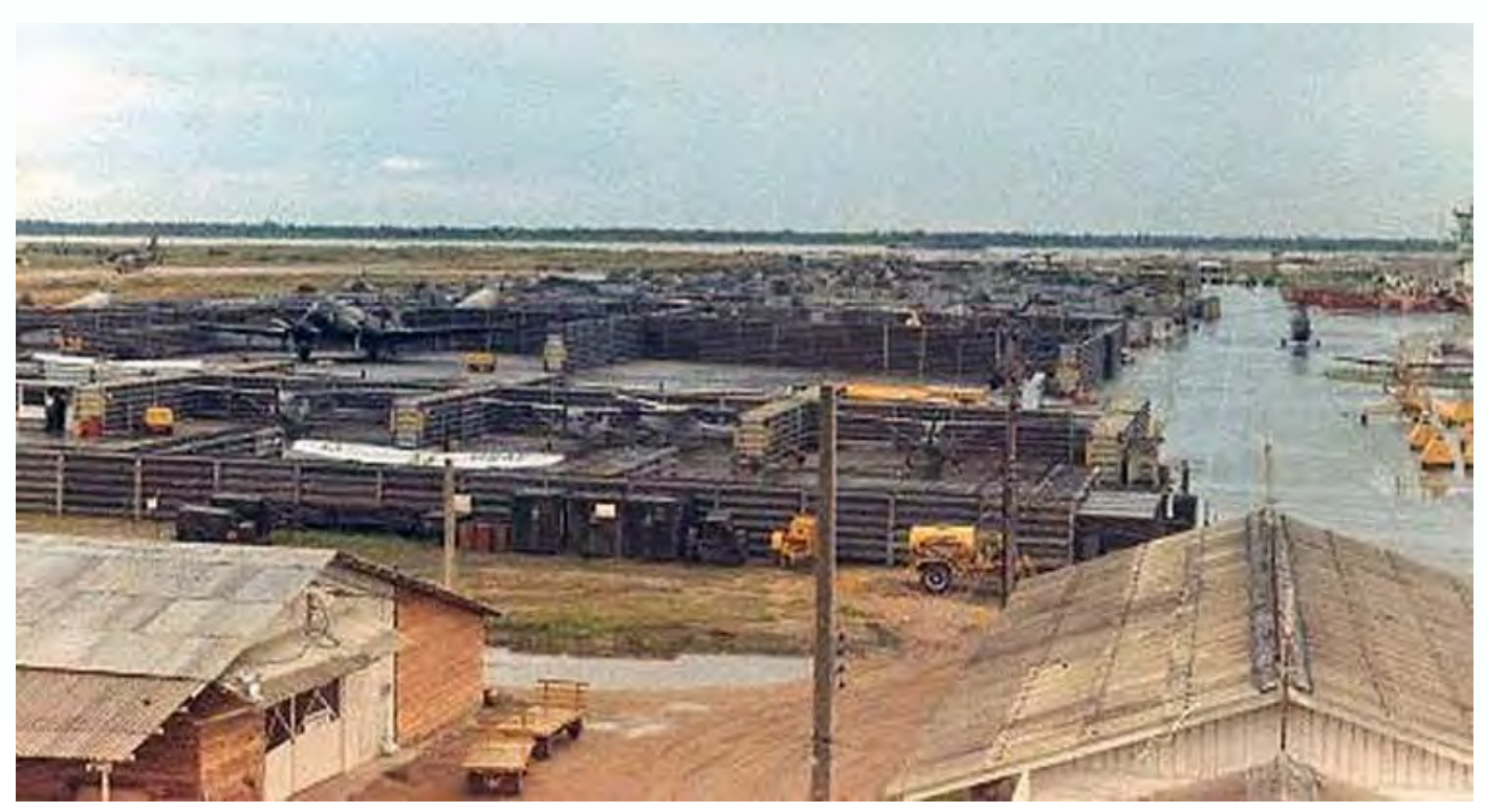
3 ) Binh Thuy AB Flightline.