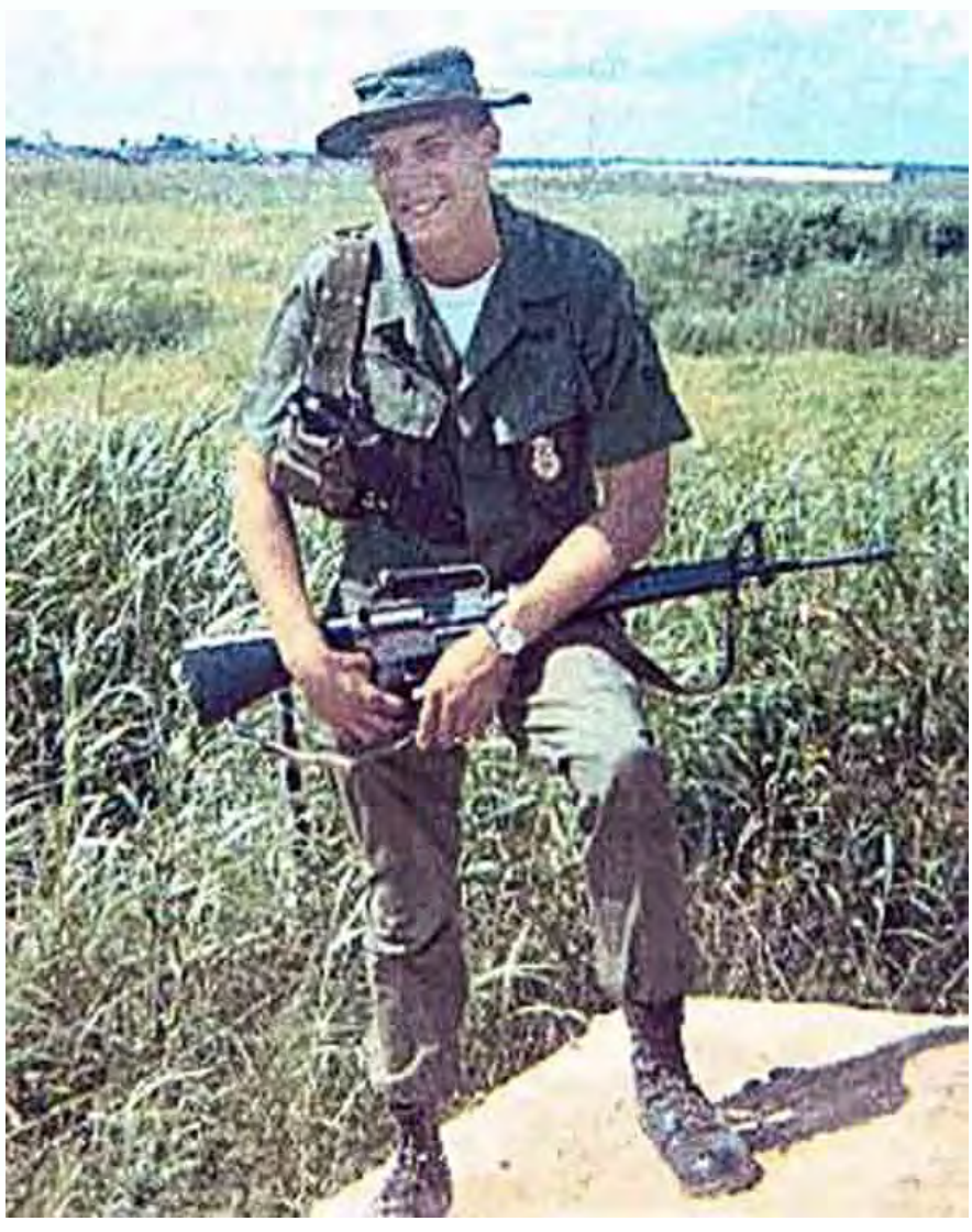
16 ) Another hot day.