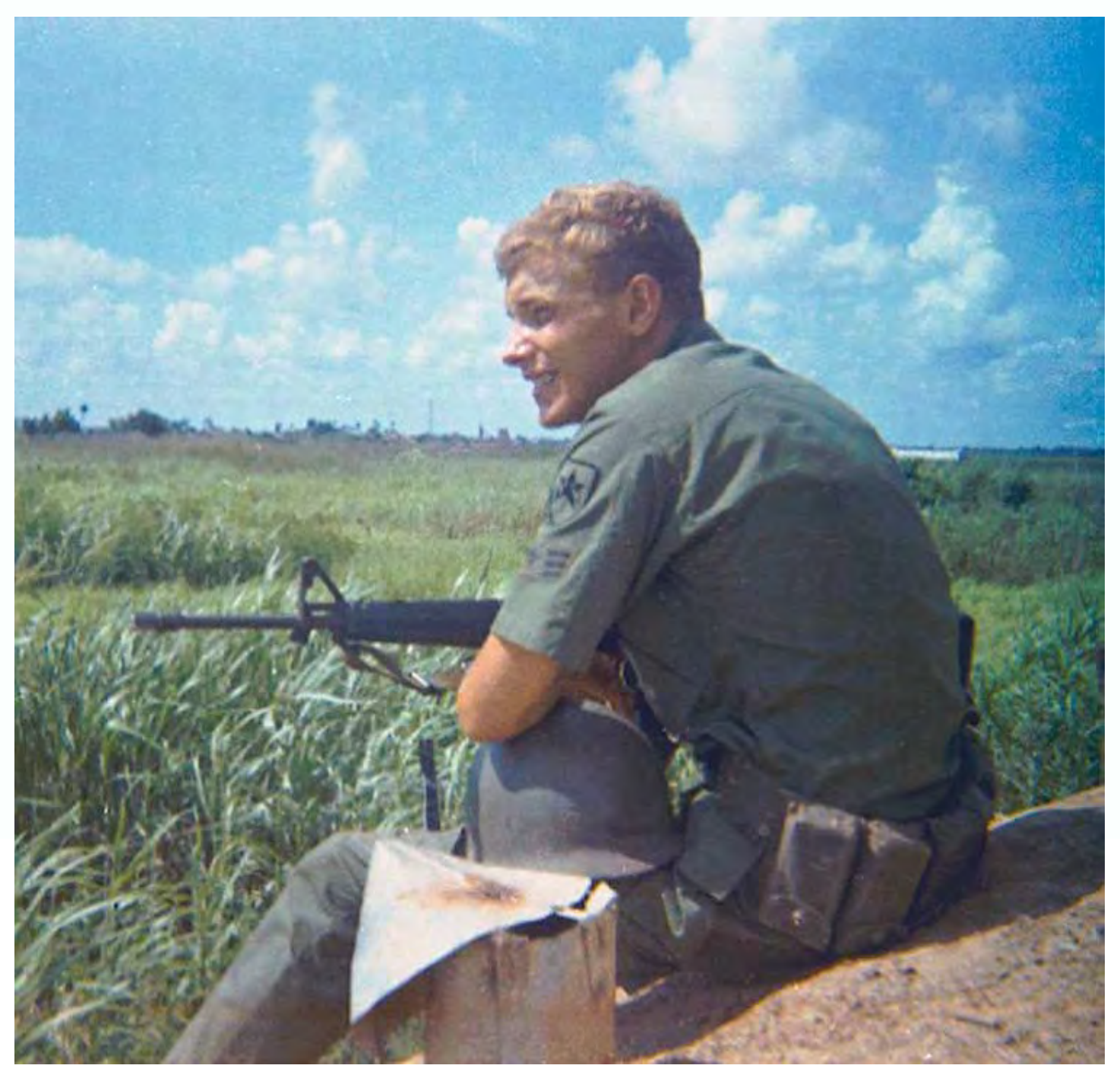
15) On Bunker Watch.