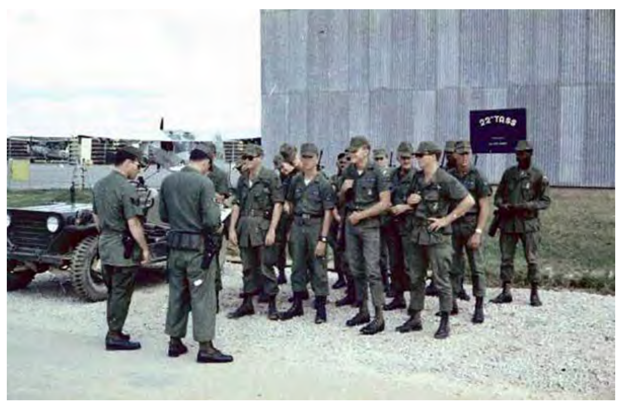
2) Guardmount. (Recognize anyone?)