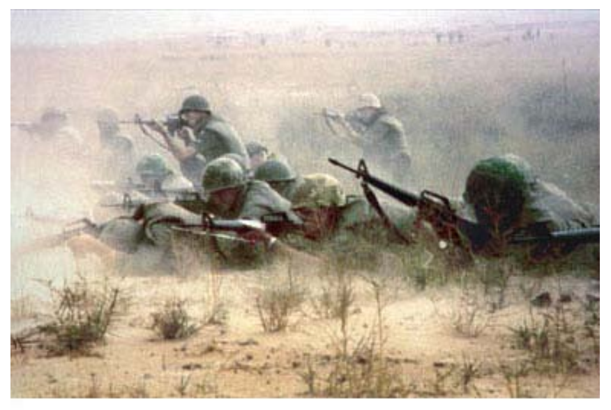
Members of the 377th SPS open up on Communist forces who infiltrated Tan Son Nhut AB during the Tet 1968 Offensive.

Tan Son Nhut Air Base: The NVA/VC attacked with four infantry battalions and a sapper battalion, their losses being <u>962 killed</u> and <u>9 prisoners</u> <u>taken</u>. The US losses were 19 US Army killed, 75 wounded, USAF losses 4 killed, 11 wounded, ARVN losses were 32 killed and 79 wounded. damage inflicted was 13 aircraft damaged.