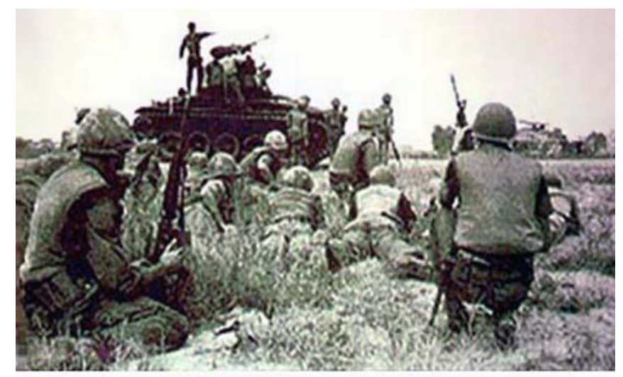
Members of the 377th SPS, supported by armor, move to resecure Tan Son Nhut AB after penetration by Communist forces on January 31st, 1968.