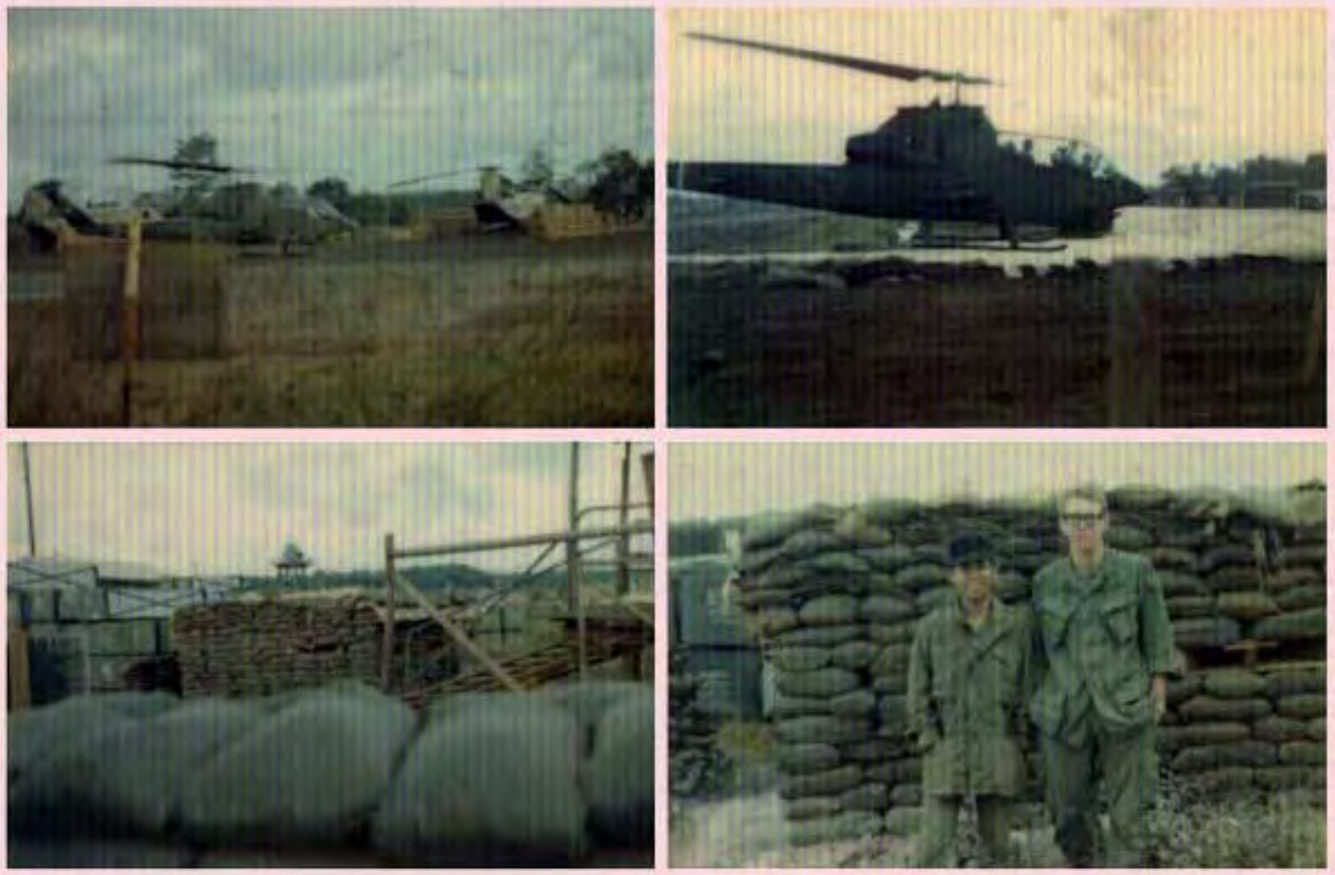
7) Above: Cobra Gunships.