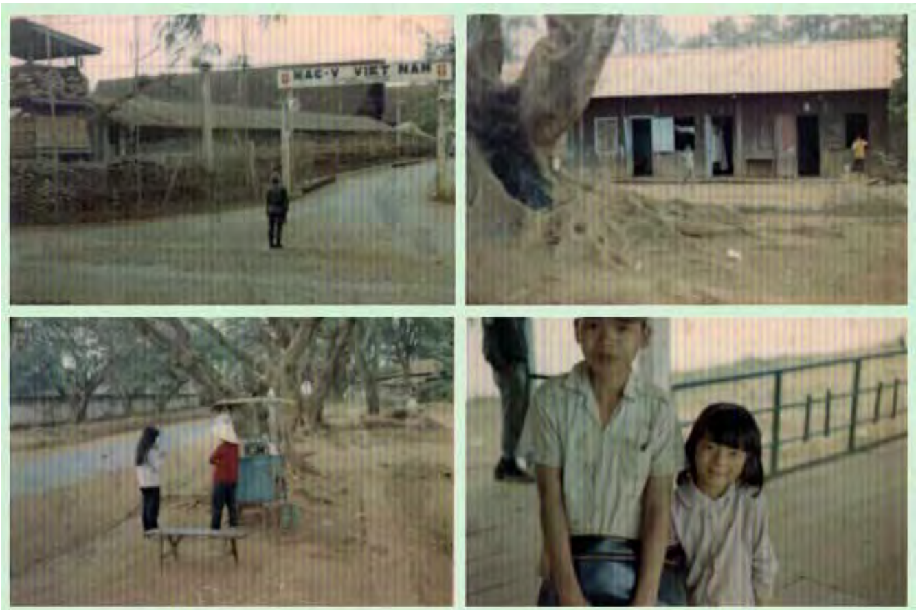
15) Mortar damage. Top Left: That is an inert 122 Rocket I am standing next to. They were rather large especially when compared to a 81MM mortar!