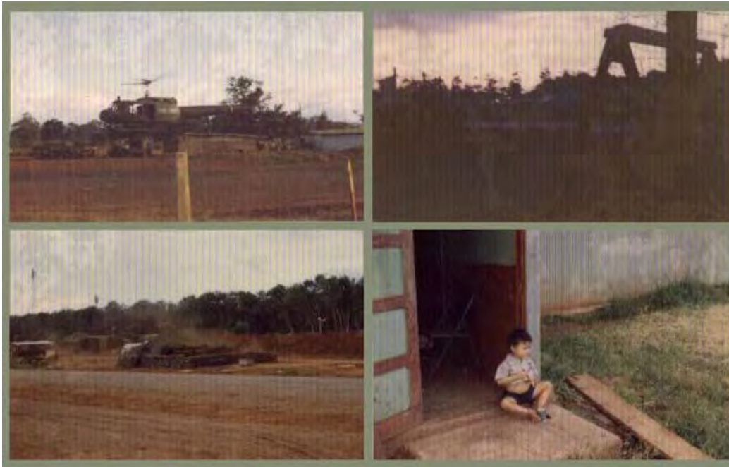
4) Camp Coryell. Red dust blowing everywhere!