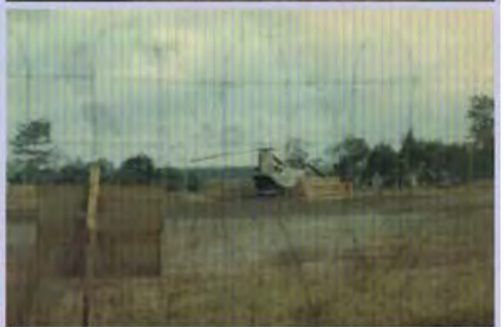
3) Camp Coryell, Detachment-9. Home of the 155 (AHC) Aviation Helicopter CO: gunships and slicks. Within that area was a detachment 9/619th Tactical Control Squadron, USAF (maintained separation in flying aircraft and artillery).