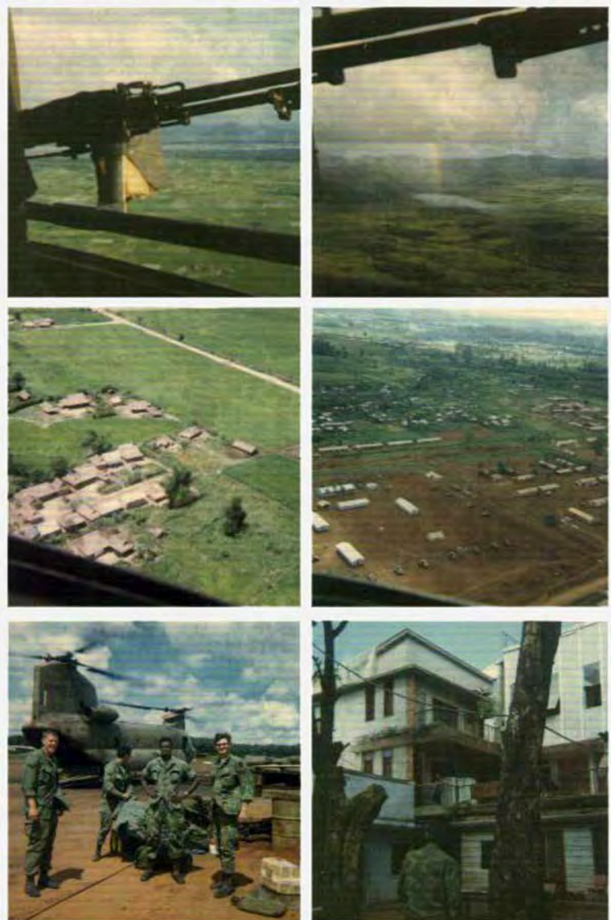
1) Arrival at Ban Me Thuot Air Field: I volunteered for Vietnam and arrived at Tuy Hòa Air Base in late June 1969. About 25 miles away was the provenance capital, central highlands, Ban Me Thuot, not far from the Cambodian border.