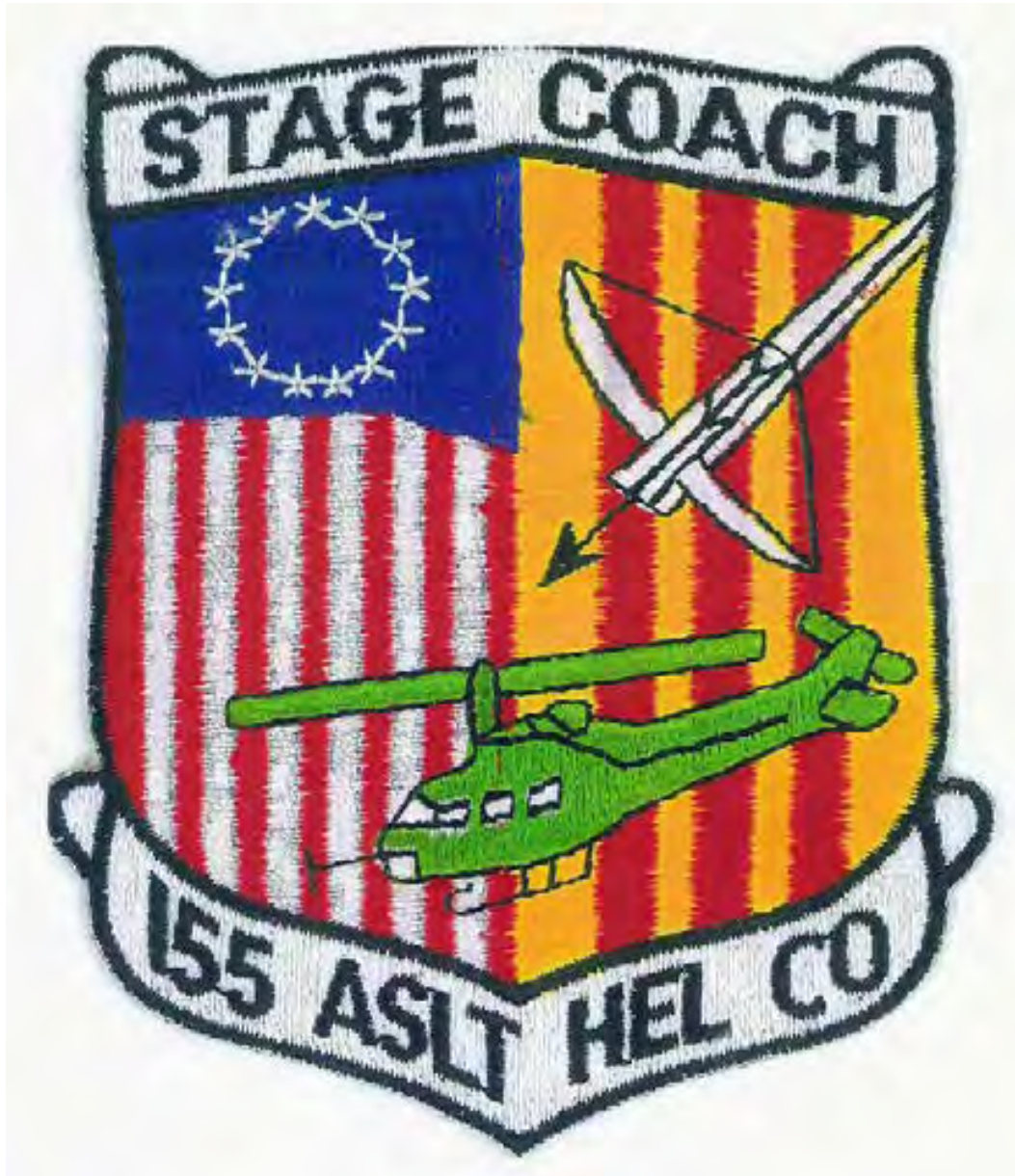
20) Patch: 155th Assault Helicopter Co