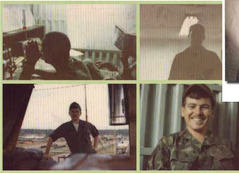
16) SPS Det-9.