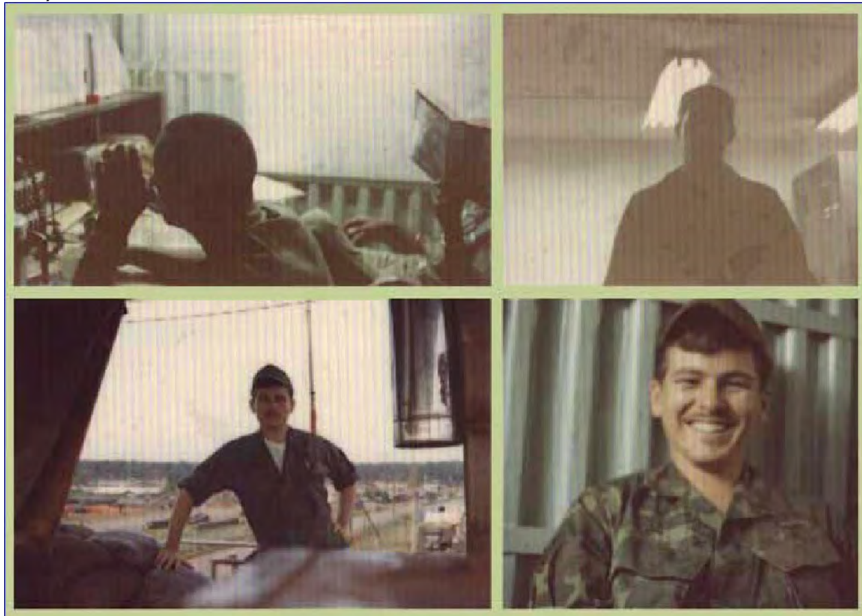
20) SPS Detachment-9.

6 Pacific Stars & Stripes Sunday, Dec. 21, 1969