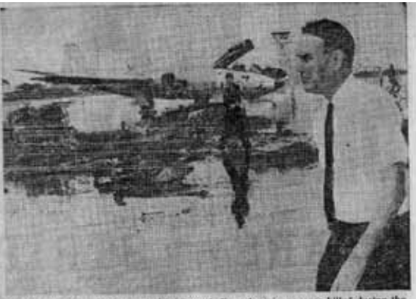
Barracks at Bien Hoa AB near Saigon suffered direct hits by communist Viet Cong mortar fire, Ambassador Maxwell D. Taylor (right photo) visits the air base Sunday morning. Wreckage of destroyed bombers is in background. Four Americans were killed during the attack.