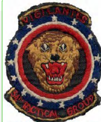
34th Air Base Group, Air Police Squadron, Bien Hoa AB/ Qui Nhon AB (1964-1965), 6220th Air Base Group/33rd Tactical Group APS Tan Son Nhut Air Base (1962-1963)

TSN, 6220th APS; BH, 34th APS; QN, 34th APS 1962-1963; 1964-65