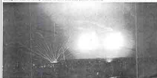
BATTLE OF BIEN HOA AB, JAN 31, 1968