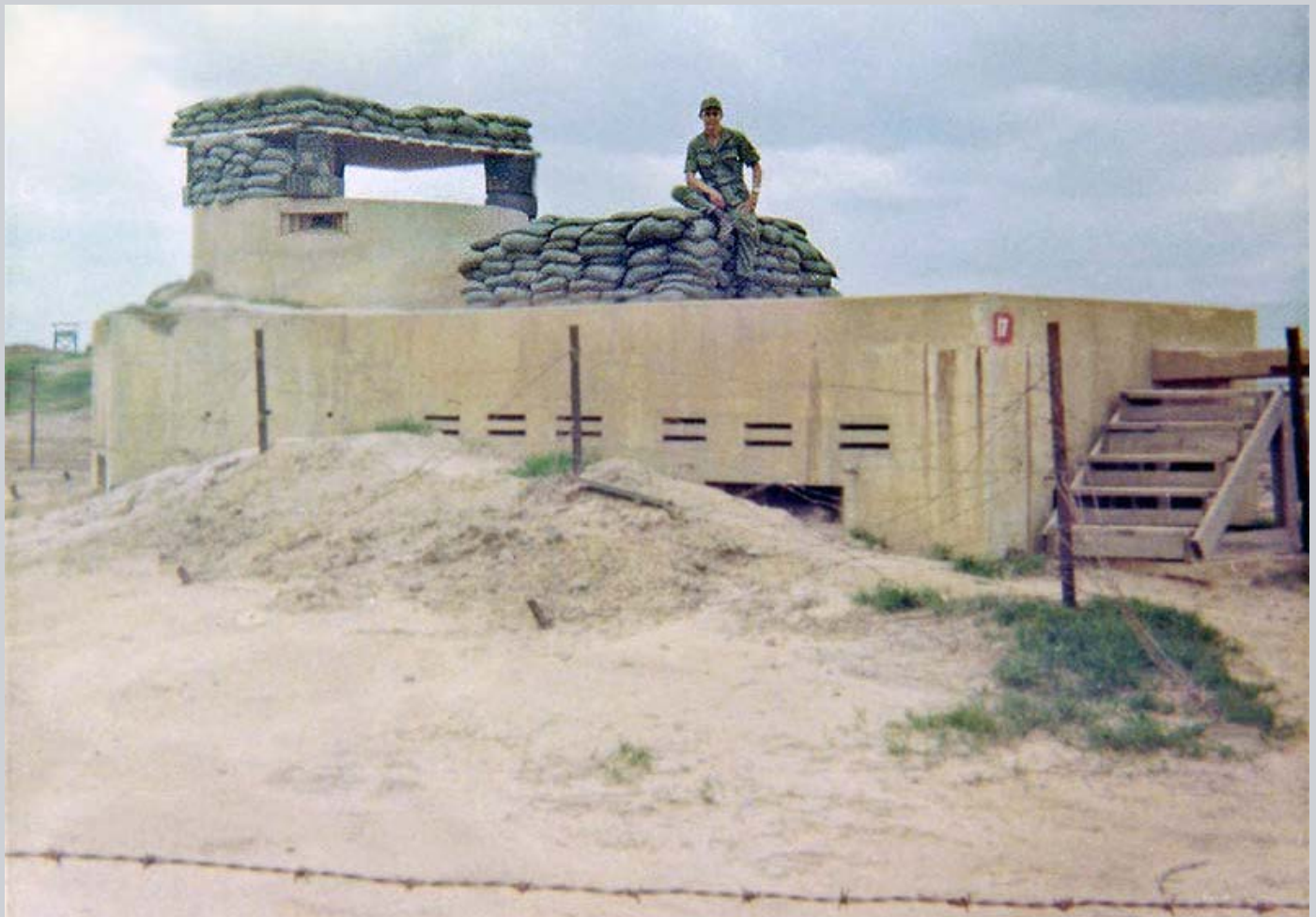
8. Biên Hòa AB, Bunker-17. Tower (center-left) 1966-1967.