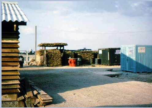
9. Biên Hòa AB, Armory Bunker.