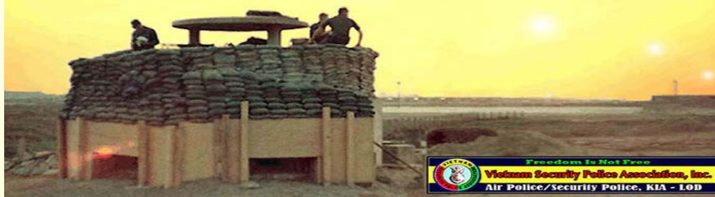
2. Biên Hòa AB, Bunker Hill-10. 1968. I took the photo just after Tet 1968.