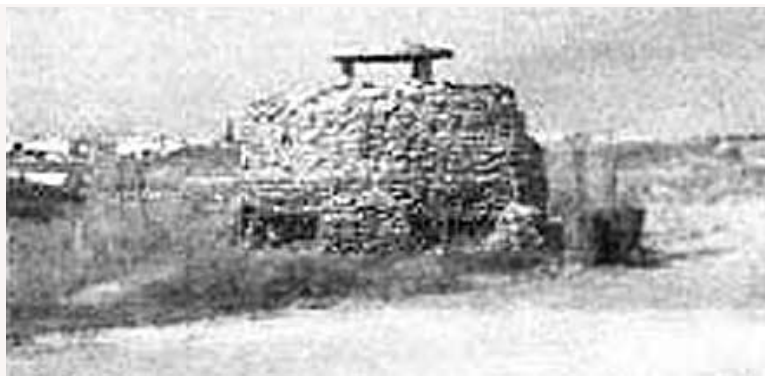
3. Biên Hòa AB, Bunker Hill-10.

1969-1970.