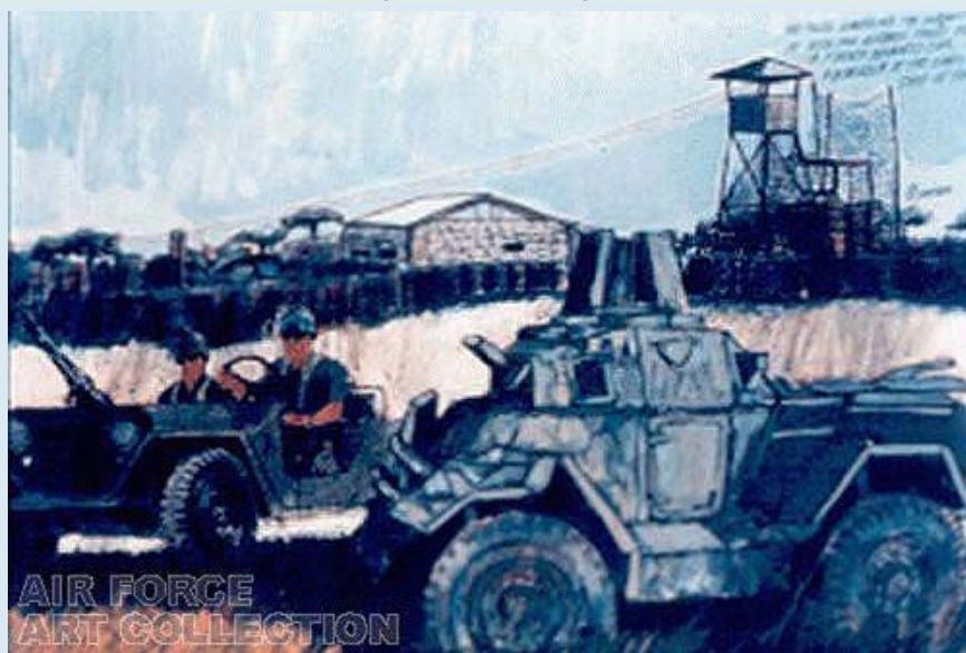
1. USAF: Air Force Art Collection. Tower, Bunker, Jeep, APC.