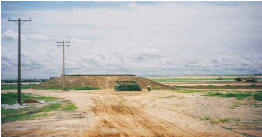
12. Biên Hòa AB, Bunker-1, with a shack next to it, looks like it may be ARVN or VNAF security.