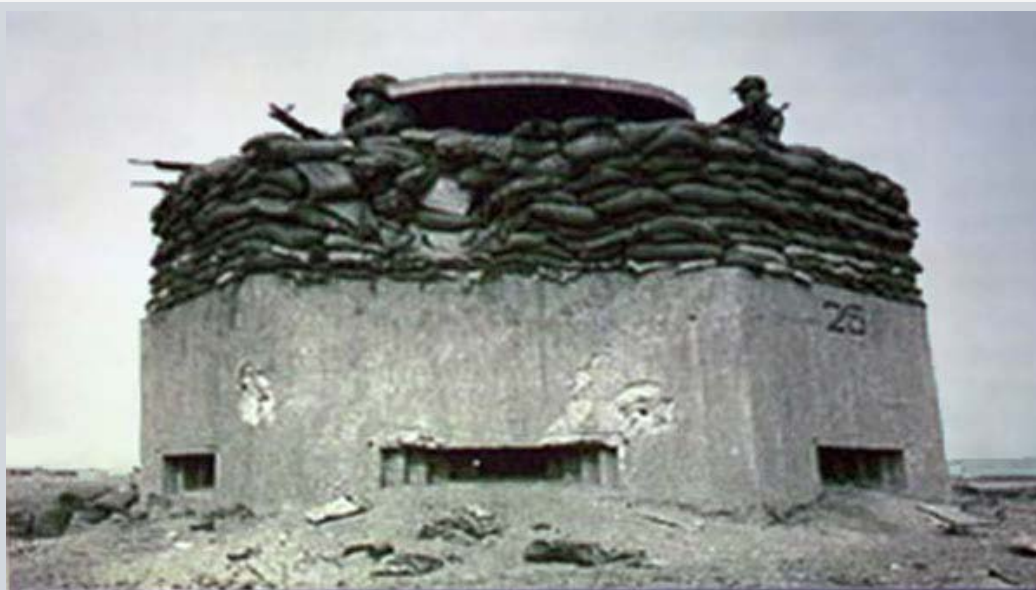
5. Biên Hòa AB, Bunker Hill-10 Perimeter Tower. 1968.