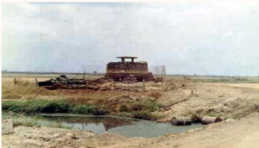
4. Biên Hòa AB, Bunker Hill-10.

1969-1970.