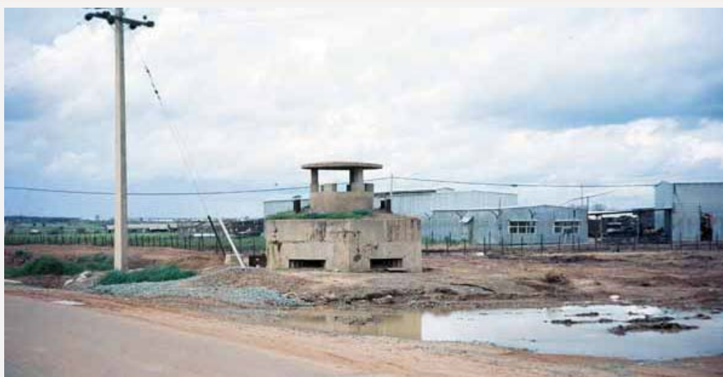
14. Biên Hòa AB, French Bunker-1 is a shot of the bunker across from the Red Horse cantonement area on the Southeast side of the base. We used it for late night hootenannies of beer, cigarettes and guitars. It was located between our barracks and the III corps Special Forces HQ.