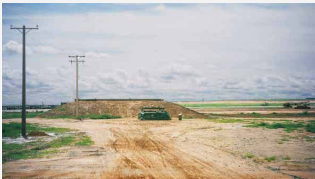
15. Biên Hòa AB, Bunker. The roofed sandbag bunker next to a large sandpile is also an American emplacement.