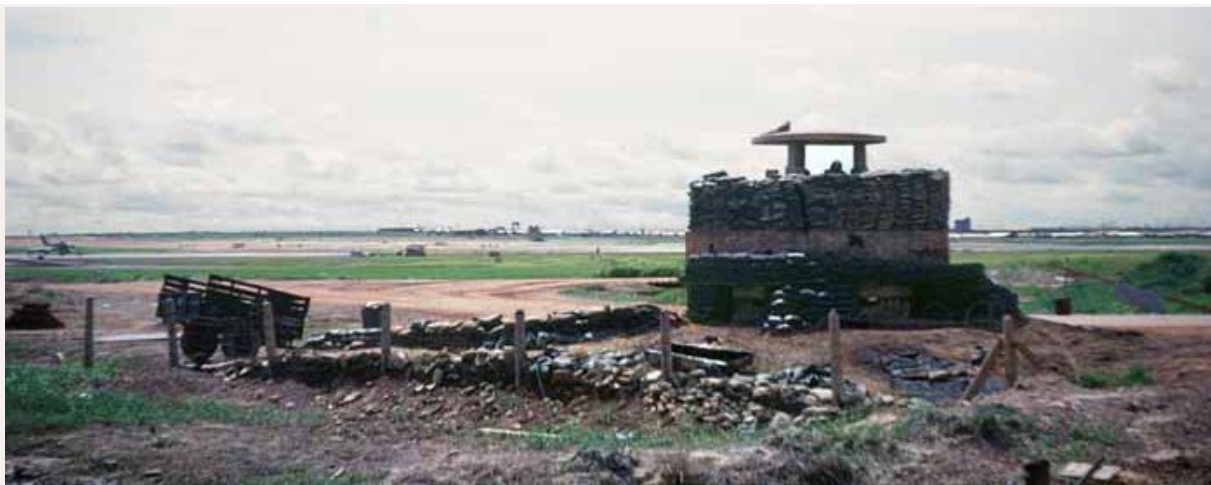
13. Biên Hòa AB, West Tower. Note the F-100 (extreme left-center), apparently being worked on. Bunker is on the West end of the runway and manned by USAF personnel. I think one of the armored cars hung out in this vicinity during alerts.