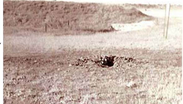
Photo Right, by Paul Huff., 6251st SPS: 122mm crater, taken AUG 1 1972, 150 feet or so behind Bullseye-7 in Bomb Alley (north perimeter), just missing a revetment full of 500 pounders.