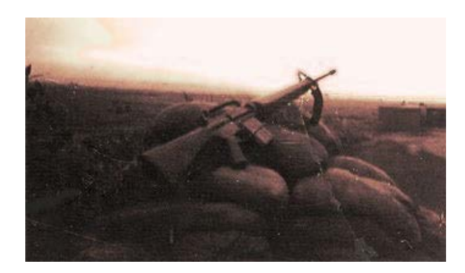
Oct 22, 1972 (sunrise): Sandbag post position, between flight line and Baker-2 , in the Bomb Dump area. We were hit by Rockets and Sappers. These posts were new dye ti ab ubcrease ub ebent activity and after the attack. My M16 was #057.

Sep 10, 1972: I took this photo while on SAT patrol while searching for sappers. Bullsyes-9, north perimeter.