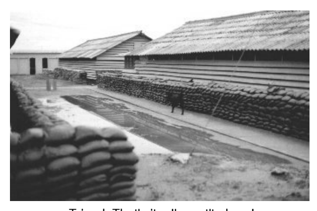
Tripod: That's it... I'm out'ta here!