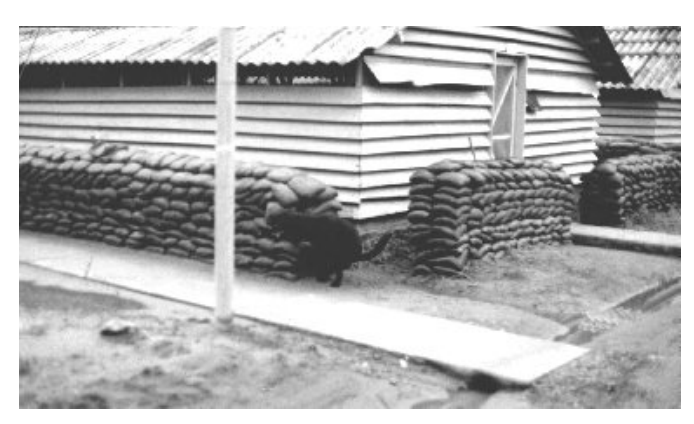
Tripod: Is there no privacy anywhere?

I'll never forget the day I had to shoot a dog.